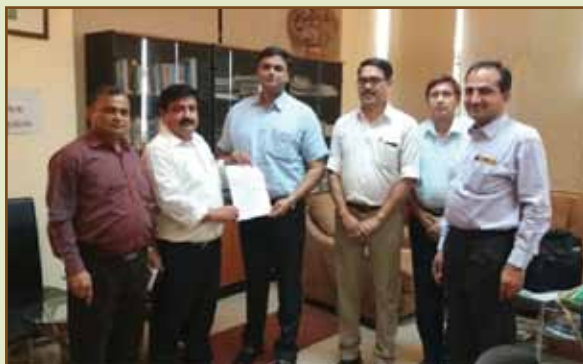
The signing of MoU between HSDM, Govt. of Haryana and FDDI, Rohtak

As per the MoU, FDDI will train unprivileged and unemployed youth in the areas of leather cutting and shoe upper stitching.