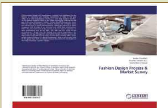
The book written by faculties of FDDI

by LAMBERT Academic Publishing in first week of September in 2017.