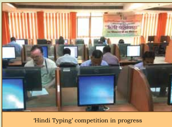
'Hindi Typing' competition in progress

FDDI is determined to motivate the staff to use Hindi increasingly for official purposes and similarly for the students to use Hindi in their day-to-day works.