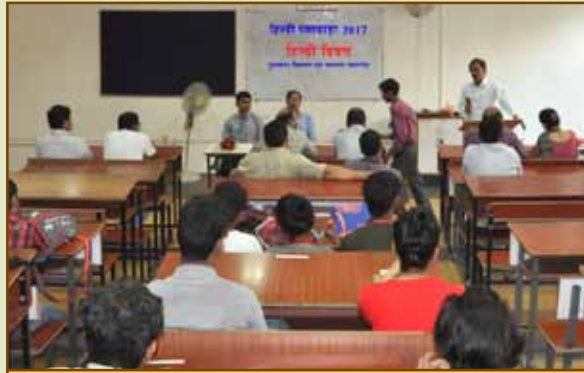
A view of the prize distribution ceremony at FDDI, Fursatganj campus