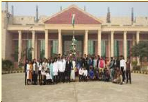
A view of flag hoisting at FDDI, Patna campus