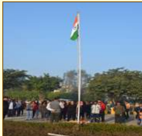
A view of flag hoisting at FDDI, Rohtak campus