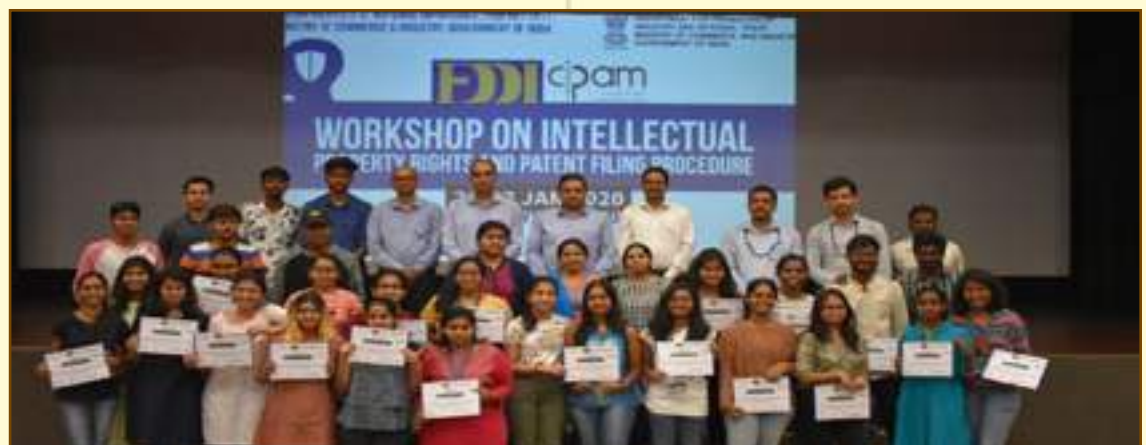
A view of the participants

The information provided during the session was successful in bringing greater clarity on understanding of the otherwise clouded topics of IPR. In the field