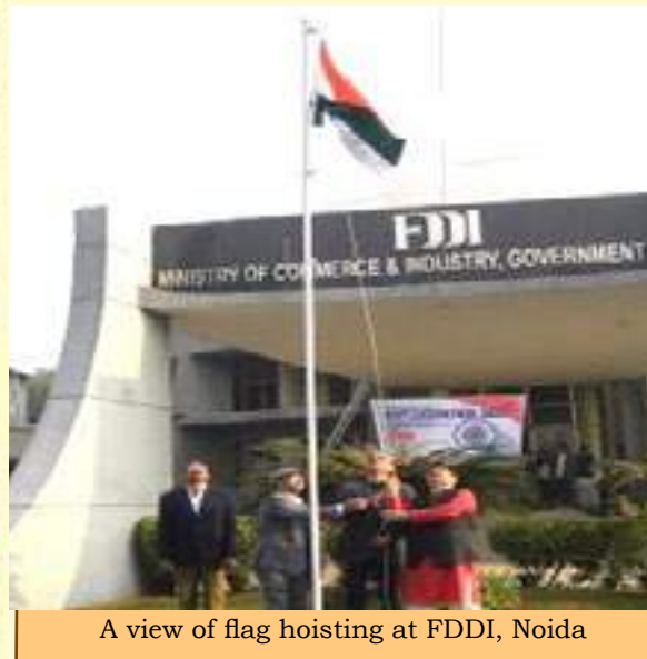
A view of flag hoisting at FDDI, Noida

democratic republic country and the Constitution of our country came into force.