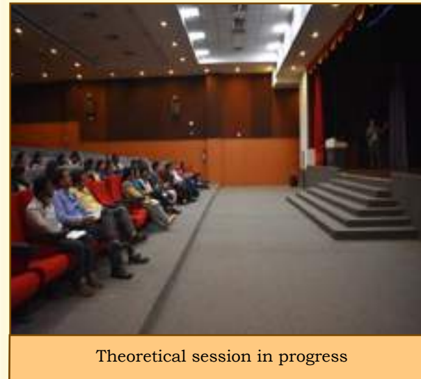
Theoretical session in progress

The sessions conducted on 21 st & 22 nd January 2020 by Mr. Sukhdeep