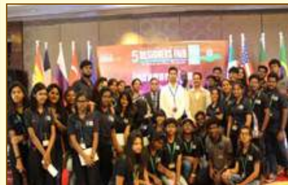
FDDI students who provided offstage support during Leather Fashion show

The students of FDDI displayed a wide range of creations at its stall located at Convention Centre O9-A that included ladies and gents shoes, casual and formal footwear and sports shoes, fashion accessories, leather goods - travelware, belts, portfolios, handbags and wallets.