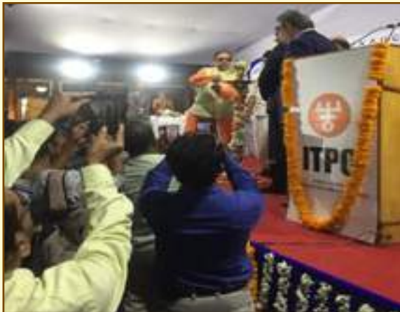
Lightening-up of the inaugural lamp

Footwear Design and Development Institute (FDDI) participated in the 35th India International Leather Fair (IILF-2019), which was held between 31 st January to 3 rd February 2020 at Chennai Trade Centre, Nandambakkam, Chennai