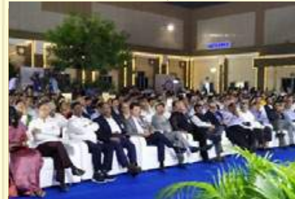
A view of the inauguration session of 35 th IILF