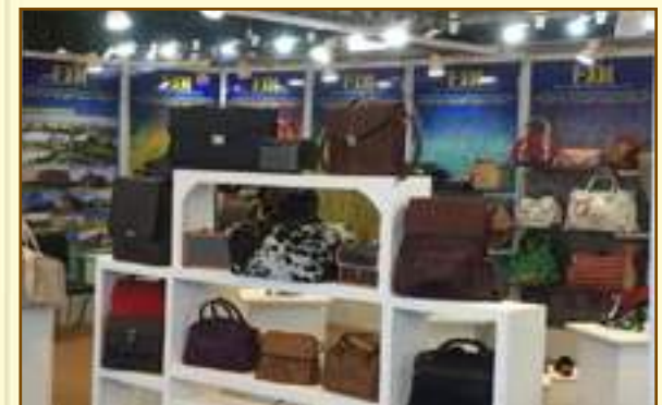
A view of the stall of FDDI

Over 450 companies from India and abroad, including about 130 exhibitors from overseas displayed their products.