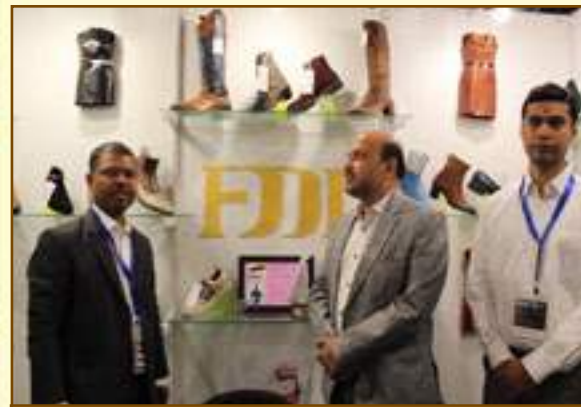
A view of the stall of FDDI at the Designer's Fair

FDDI displayed a wide range of creations at its stall at Designer's Fair. The stall was visited by popular overseas and Indian designers.