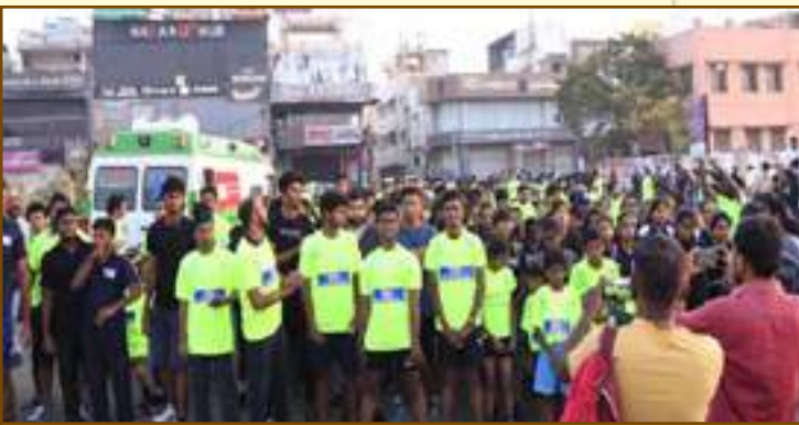
A view of the 'Run to save Girl Child'

Footwear Design & Development Institute (FDDI), Chennai campus organized marathon 2020 'Run to save Girl Child' on 16 th February 2020 at Elliot's Road, Beasent Nagar Beach, Chennai at 6.00 AM.