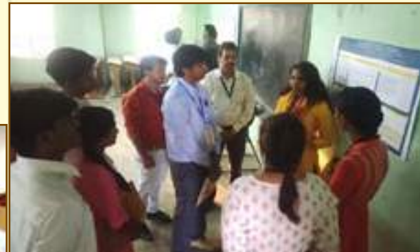
Poster Presentation by FDDI Hyderabad students & faculties during 'ICHFNTT-2020'