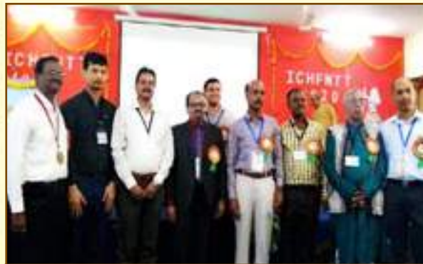
FDDI Hyderabad faculties with ICHFNTT-2020 Scientific Committee

Two research papers were presented by the students and faculties of Footwear Design & Development Institute (FDDI), Hyderabad campus during the International Conference on Handloom, Fashion, Non-woven and Technical Textiles (ICHFNTT-2020).