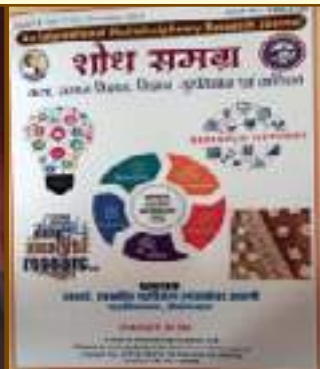
Cover page of the research journal in which the research paper of Mr. Vinit has been published

The conference focused on “New Dimensions in Research Techniques.”