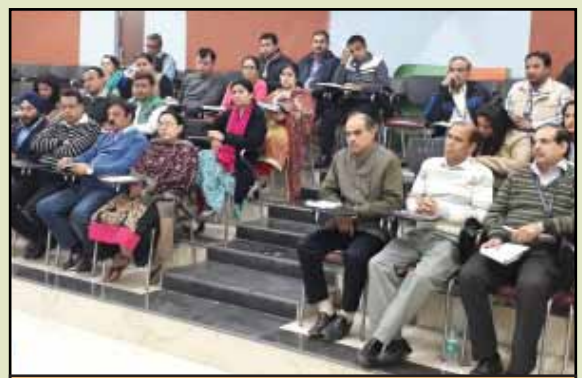
Staff of FDDI attending the training