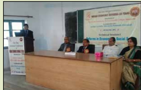
Paper presentation by FDDI staff during the National Conference

The conference that brought together thinkers from various walks of life including, economy & society was a perfect forum to discuss the various shades of the consequent economic reform process of the country.