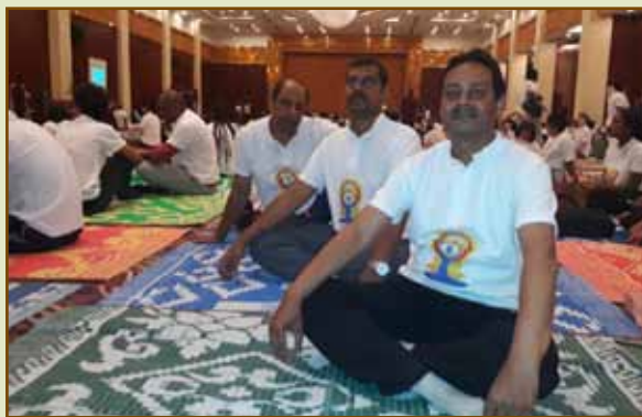
Staff of FDDI participating in the '3 rd International Day of Yoga' at Addis Ababa, Ethiopia

The staff members of FDDI also participated in the '3 rd International Day of Yoga' which was held at Addis Ababa, Ethiopia on 17 th June 2017.