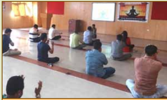
Staff doing asanaas at FDDI, Rohtak campus

FDDI, Rohtak has celebrated International Yoga Day on 21 st June 2017 with full fervor & Zeal. All the staff members have celebrated this day together while practicing various types of Pranayams, and asanaas. The staff members have also pledged that they will incorporate yoga in their day to day routine to get the maximum benefit out of it.