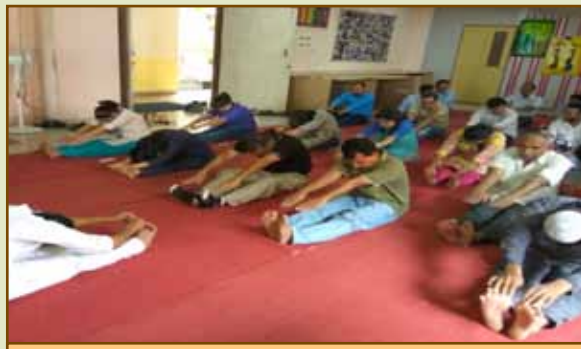
A view of 'International Yoga Day' celebrations at FDDI, Kolkata campus

FDDI, Rohtak has celebrated International Yoga Day on 21 st June 2017 with full fervor & Zeal. All the staff members have celebrated this day together while practicing various types of Pranayams, and asanaas. The staff members have also pledged that they will incorporate yoga in their day to day routine to get the maximum benefit out of it.