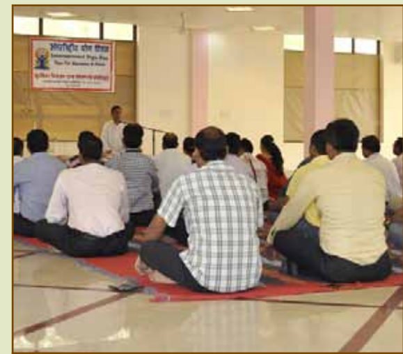
International Yoga Day' celebrations at FDDI, Fursatganj campus

The United Nation has declared June 21 st as the International Day of Yoga.