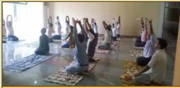
A view of 'International Yoga Day' celebrations at FDDI, Patna campus