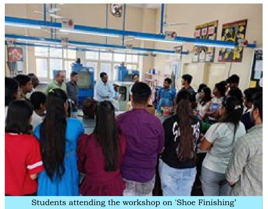
Students attending the workshop on 'Shoe Finishing'

and inking, polishing the edges of the sole and the heel through precise application of Gibra Chemicals.