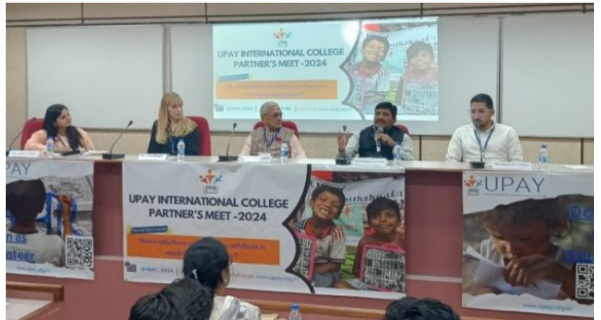
Panel discussion in progress

He stressed on inculcating ethical and moral values amongst students. He emphasized that cluster based models of job creation through tailor made training programmes need to be explored and conducted by institutions. He also briefed on the key barriers/challenges that colleges and institutes may encounter when attempting to enhance their contributions to underprivileged communities.