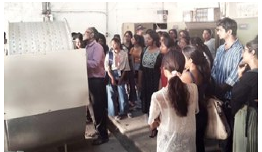
Students watching the process taking place in the tannery

leather, which is presented as a product for global market. He also demonstrated and explained different types of leather finishing process in great detail.