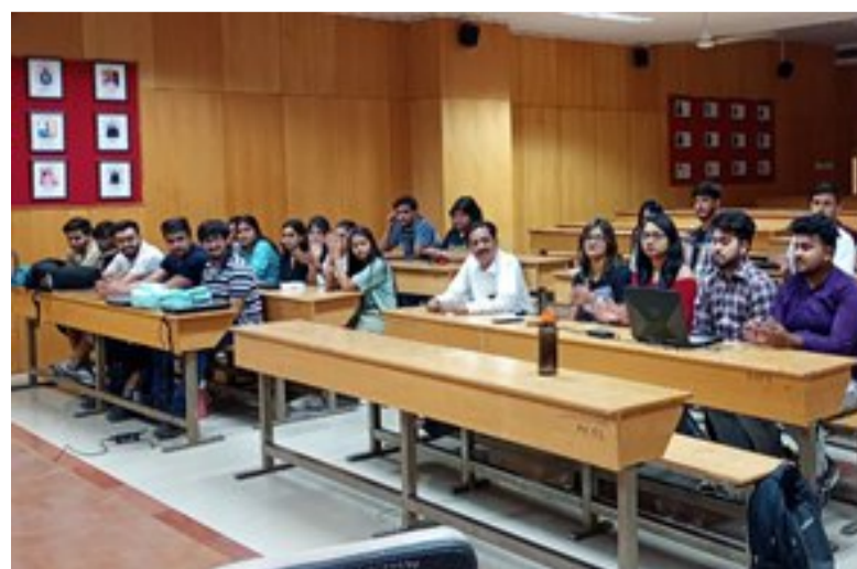
FDP students attending the workshop