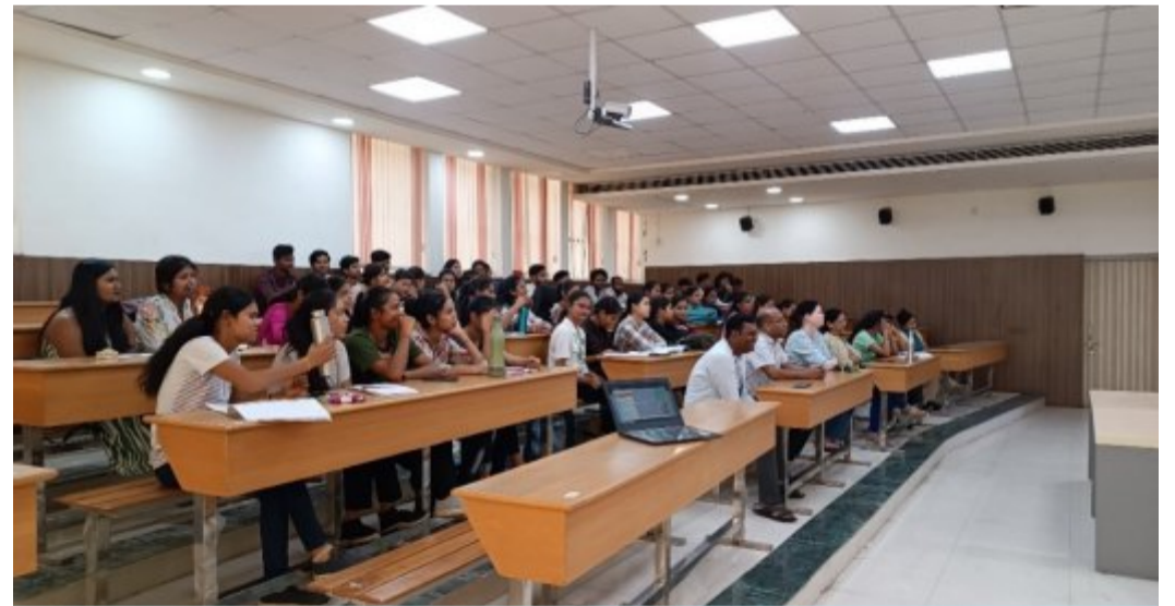
Students of FD at FDDI, Chhindwara campus attending workshop

The workshop offered an immersive experience in the realm of fashion designing which is not just about creating trends but, also about shaping identities and cultures. The cheerful interaction involved a rich exchange of ideas and knowledge which were instrumental in helping the participants achieve skill development.