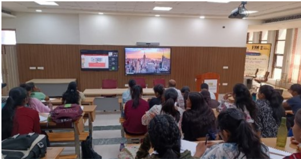
Workshop being attended by other campus using the virtual mode

During the workshop, the eminent guest speakers provided insights to the participants to bring their ideas & skills to practice which is invaluable for aspiring fashion professionals.