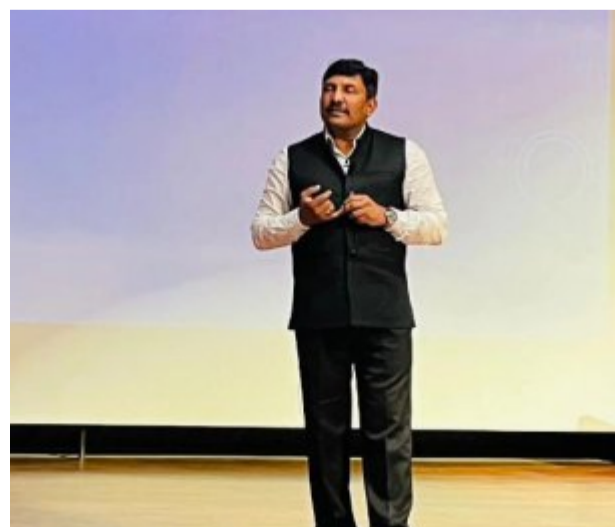
MD, FDDI delivering 'Keynote lecture'

During a one-week campus immersion for the working executives held from May 13-18, 2024 at IIM, Raipur Campus, this session was conducted on 14 th May 2024.