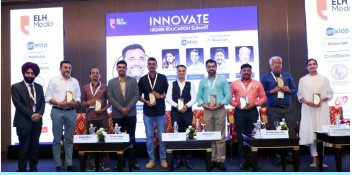
Eminent panel members of 'Design Institutions Roundtable' session

The summit feature valuable discussions on critical topics, including 'Design Institutions Roundtable' session for which the MD-FDDI was among the eminent panel member.