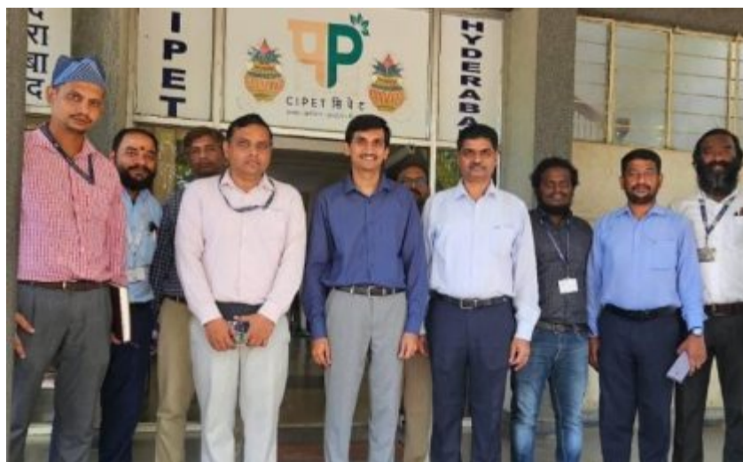
FDDI Hyderabad and CIPET Hyderabad Team

CIPET, an autonomous institute established in 1968 under the Ministry of Chemicals & Fertilizers, Government of India, has been a cornerstone in the development of human resources for the petrochemical and allied industries. Through its