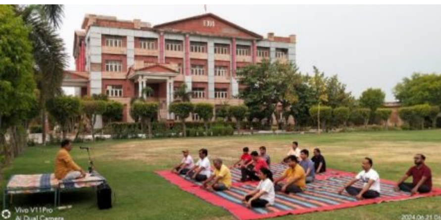
A view of 'International Yoga Day' at FDDI, Fursatganj campus