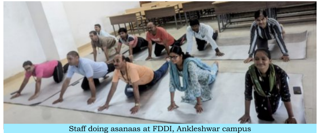
Staff doing asanaas at FDDI, Ankleshwar campus

Around 200-250 employees of across campuses attended Yoga session with a great zeal and enthusiasm who were guided through a series of yoga asanaas (poses) designed to enhance flexibility, strength, and inner balance.