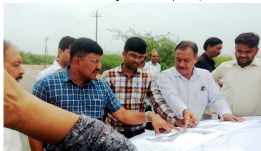
Officials of RO- MPIDC briefed the delegation about the progress of MLF&AC