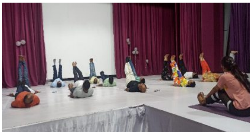
Staff doing asanaas at FDDI, Chhindwara campus