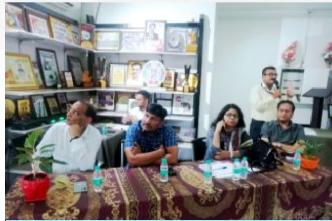
IDLS Presentation on IDLS Scheme at Ms. Dawar Shoes, Agra