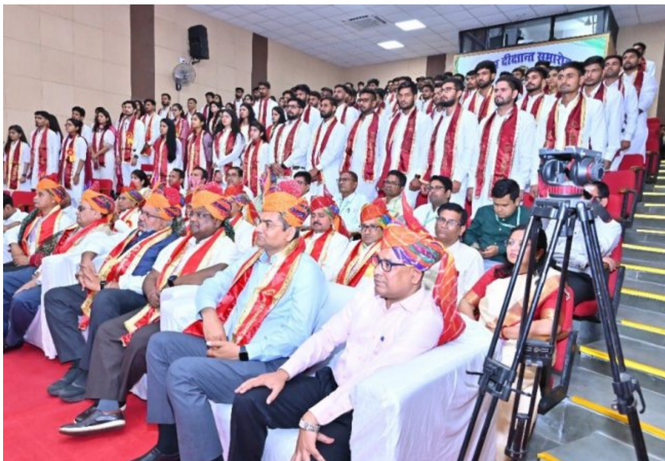
Dignitaries attending the 5th Convocation ceremony of RAU, Jodhpur