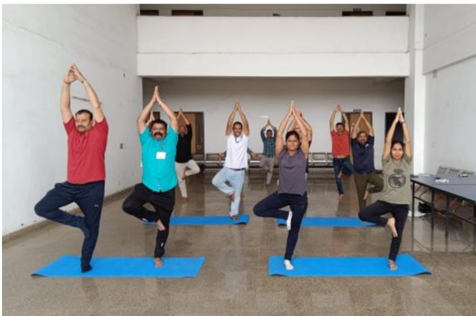
Staff doing Yoga at FDDI, Hyderabad campus

To mark its significance and raise awareness about the many benefits of Yoga, the United Nations proclaimed 21 st June as the International Day of Yoga in December 2014.