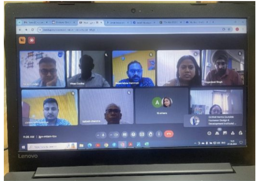
View of FDP