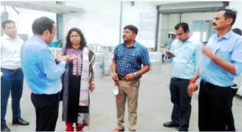
Experts of M/s. Mayur Uniquoters Limited briefing the delegation

The delegation also visited M/s. Mayur Uniquoters Limited, a manufacturing unit involves in mass production of PU Artificial Leather located at Sitapur Industrial Area, Phase I, MP.