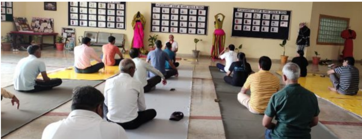
Staff doing Yoga at FDDI, Rohtak campus