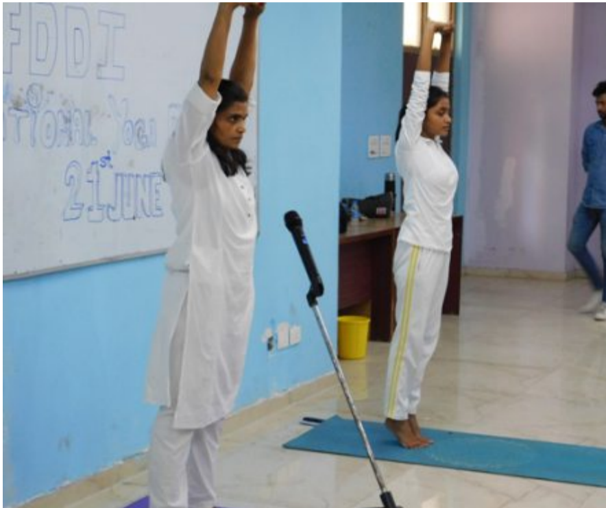
Staff doing asanaas at FDDI, Noida campus

'10 th International Yoga Day' was celebrated with great enthusiasm across all campuses of Footwear Design & Development Institute (FDDI) by holding Yoga sessions on 21 st June, 2024.