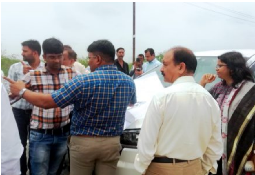
Delegation at MLF&AC, Sitapur Phase II, Industrial Area, Morena, MP