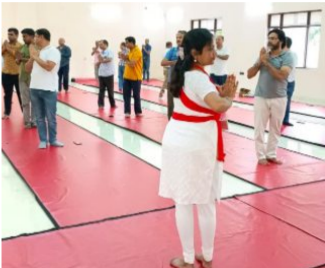
Staff doing asanaas at FDDI, Kolkata campus