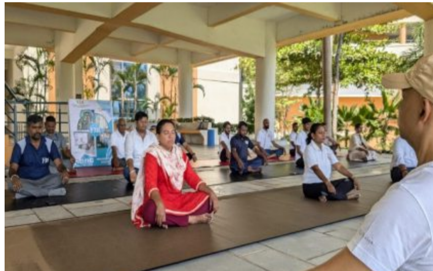
Staff doing asanaas at FDDI, Chennai campus