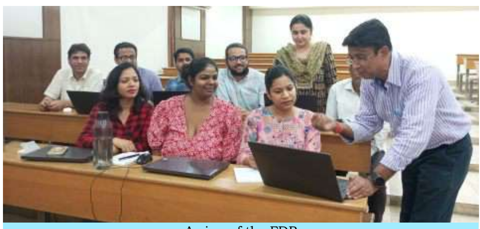
A view of the FDP

To enhance data visualization & research learning for innovative and teaching skills, a Faculty Development Program (FDP) on 'Microsoft Power BI' was conducted by FDDI on 21st and 25th June 2024 on dual mode offline and online during which the Faculties of other campuses of FDDI participated.