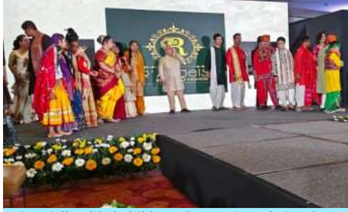
Specially-abled children showcasing their talent

The event featured the prestigious Nari Shakti Awards, recognizing the outstanding contributions of women serving in the Indian Armed Forces.