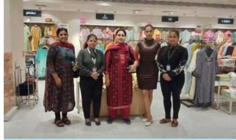
Faculties of FDDI at Shopper's Stop

Engaging in discussions with ROM, allowed Faculty to gain insights into the challenges and opportunities within the retail sector which will help in enhancing the overall quality of pedagogy ensuring that students are learning relevant and current industry practices.