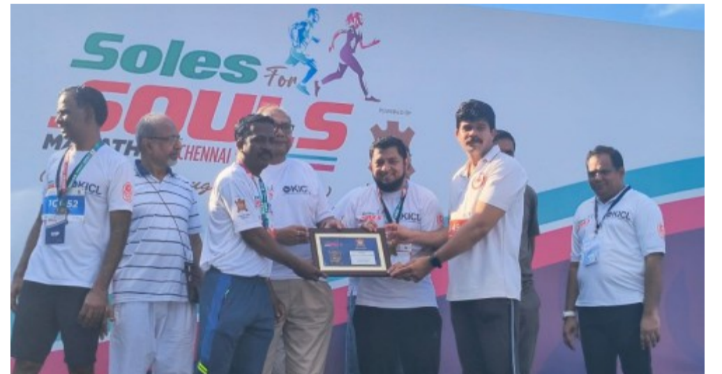
Staff of FDDI-Chennai receiving certificate of participation

With over 5,000 runners, including 100+ enthusiastic students and 05 staff from FDDI Chennai participated in the event which was a powerful movement to promote the footwear sector while raising social awareness about the importance of a drug-free society.