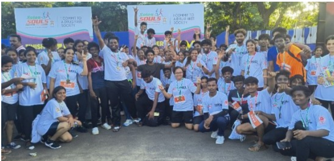
FDDI, Chennai student who participated in the marathon

Marathon featured three categories namely; 3km.-for 8 years and above 5km. -for 12 years and above and 10km.-for 16 years and above.