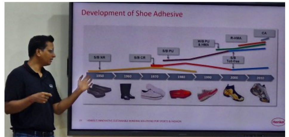
Technical expert from Henkel briefing the students about the development of Shoe Adhesive