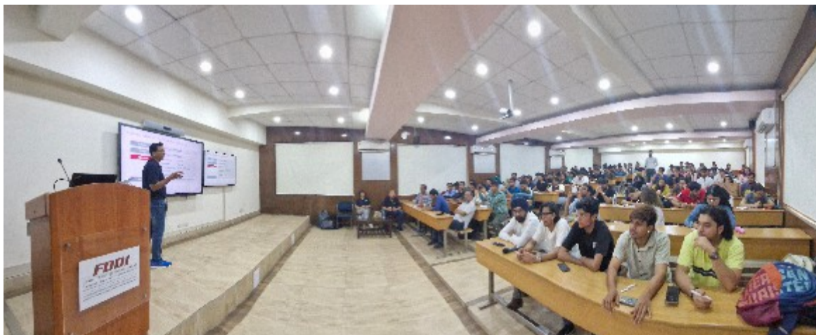
Students attending the seminar

To provide an insight on the latest innovations in adhesive technologies in the footwear and textile industries, a seminar was organized at FDDI, Noida campus on 24 th September 2024.