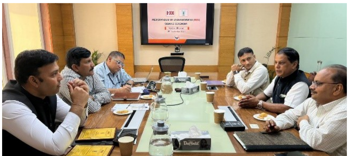
Discussion in progress between the officials

ICAR- NINFET is a premier institution under the Indian Council of Agricultural Research, New Delhi dedicated to research in jute and allied natural fibres, promoting their diversified use and contributing to industrial growth.