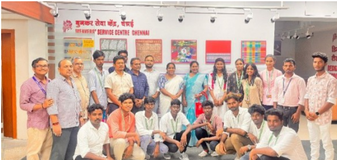
Students alongwith their faculty members at Weavers Service Centre