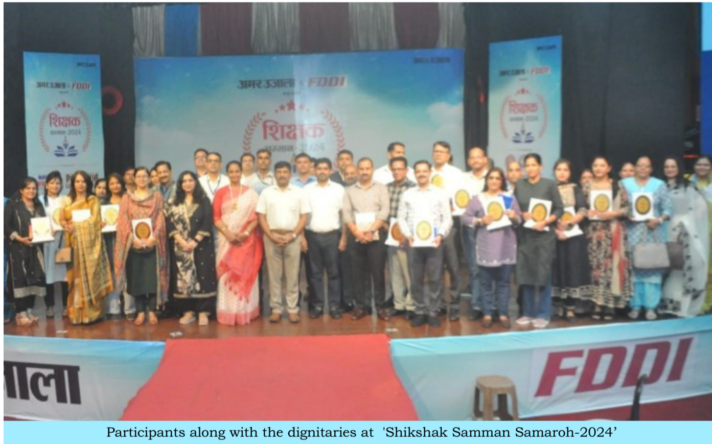
Participants along with the dignitaries at 'Shikshak Samman Samaroh-2024'