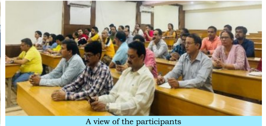
A view of the participants

In her address, she laid great emphasis to follow the official language policy of the Union Government to make maximum use of the Hindi of Official Language in our institution / office as much as possible.