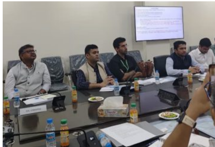
A view of the orientation programme