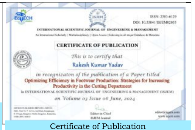
Certificate of Publication