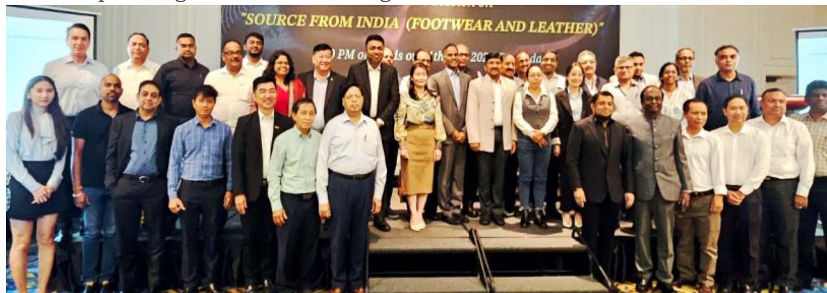
Delegation attending the interactive session – 'Source From India (Footwear and Leather)'

The team's visit facilitated significant networking opportunities that could contribute to the growth and development of the footwear, leather, components and accessories manufacturers, and design industries.