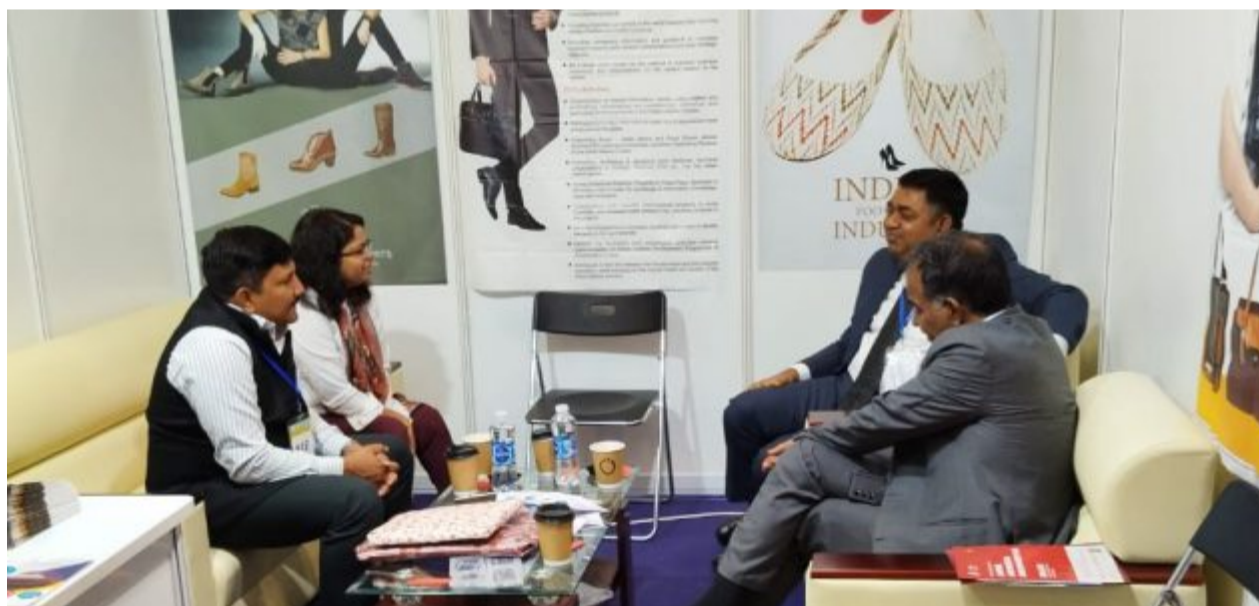
From Left: MD, FDDI and Director (L&F), DPIIT at CLE India Pavilion