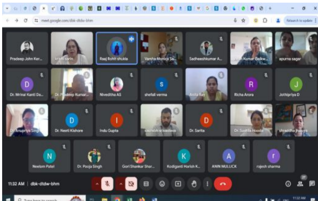
Screenshot of the FDP

From 01 st to 09 th July 2024, the School of Fashion Design(FD) underwent a Faculty Development Program on 'Artificial Intelligence on AI in Fashion' which was organized to equip faculty member with latest technology trends and their impact on industry and academia.