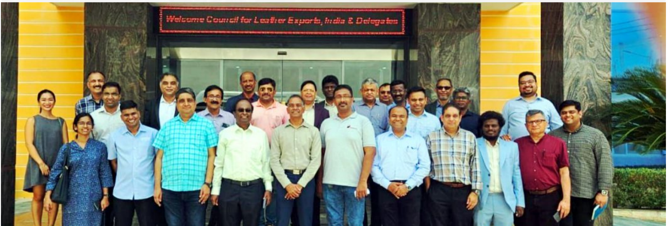
DPIIT, FDDI and CLE delegates, along with Thanh Khon Co Ltd., industry representatives

systems and technology in shoe design, leather goods, and production equipment from the fair which is one of the most important and leading events for the shoes and leather industry in the ASEAN regions.