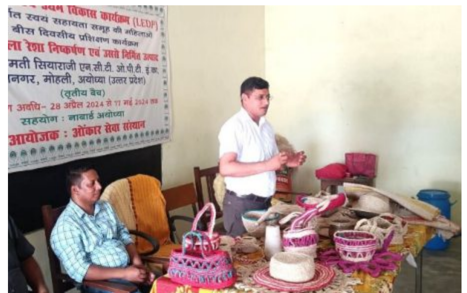
Another type of footwear made by making use of fibers of banana tree stem