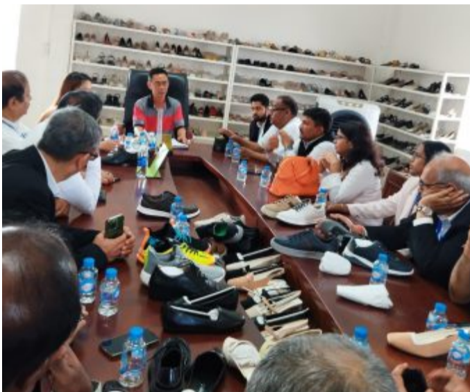
Discussion in progress at UVSPTCL

The visit to TBS, Binh Thang, Di An, Binh Duong was aimed at fostering innovation and exploring potential partnerships to enhance product offerings and sustainability in footwear and handbag production.