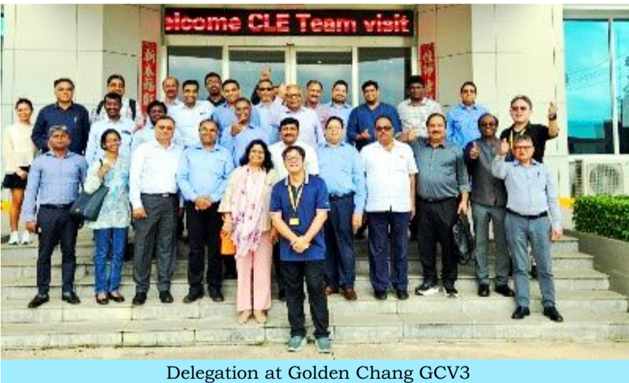
Delegation at Golden Chang GCV3

Technical seminars were also held during which the international speakers presented their latest market technologies and fashion trends, which was invaluable for gaining insights and making important connections in the industry and was extremely helpful for the business planning and decision making.