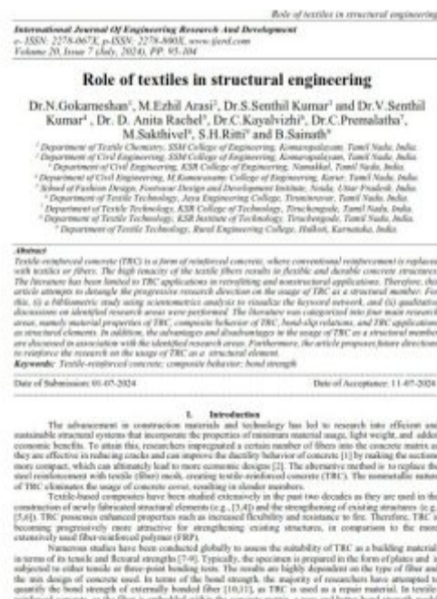
Article published in IJERD

The topic of the article is "Role of textiles in structural engineering", bearing e- ISSN: 2278-067X, p-ISSN: 2278-800X, www.ijerd.com, Volume 20, Issue 7 (July, 2024), PP. 95-104.