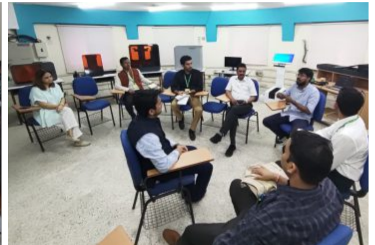
Officers at PDC-FDDI

At FDDI, DGM - SA & ED, provided an insightful overview of FDDI as an Institution of National Importance and whereas all four Heads of Schools (HoS) namely School of Footwear Design & Production (FDP), School of Fashion Design (FD), School of Leather Goods & Accessories Design (LGAD), and School of Retail and Fashion Merchandise (RFM) made knowledge-sharing presentations of their respective school. Director CoE- FDDI briefed them about the 'Centre of Excellence' (CoEs) which have been created in seven different thematic areas and research projects.