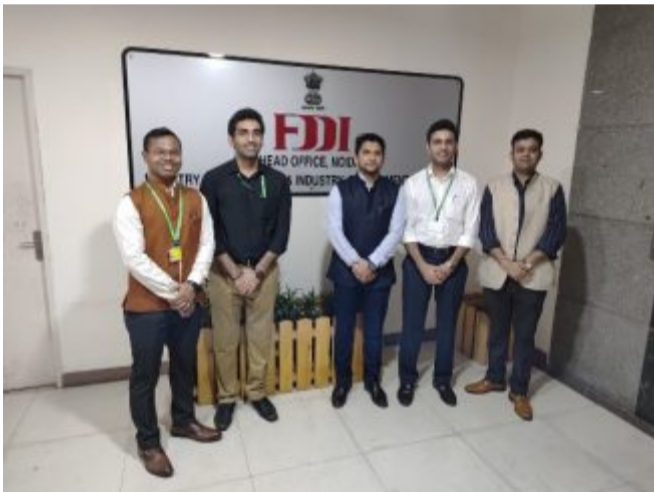
IAS officers at FDDI