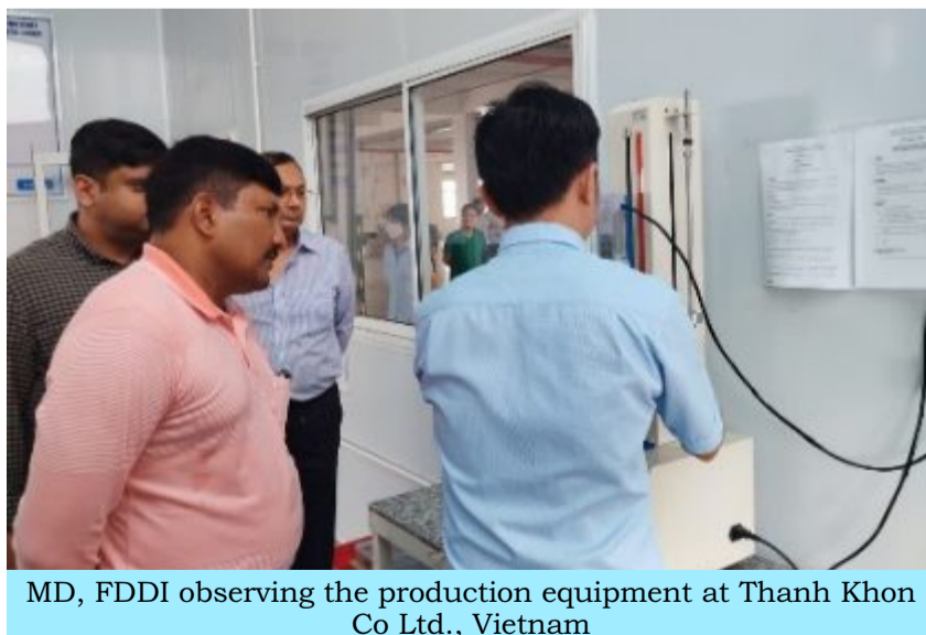
MD, FDDI observing the production equipment at Thanh Khon Co Ltd., Vietnam

accessories manufacturers also participated in the ISLE, Vietnam under the Council for Leather Exports (CLE) India Pavilion.