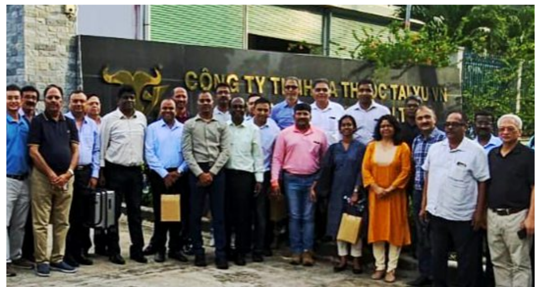
Delegation at Harvest Glory Limited

Collaboration opportunities were explored with Thanh Khon Co Ltd., focusing on innovative product development and sustainable manufacturing techniques. This partnership aimed to leverage the strengths of both organizations to create advanced and eco-friendly footwear solutions.