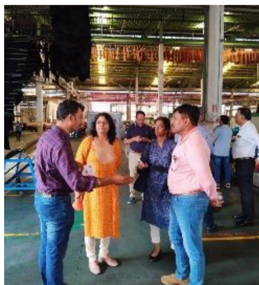
MD, FDDI and Director (L&F), DPIIT at Harvest Glory Limited