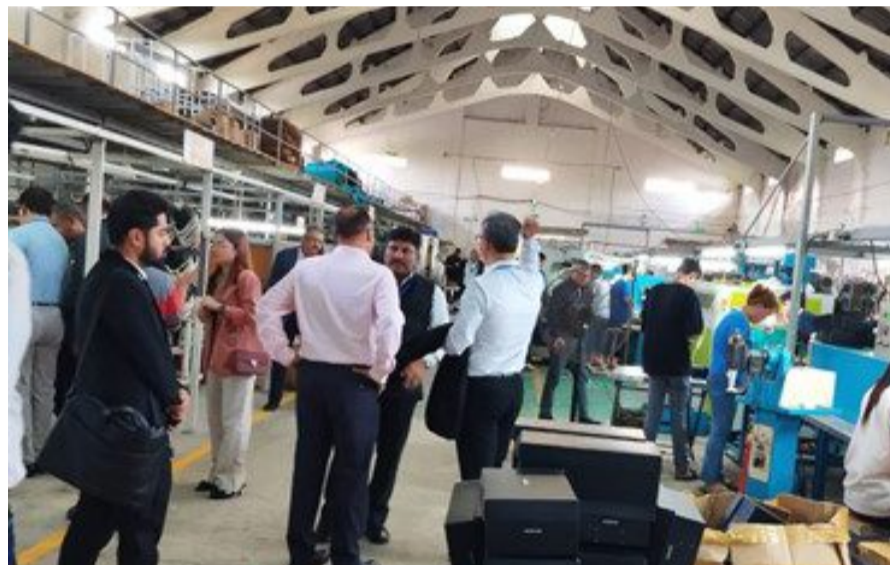
Delegation visiting the manufacturing plant of UVSPTCL

The delegation also attended the interactive session – 'Source From India (Footwear and Leather)' at Mai House Saigon Hotel, Vietnam which provided numerous opportunities for networking, knowledge exchange, and business development.