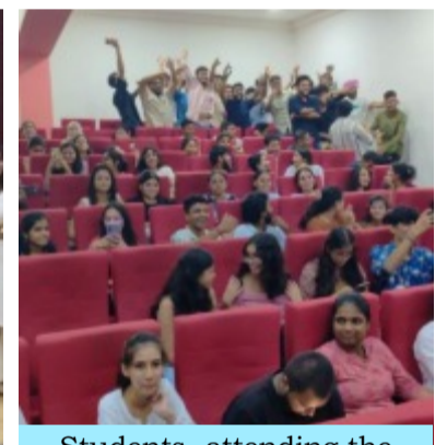
Students attending the competition