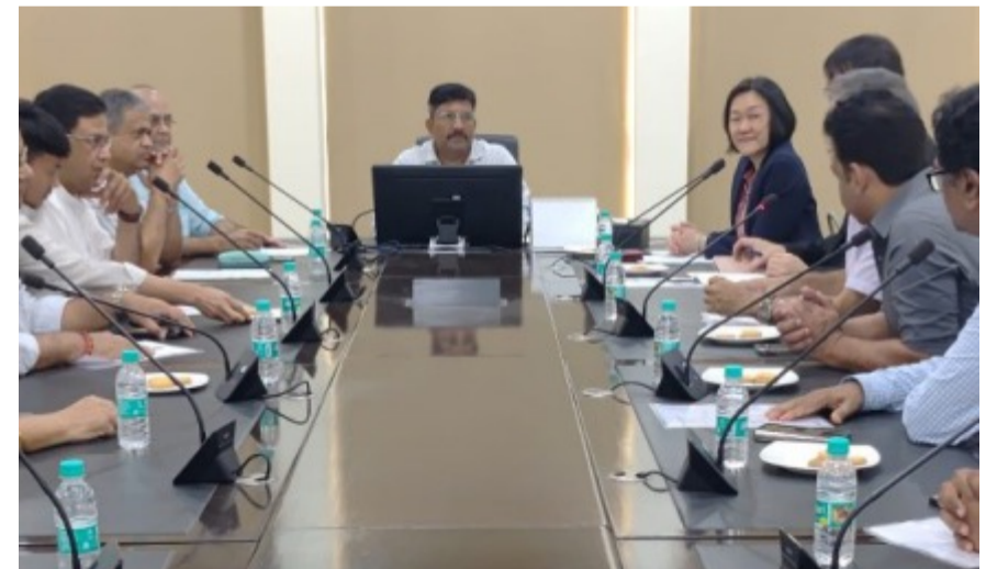
A view of the meeting

The purpose of their visit was to have discussion with the doyens of the Indian footwear and components & accessories manufacturers on joint venture & technical support opportunities.