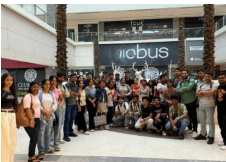
Faculty and students at Hippo Store

The School of Retail and Fashion Merchandise (RFM) of FDDI, Noida campus organized an insightful and exciting educational visit for its students at Hippo Store in Noida on 21 st August 2024.