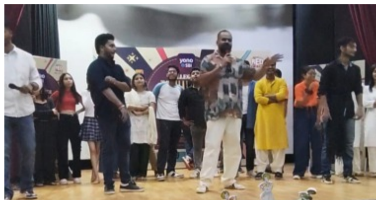
A view of 'College Ke Tashanbaaz' competition

The event not only highlighted the artistic talents of FDDI students but also fostered a sense of community and pride within the campus.