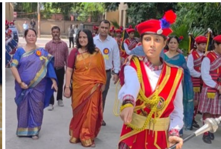
A view of the 'March Past'

FDDI, Noida has partnered with KVS by providing world-class infrastructure to facilitate the smooth conduct of the competition. This collaboration not only ensures a high-quality environment for the participants, but also aids in branding and promoting FDDI in numerous schools nationwide, giving students a glimpse of FDDI's state-of-the-art facilities and capabilities.