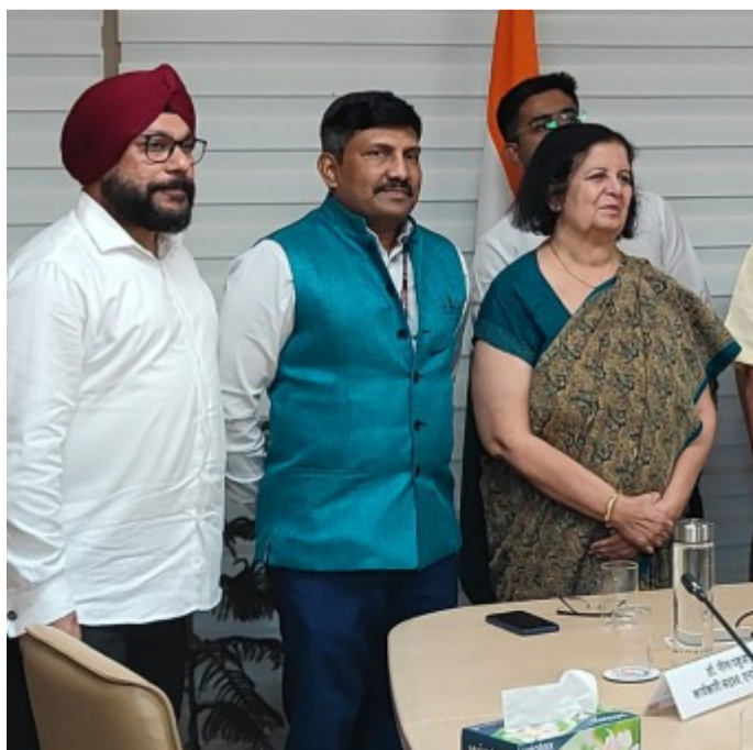
Dignitaries present during the signing of MoU

By meeting all the compliance required for getting NCVET recognition as an AB-Dual by FDDI, a Memorandum of Understanding (MoU) was signed between FDDI and NCVET at New Delhi.