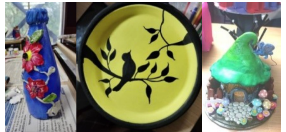
Artistic craftsmanship & product presentation by students