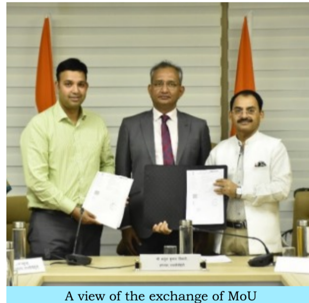
A view of the exchange of MoU

By meeting all the compliance required for getting NCVET recognition as an AB-Dual by FDDI, a Memorandum of Understanding (MoU) was signed between FDDI and NCVET at New Delhi.