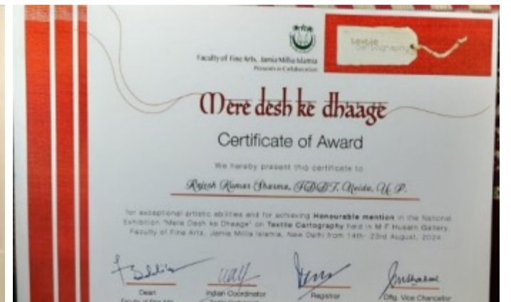
Certificate of Award

Approximately 121 artists from different Universities/Institutes/Colleges of India participated in the exhibition, to embrace textile in their artistic and aesthetical endeavours.