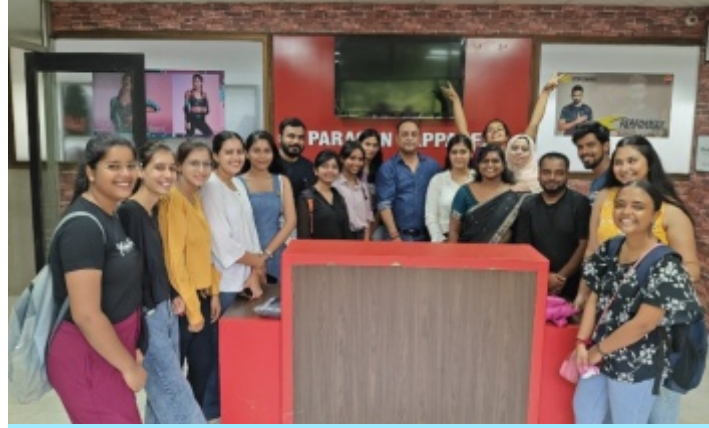
Students alongwith their faculty members at Paragon Apparel Pvt. Ltd.

During the visit, the technical experts of the unit, briefed the students about the