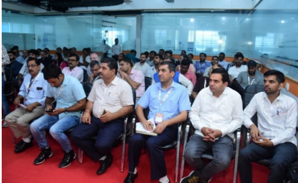
Participants attending the inaugural session

During this two days' event, exhibition stalls of selected large buyers, footwear machinery manufacturers, footwear material suppliers, technology providers and MSMEs involved in manufacturing of footwears had a unique platform to support each other requirements and shall provide a fillip for the growth of non-leather footwear & footwear accessories sector. Sessions on technology, quality-testing and government policies for footwear manufacturers were also conducted.