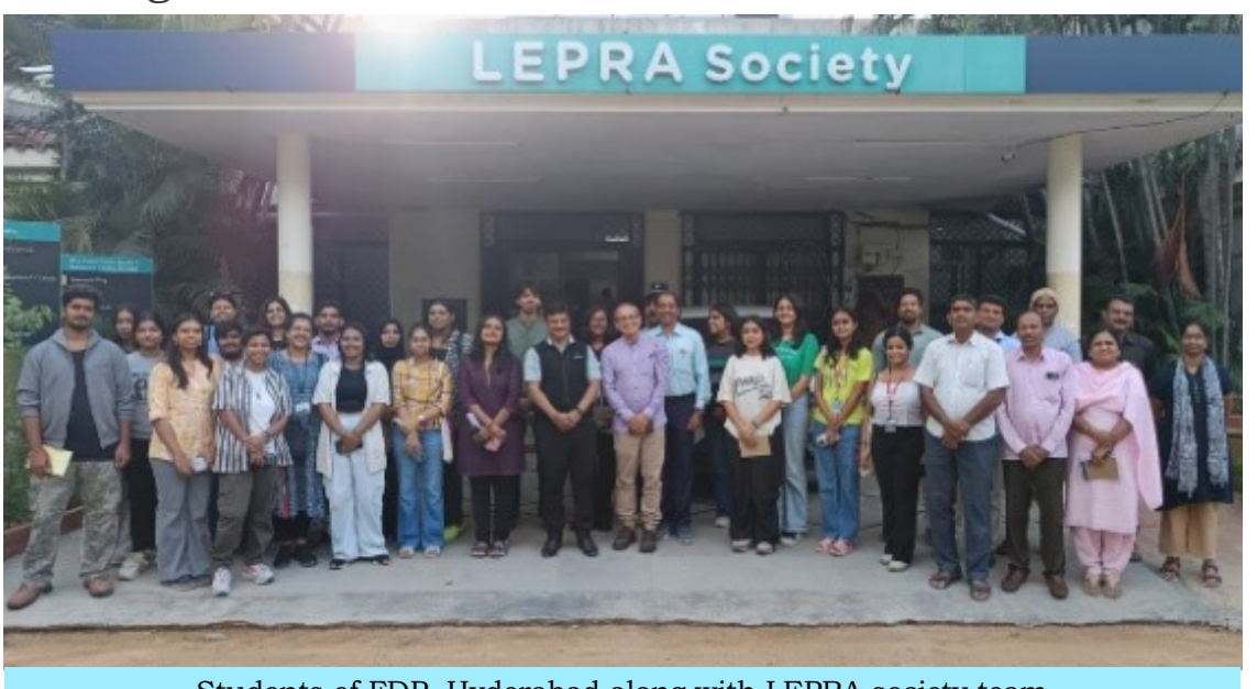
Students of FDP, Hyderabad along with LEPRA society team

essential concepts for understanding how weight is distributed during walking. To illustrate these points, student volunteers were invited to share real-life examples. The students also gained insights into the use of MCR (Microcellular Rubber) soles and pads, which provide essential cushioning, shock absorption, and support, particularly for individuals at risk of foot ulcers or discomfort due to extended periods of standing or walking.