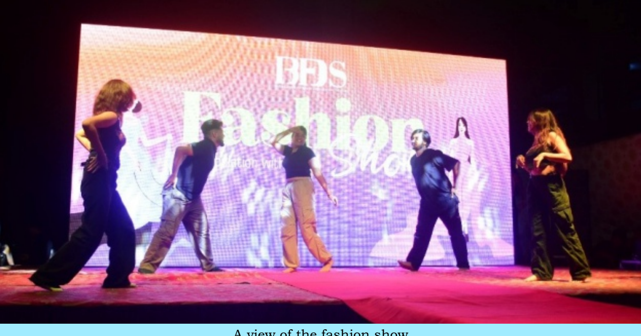
A view of the fashion show

FDDI Rohtak campus also actively participated by setting up a stall that showcased the creativity and skills of the students and faculty in footwear design and development. The stall attracted considerable attention from industry professionals and visitors alike. A fashion show was held by FDDI, Rohtak in association with BFDS.