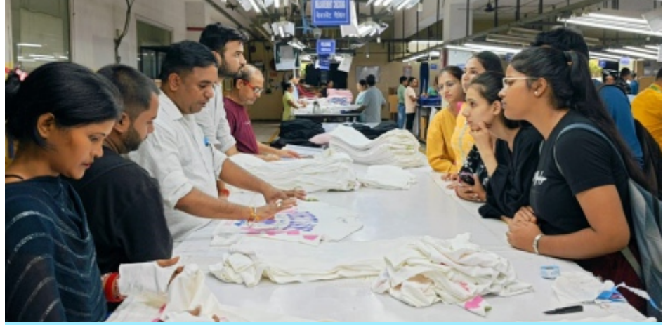
Technical experts briefing the students

process of manufacturing of polyester sportswear, Men's wear, Women's wear, Kids Apparel, and Personal Productive Equipment's etc. They explained the students about the different processes that work in a line for production of garments, from design & plan to final production.