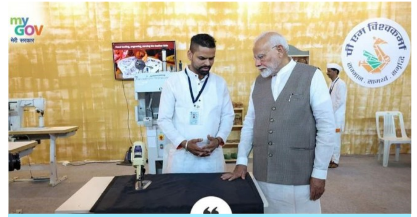
Hon'ble Prime Minister of India, Mr. Narendra Modi interacting with an artisan

The exhibition which was held from 20<sup>th</sup> – 22<sup>nd</sup> September 2024 was organized marking one year of progress under PM Vishwakarma Programme. The scheme was launched by Hon'ble Prime Minister – Mr. Narendra Modi on 17<sup>th</sup> September 2023 at Yashobhoomi, Dwarka, New Delhi, to support and uplift India's traditional artisans, known as 'Vishwakarma's.' It focuses on preserving and promoting the skills of artisans in 18 traditional trades, including blacksmithing, carpentry, and shoemaking.