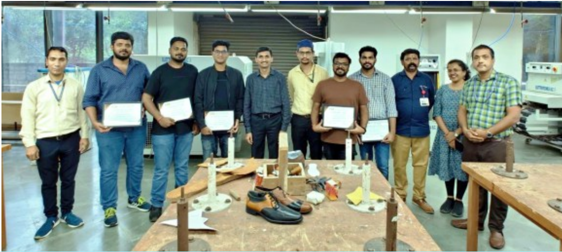
A view of the "Certificate presentation by Executive Director, FDDI Hyderabad along with Kia designers and Team FDDI Hyderabad

The workshop ended with a certificate presentation by Executive Director, FDDI Hyderabad, recognizing the efforts and achievements of all participants. The event was a remarkable success, highlighting the creative potential and craftsmanship in leather and footwear design.