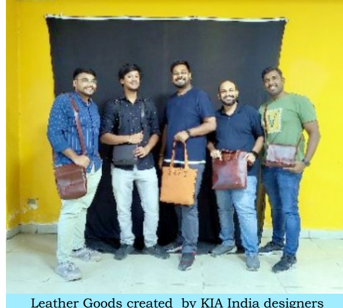
Leather Goods created by KIA India designers

It commenced with an introduction to leather and leather goods, covering essential materials and tools used in the trade. Designers were guided through the process of design and pattern making, followed by cutting techniques.