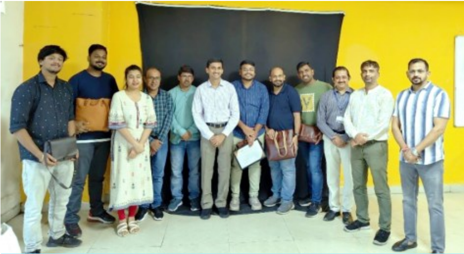
sandal footwear. Each designer from KIA Hyderabad successfully crafted their own pair of sandals, showcasing creativity and precision.

Designers were briefed on various footwear styles before being taken to different labs