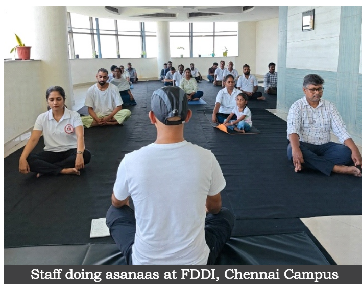
Staff doing asanaas at FDDI, Chennai Campus