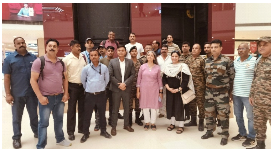
JCOs along with FDDI Faculty at Bhutani City Centre, Noida

The officers were briefed by the mall management team on several key areas, including security protocols, firefighting systems, routine