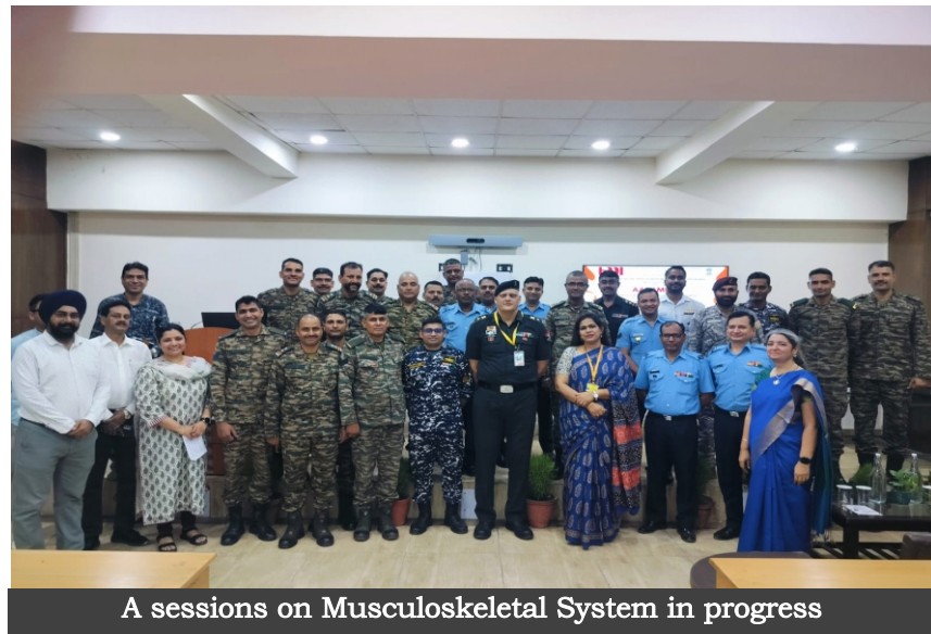
A sessions on Musculoskeletal System in progress