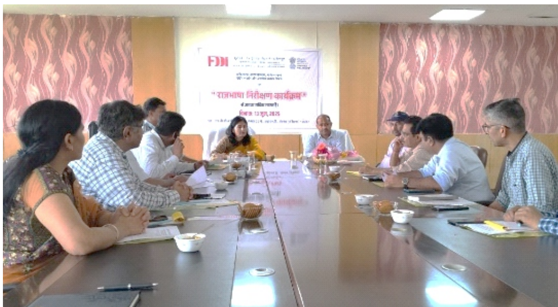
A view of the workshop

The employees who attended the workshop expressed their appreciation for the workshop, as it not only provided valuable guidance on conducting official work in Hindi, but also offered insight into several interesting facts about the Hindi language.