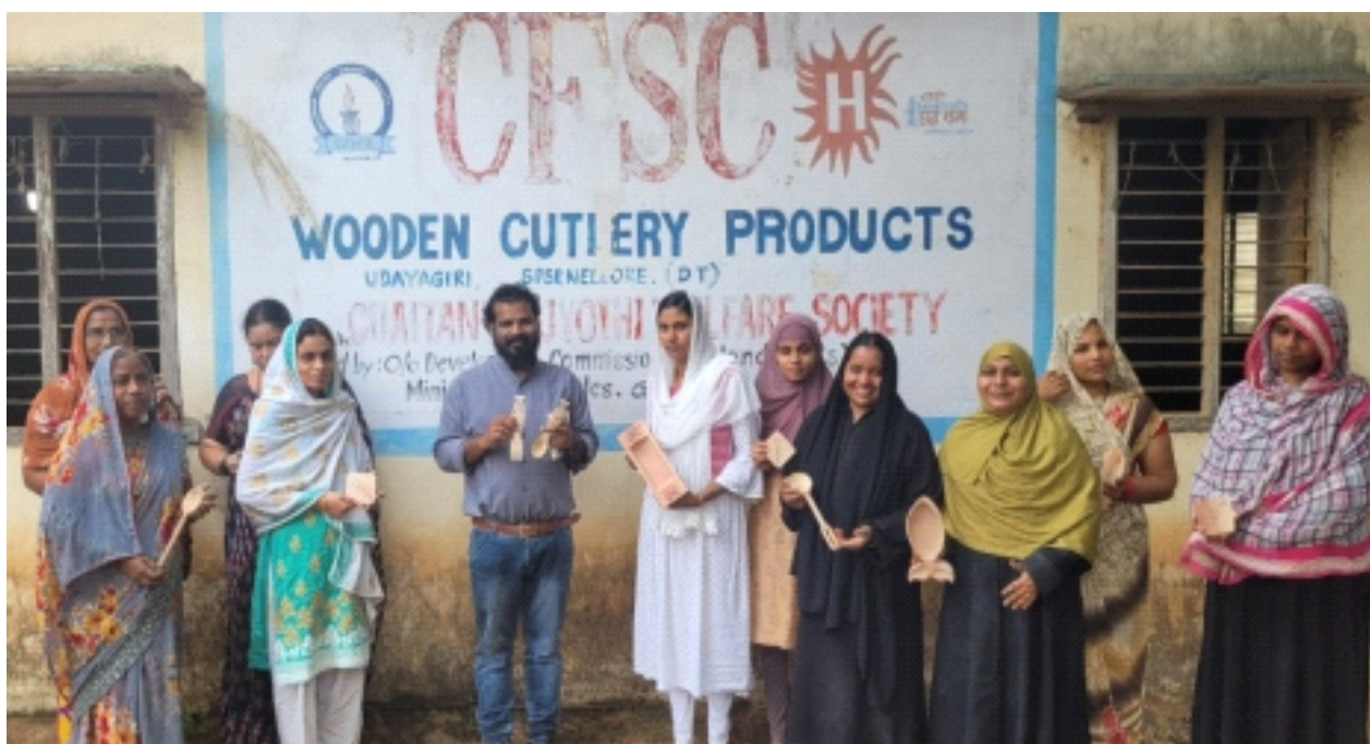
Interaction & research study on Udayagiry Cutlery craft artisans