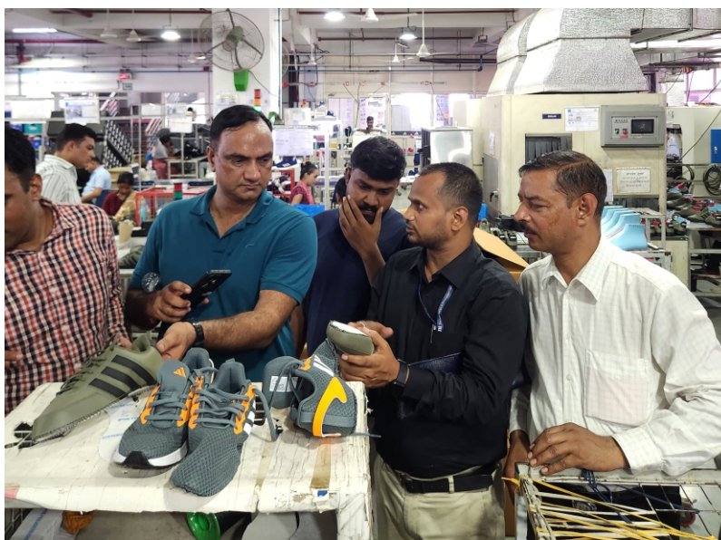
Trainees watching the diverse design of footwear being produced at Alpine Industries

This exposure to large-scale, organized footwear production provided participants with a clear understanding of the manufacturing process and inspired them to explore opportunities for establishing their own footwear units in the future.