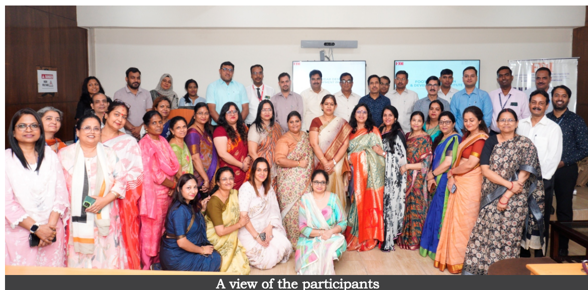
A view of the participants

Principals Meet of CBSE Board was held at FDDI, Noida Campus on 28 th June 2025, with the objective of promoting the significance of skill-based education in alignment with the vision and guidelines of the National Education Policy (NEP) 2020.