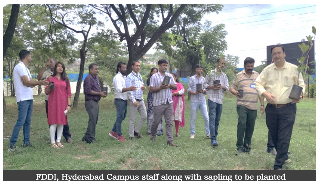
FDDI, Hyderabad Campus staff along with sapling to be planted