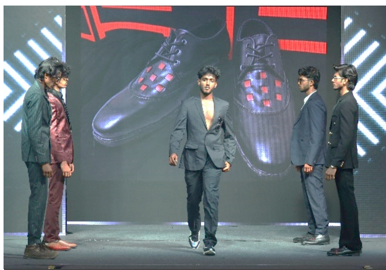
Students showcasing their spectacular collections on the ramp