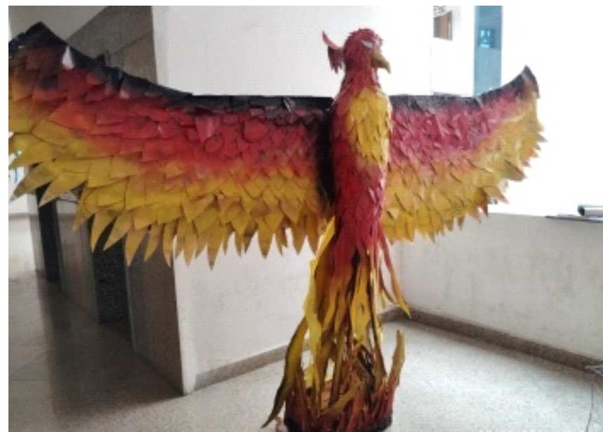
Creative outcome by the students

Students experimented with creativity and innovation, producing stunning theme-based products that reflected their growing mastery of the skills required to succeed in the global market and upcoming academic sessions.