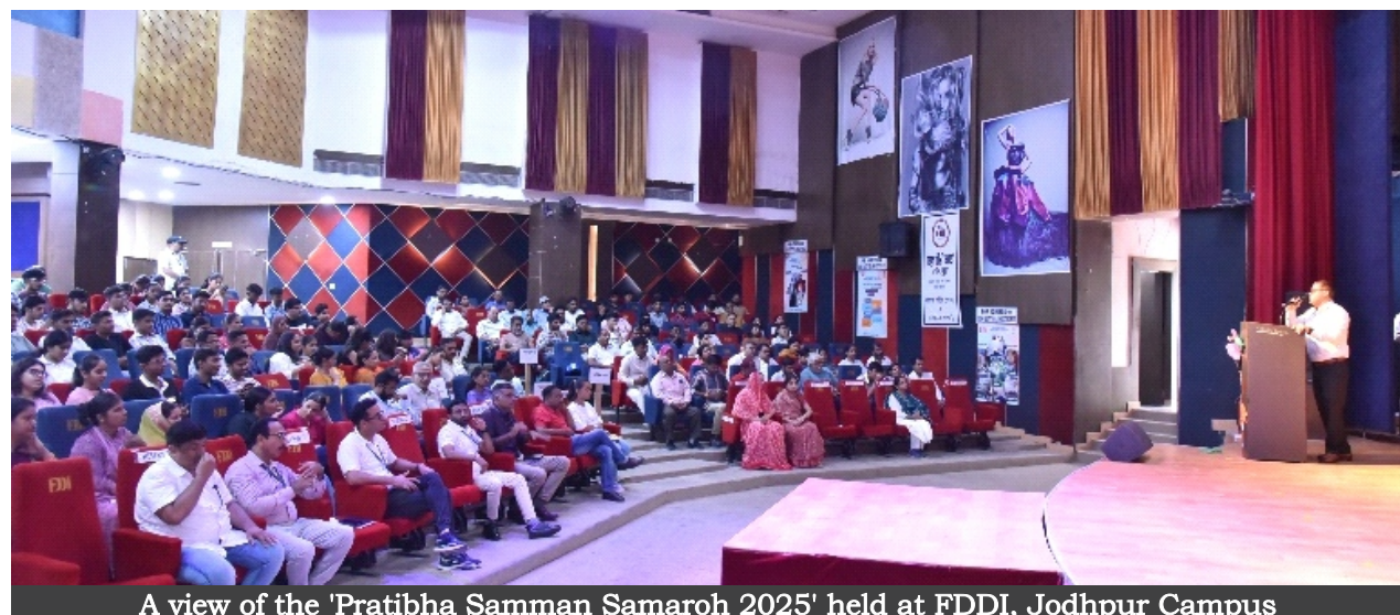
A view of the 'Pratibha Samman Samaroh 2025' held at FDDI, Jodhpur Campus

FDDI, Jodhpur Campus felicitated meritorious Class 12 students from Central and State Boards who scored at least 60% or 6.0 CGPA during the 'Pratibha Samman Samaroh 2025' (प्रतिभा सम्मान समारोह) held on 22 nd June—a celebration of achievement, dedication, and perseverance.