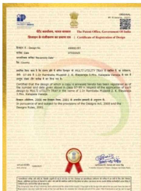
Certificate of Registration of Design

Motivated to bridge traditional craftsmanship with modern design thinking, the team conceptualized the Multi-Utility Tray with the aim of supporting the local artisan community and promoting the ethos of design for society.