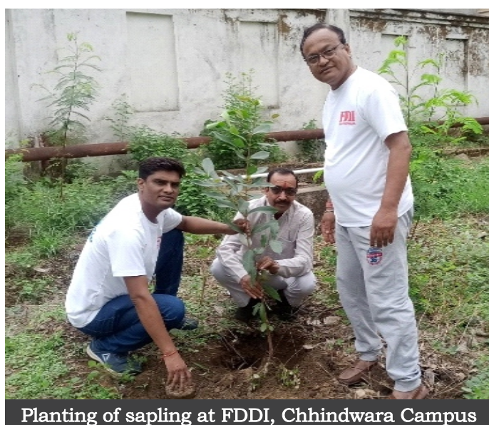
Planting of sapling at FDDI, Chhindwara Campus

The initiative not only enhanced the aesthetic appeal of the campuses but also reinforced the importance of adopting greener practices in daily operations.