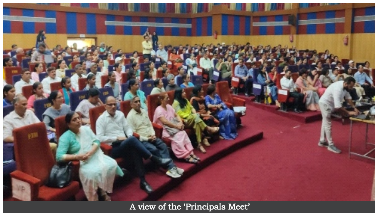
A view of the 'Principals Meet'

The principals gathered to discuss key educational initiatives, academic strategies, and collaborative opportunities, sharing innovative approaches that highlighted the importance of education in students' lives.