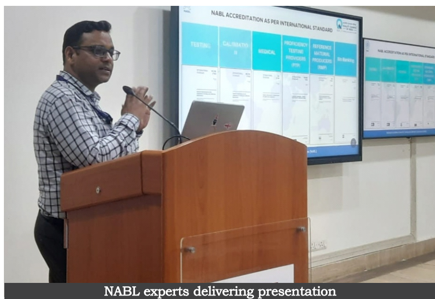
NABL experts delivering presentation

On 12 th June, 2025, the National Accreditation Board for Testing and Calibration Laboratories (NABL), in collaboration with the Ministry of Micro, Small & Medium Enterprises (MSME), organized the 'Gunvatta Yatra' — an awareness program on 'NABL Accreditation and Its Benefits' — at FDDI, Noida Campus.