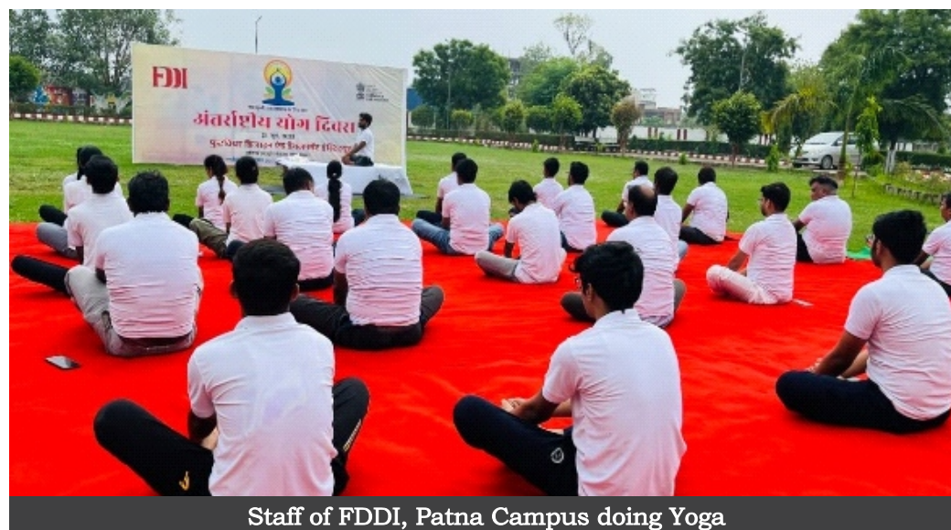
Staff of FDDI, Patna Campus doing Yoga