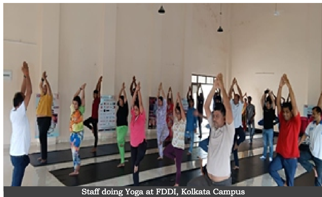
Staff doing Yoga at FDDI, Kolkata Campus