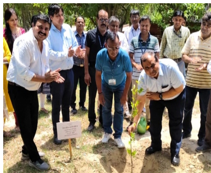
Planting of sapling under 'Ek Ped Maa Ke Naam' campaign at FDDI, Rohtak Campus