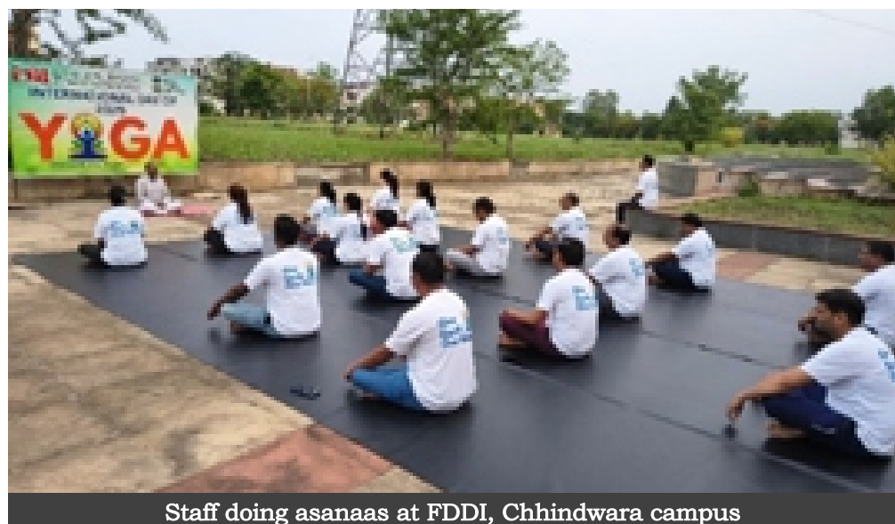
Staff doing asanaas at FDDI, Chhindwara campus