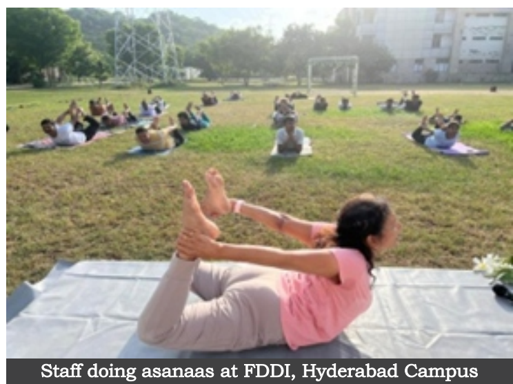
Staff doing asanaas at FDDI, Hyderabad Campus