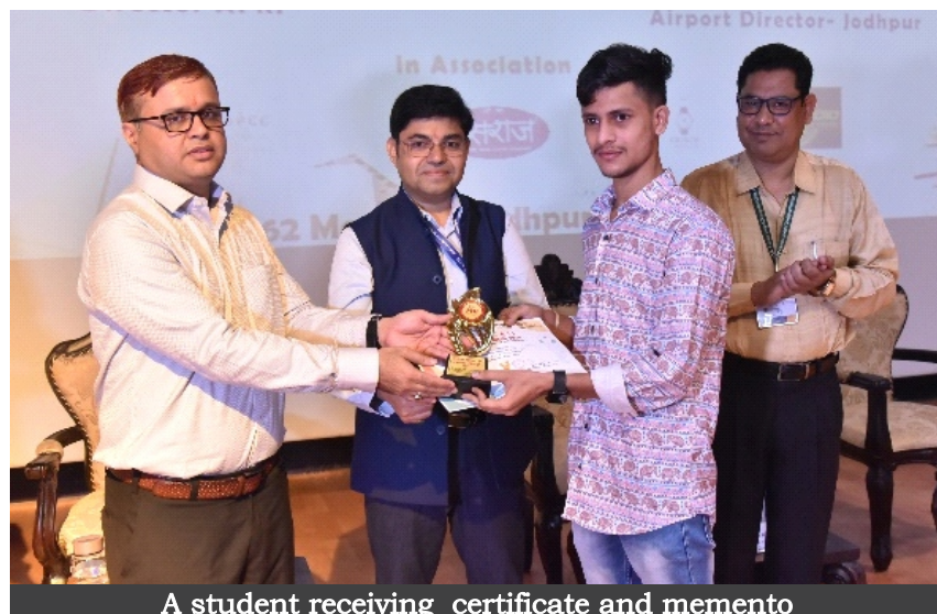
A student receiving certificate and memento