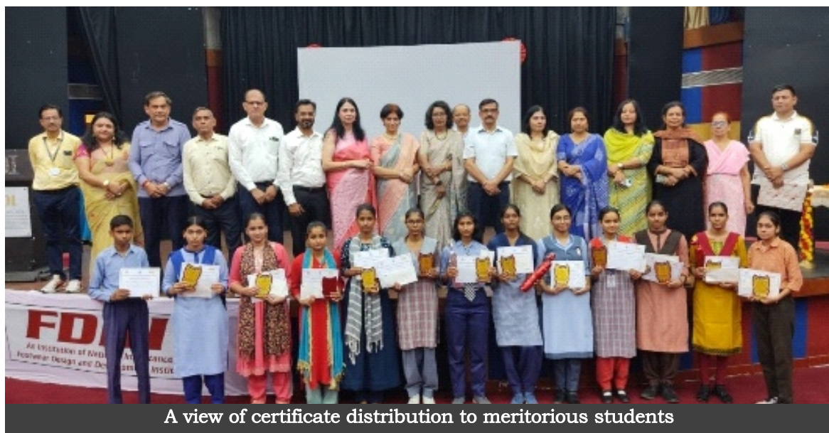
A view of certificate distribution to meritorious students

They also viewed an exhibition of artworks created by FDDI Rohtak students, appreciated their talent, and received information about the courses offered by the institute.