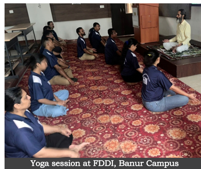
Yoga session at FDDI, Banur Campus