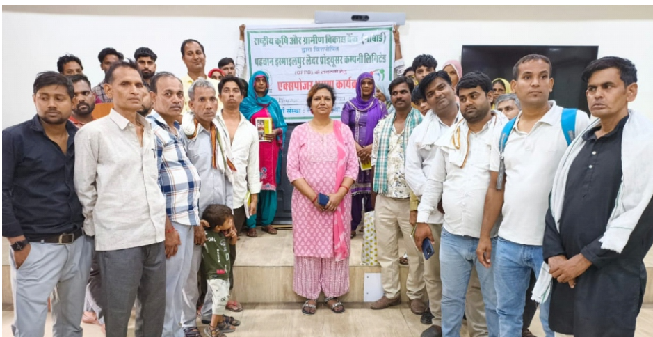
Pehchan Ismailpur Leather Producer Company Limited artisans at FDDI, Noida Campus

The purpose of the visit was to gain technical exposure to leather and non-leather footwear, product and design development, emerging technologies, raw materials, tools and techniques, and the comprehensive processes involved in footwear manufacturing.