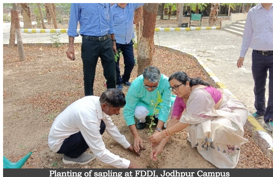
Planting of sapling at FDDI, Jodhpur Campus