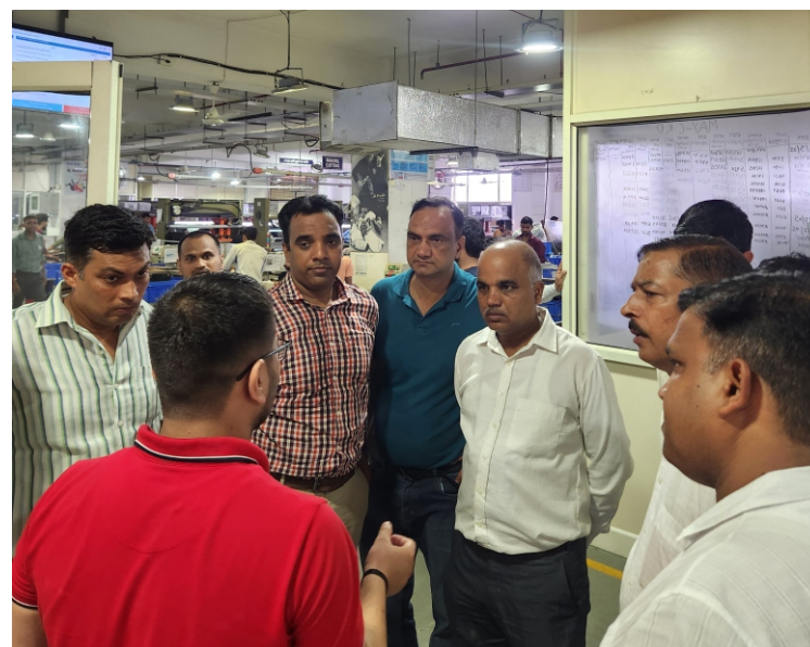
Trainees being briefed about the technicalities of footwear manufacturing at Alpine Industries