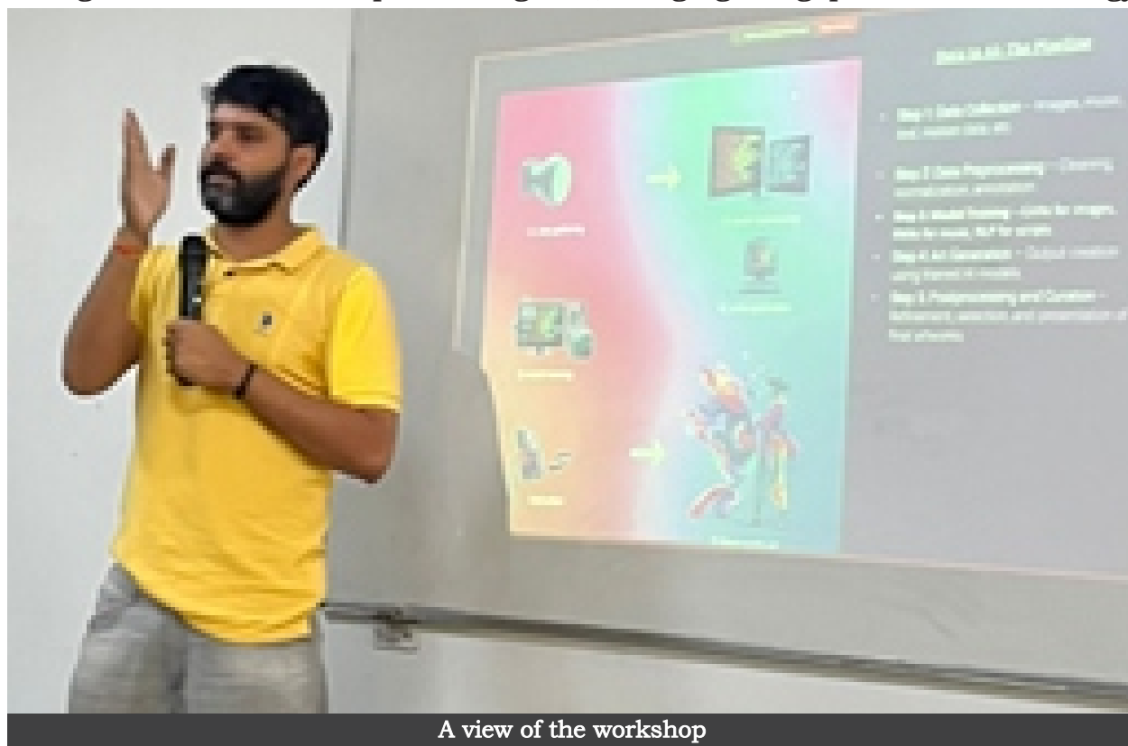
A view of the workshop

The workshop provided a valuable platform to explore the future of AI in creative disciplines, highlighting exciting opportunities for cross-disciplinary collaboration.