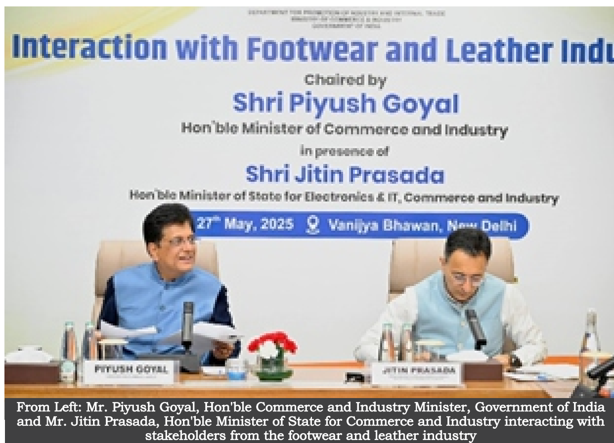
From Left: Mr. Piyush Goyal, Hon'ble Commerce and Industry Minister, Government of India and Mr. Jitin Prasada, Hon'ble Minister of State for Commerce and Industry interacting with stakeholders from the footwear and leather industry

On 27 th May 2025, Mr. Piyush Goyal, Hon'ble Minister of Commerce and Industry, Government of India, along with Mr. Jitin Prasada, Hon'ble Minister of State for Commerce and Industry, held an important interaction with key stakeholders from the footwear and leather industry.