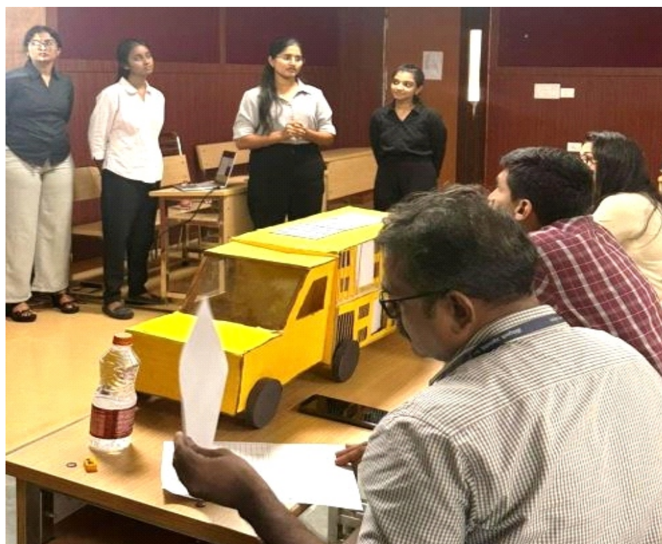
Students explaining their concept to Jury members