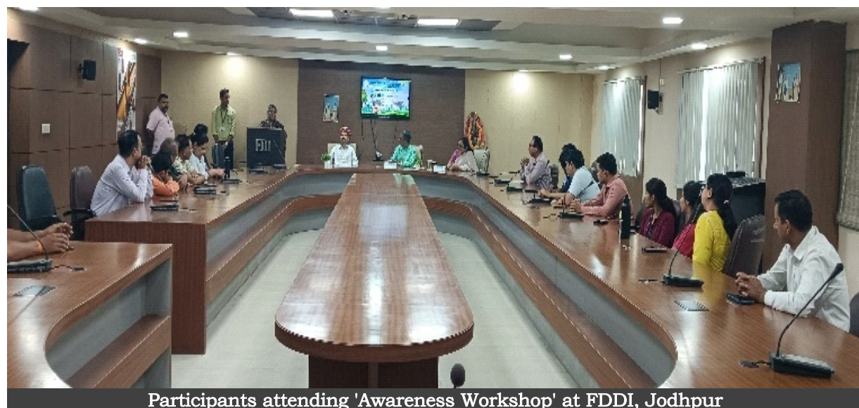
Participants attending 'Awareness Workshop' at FDDI, Jodhpur

On 05 th June, 2025, FDDI Campuses observed 'World Environment Day' by engaging in a series of environmentally conscious activities. The celebration began with the planting of saplings within the Institute premises, symbolizing a commitment to nurturing the environment and promoting greenery.