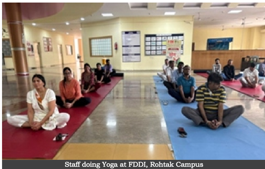
Staff doing Yoga at FDDI, Rohtak Campus