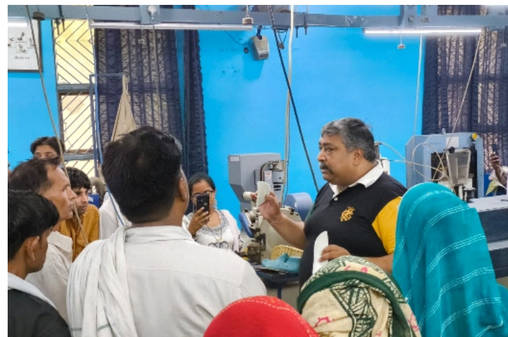
The group of artisans getting technical exposure at FDDI, Noida Campus

During the exposure visit, faculties of FDDI briefed them about various latest machineries, market trend, latest design & development, product costing, consumptions etc., which are important key factors for budding entrepreneurs in footwear industry.