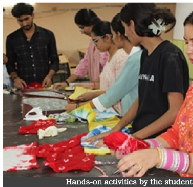
Hands-on activities by the students during 'Design Xplore 2025'