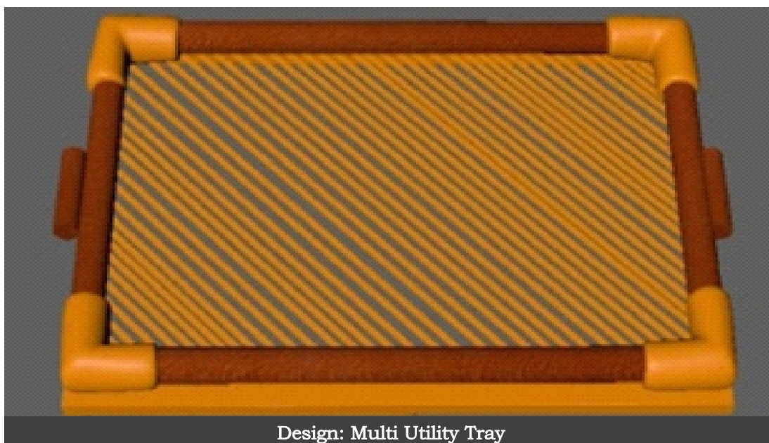
Design: Multi Utility Tray