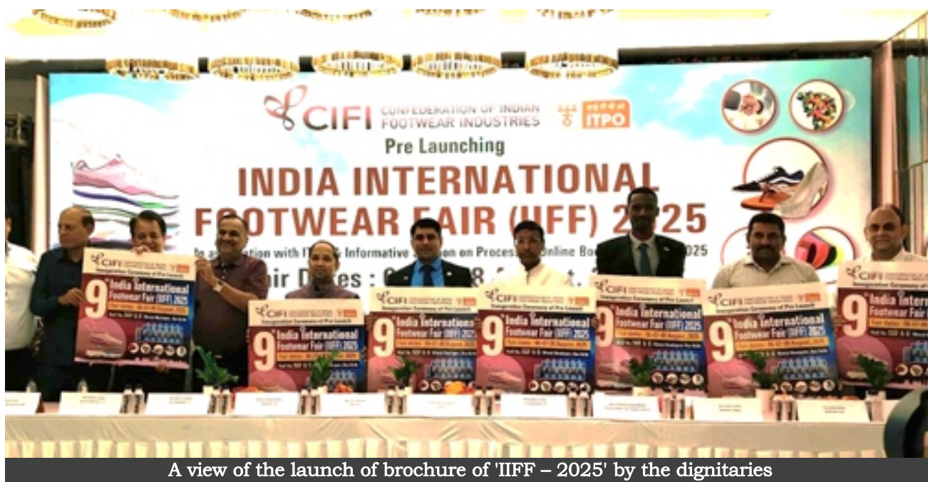
A view of the launch of brochure of 'IIFF – 2025' by the dignitaries