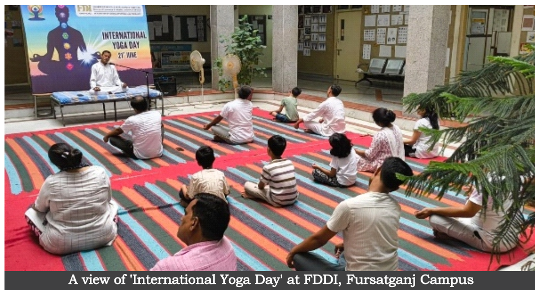
A view of 'International Yoga Day' at FDDI, Fursatganj Campus

At FDDI, Banur Campus, Yoga session was conducted by Yoga Trainer from Isha Foundation.