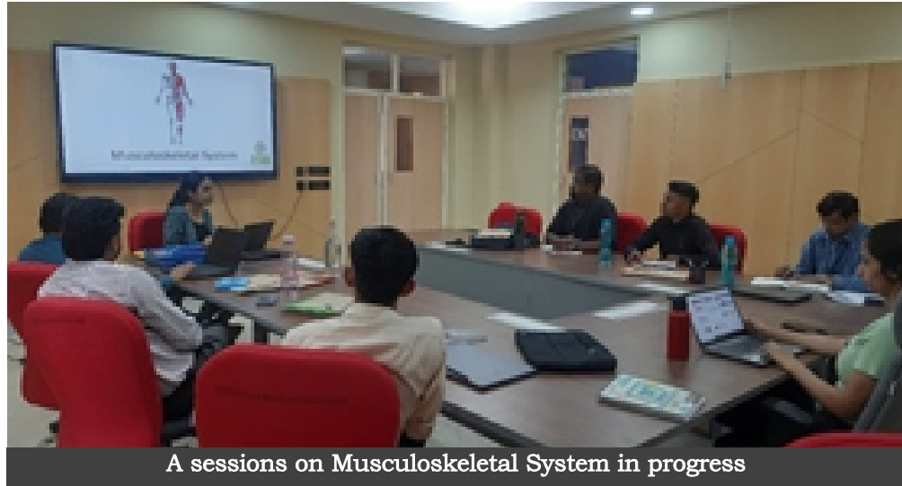
A sessions on Musculoskeletal System in progress

To enhance faculty expertise through the integration of scientific knowledge and practical applications in footwear technology and foot care design, FDDI Jodhpur Campus hosted a Faculty Development Program on 'Integrative Approaches in Applied Ergonomics, Prosthetics & Orthotics, and Last Modelling' from 23 rd to 27 th June 2025.