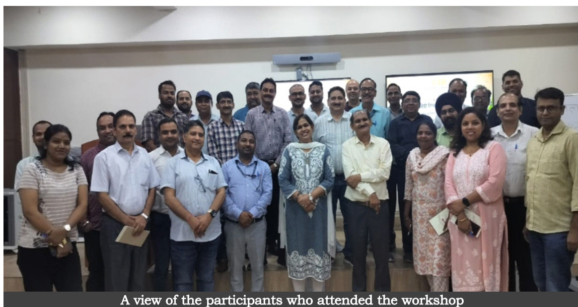
A view of the participants who attended the workshop

He provided an in-depth explanation of the techniques of noting and drafting, highlighting three key aspects: understanding the subject, assessing the current situation, and clearly stating the intended outcome. He said that the proposer should write all the facts of the note in a clear and concise form. At the end, he also conducted a practical session, guiding all participants through noting writing exercises.