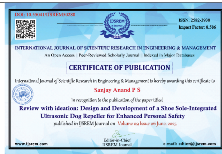
Certificate of Publication