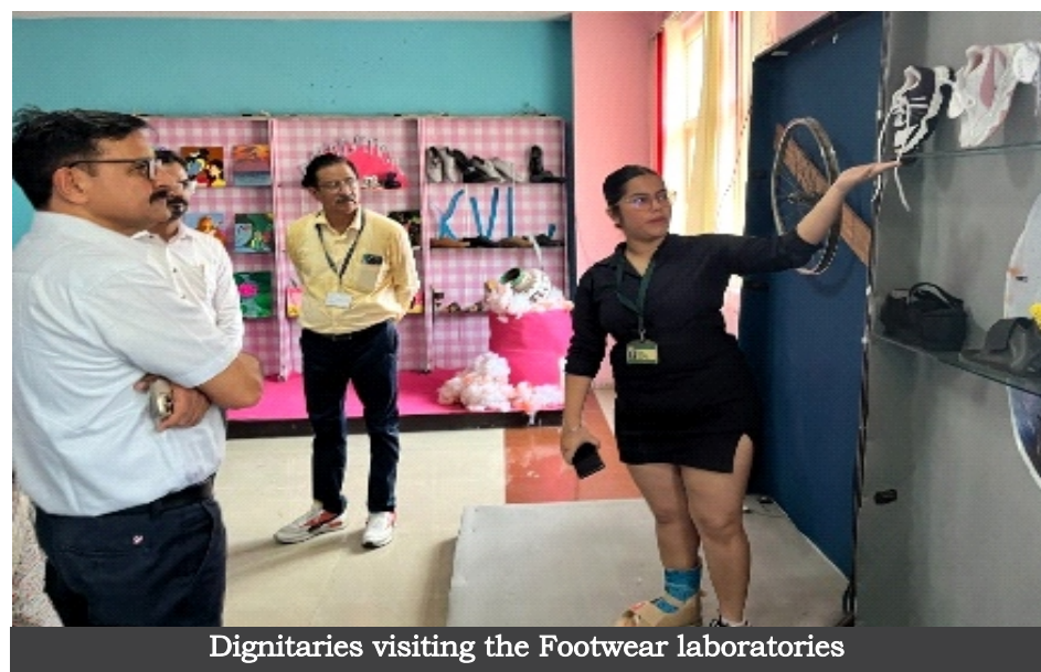
Dignitaries visiting the Footwear laboratories

The dignitaries visited the Footwear and Fashion Designing Laboratories, followed by the Centre of Excellence (CoE), where they commended the institute's impressive infrastructure and state-of-the-art facilities.