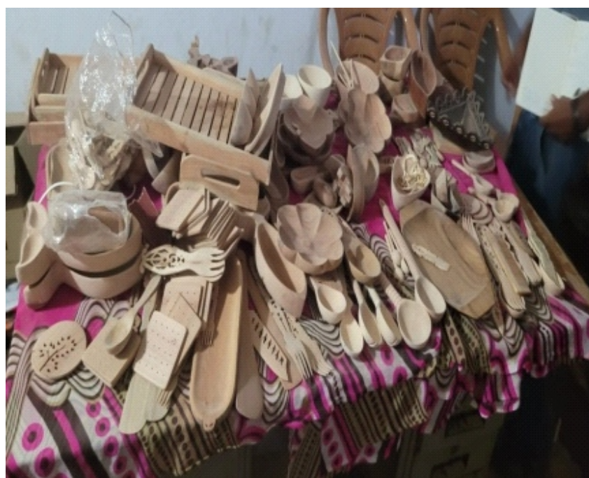
Wooden products Udayagiry Cutlery Crafts