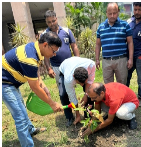
Planting of sapling at FDDI, Kolkata Campus

The celebration commenced with a symbolic yet impactful initiative—the installation of 'Parindas' (Bird feeders) and 'Gharondas' (Nests) across the campus. This thoughtful gesture aimed to ensure access to food, water, and safe nesting spaces for birds, reinforcing the event's message of coexistence and environmental stewardship.