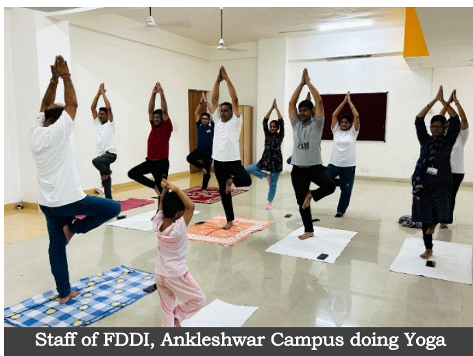
Staff of FDDI, Ankleshwar Campus doing Yoga