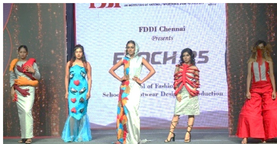
Students presenting their stunning collections on the ramp