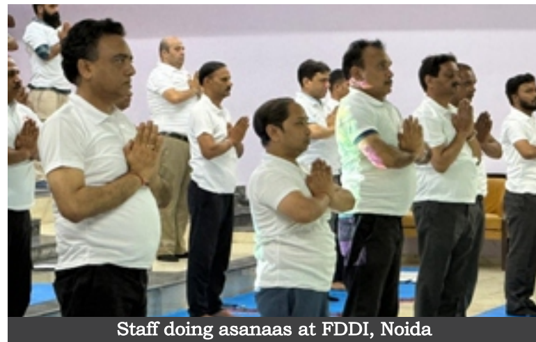
Staff doing asanaas at FDDI, Noida

At FDDI, Jodhpur Campus, various types of Yoga asanaas and breathing exercises were conducted by the staff of the institute under the guidance of Yoga expert from Rajasthan Ayurveda University.