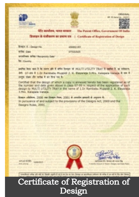
Certificate of Registration of Design