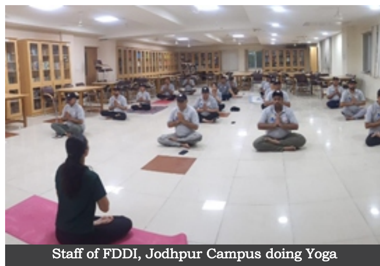
Staff of FDDI, Jodhpur Campus doing Yoga