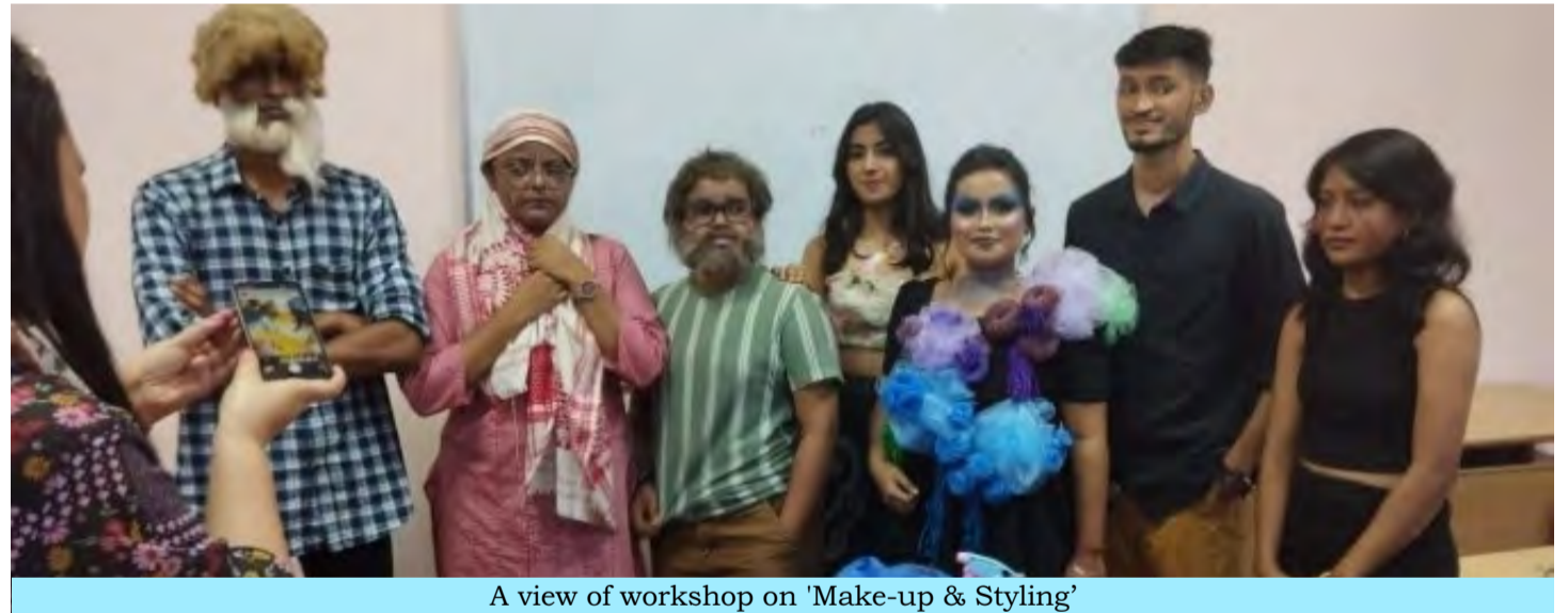
A view of workshop on 'Make-up & Styling'

During the workshop on 'Make-up & Styling', the experts explained the students about the makeup look techniques, products and the evolving make-up practices for different occasion.