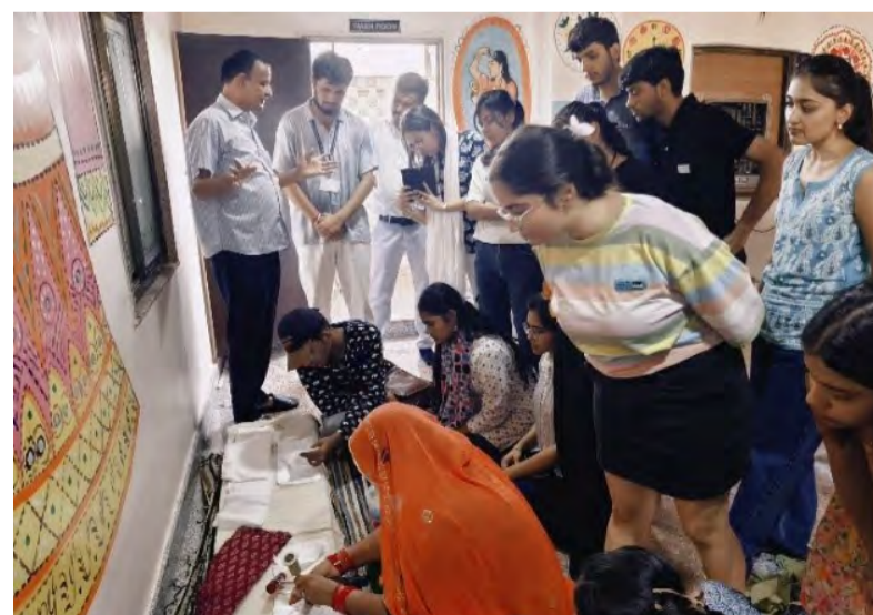
Students observing the process of patchwork and embroidery