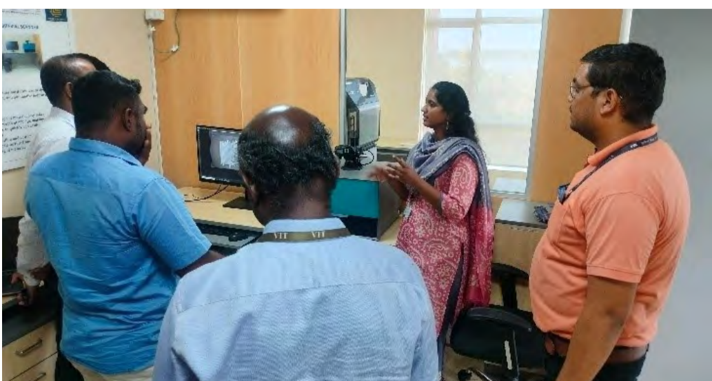
CoE-FDDI, Chennai staff briefing about the facility to the dignitaries