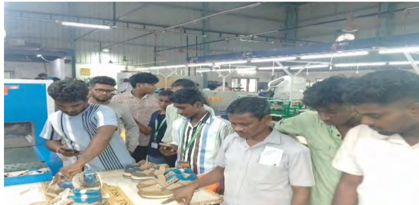
Students observing the shoe making process

Accompanied by their faculty, the students were offered hands-on opportunity to witness the intricacies of leather footwear manufacturing process.