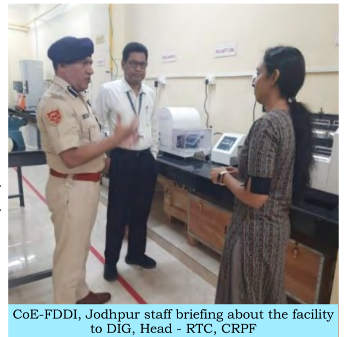
CoE-FDDI, Jodhpur staff briefing about the facility to DIG, Head - RTC, CRPF

Possibility of joint training initiatives and the development of customized footwear solutions tailored to the operational demands of the CRPF were also discussed.