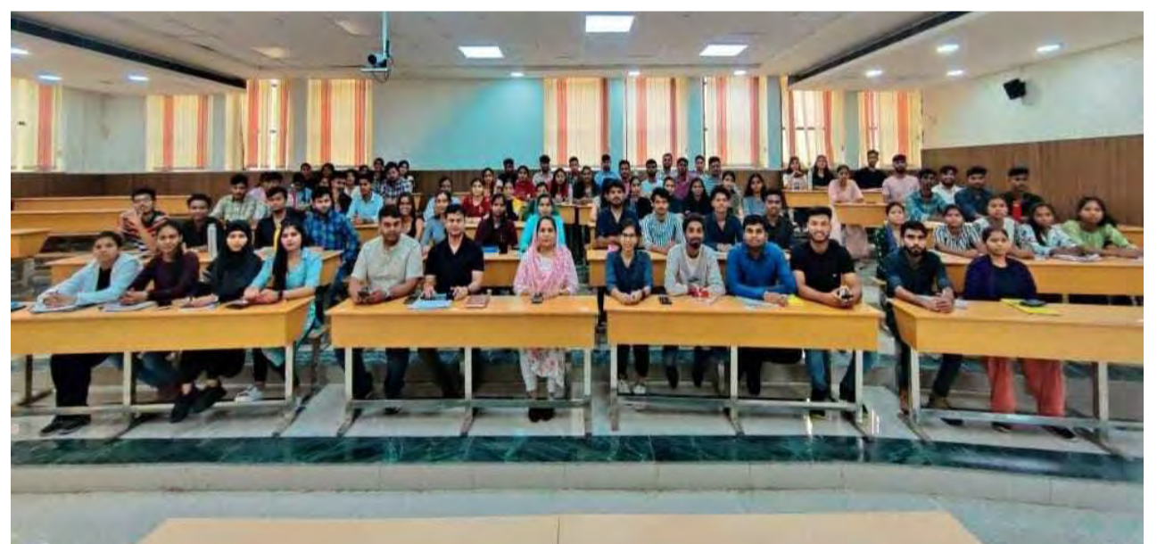
A view of the participants

The lecture encompassed several crucial aspects of soft skills in terms of attitude generation process, motivation, personality development, self-esteem, balancing the work-life aspects, in depth knowledge of skill development journey.