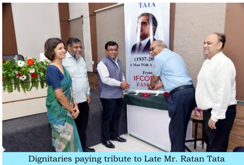
Dignitaries paying tribute to Late Mr. Ratan Tata