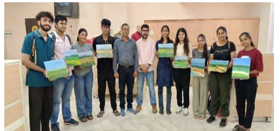
Students with their creative outcome