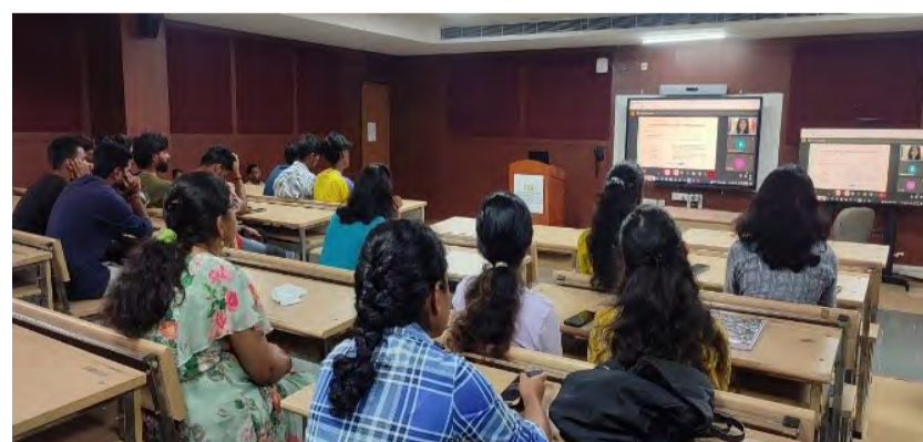
Students attending the session

Through presentation, she explained about the fundamentals of category management and briefed that retailers have to handle retail categories at many different levels like product class, product categories, sub-product categories, styles, brands etc.