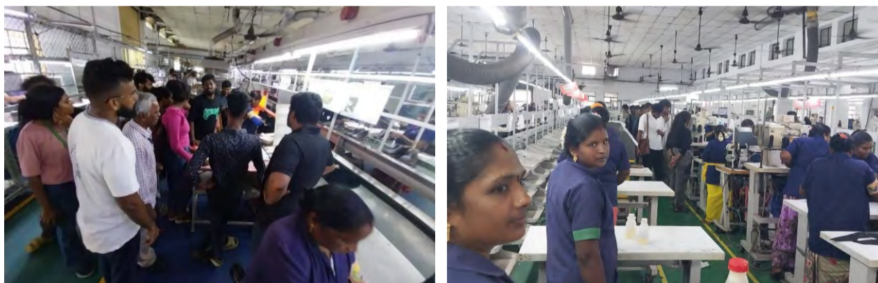
Students observing the footwear manufacturing process at PA Footwear P Ltd.

On 8 th October 2024, under the industrial visit, 25 students from B. Des (5th semester) and M. Des (1st and 3rd semesters) of the School of Footwear Design & Production (FDP) of FDDI, Chennai campus were taken to the factory visit at PA Footwear P Ltd., Chennai, located at Gummidipoondi and Sholavaram, Chennai.