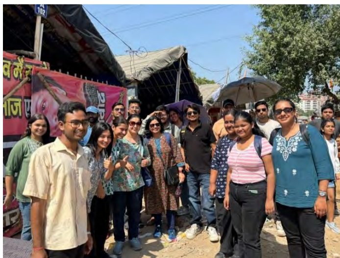
RFM students at Banjara Market

The visit offered a deep dive into the dynamics of retail management, product sourcing, and the influence of market trends. Students observed how reasonably priced goods are selected, priced, and curated for diverse consumer bases, offering practical insights into the theories they've explored in class.