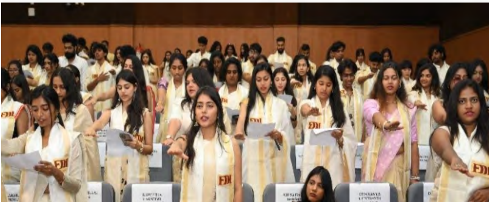
Students taking 'Passing Out Oath'