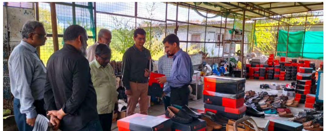
Delegates observing the 'Leather Pride' brand shoe

The delegation visited the proposed State Leather Park at Ghanpur, a significant project aimed at bolstering the leather sector in Telangana. The visit highlighted the strategic importance of this park in supporting both small and large leather manufacturers, offering modern facilities for leather processing, footwear, and leather goods production.