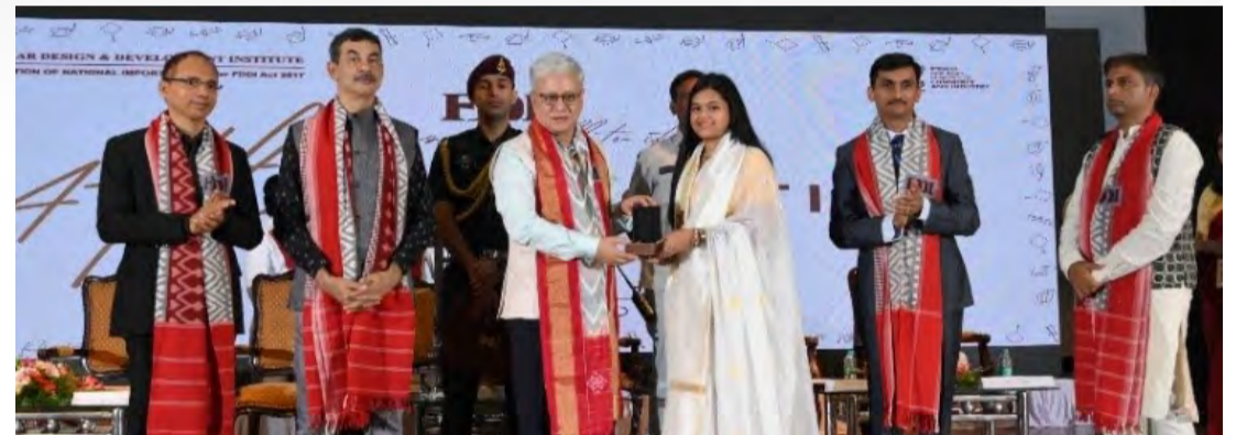
A graduating student receiving Degree from Mr. Jishnu Dev Varma, Hon'ble Governor of Telangana