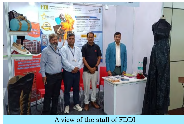
A view of the stall of FDDI