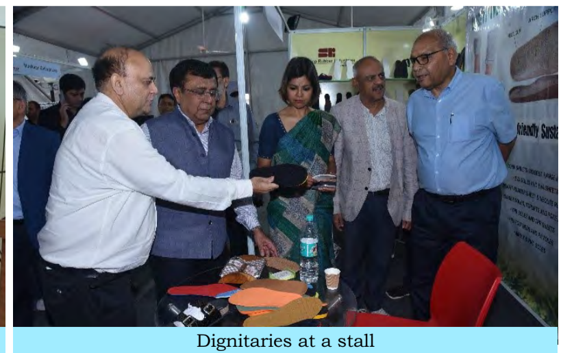
Dignitaries at a stall