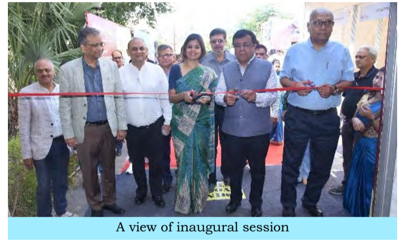
A view of inaugural session