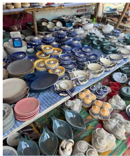
Products on display at Banjara Market

Known for its eclectic range of home décor and unique merchandise, the market provided a rich ground for students to witness how affordable products make their way into high-end retail spaces.