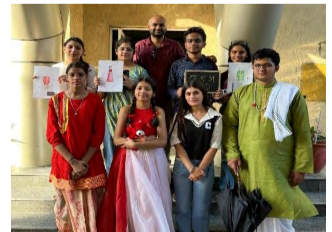
Students wearing costume in accordance with 'Characters in a Staged Tableau'

The workshop was an engaging and informative experience that broadened the knowledge of students in costume design.