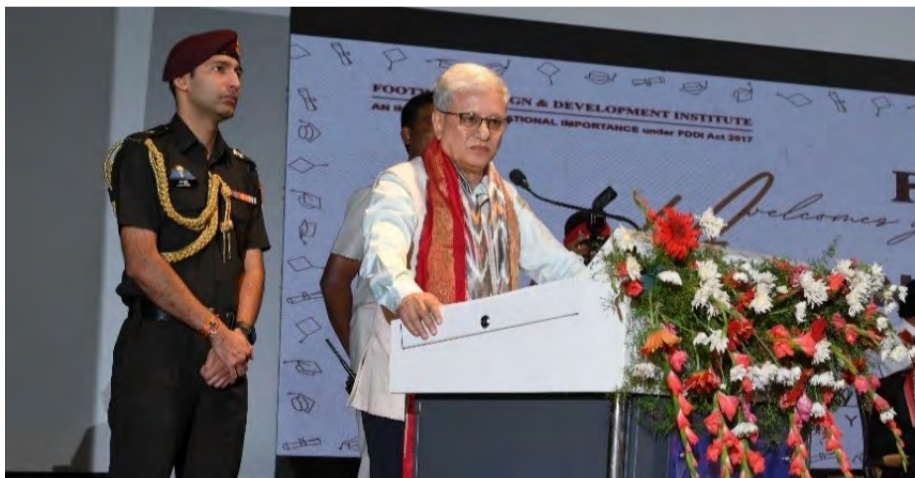
Mr. Jishnu Dev Varma, Hon'ble Governor of Telangana delivering 'Keynote Address'