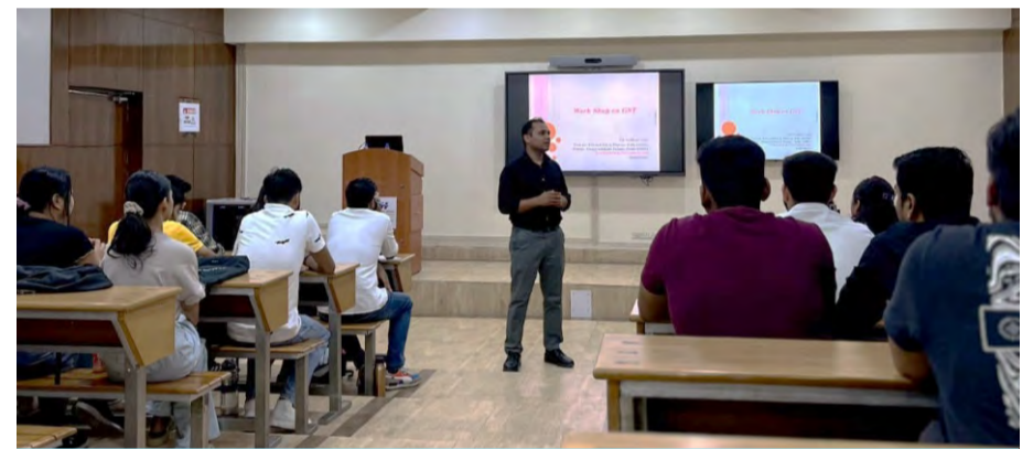
Students attending workshop on GST

The workshop concluded with an interactive quiz designed to assess the understanding and retention of the material covered.