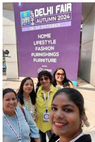
Faculties of LGAD at IHGF 2024