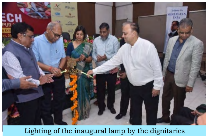
Lighting of the inaugural lamp by the dignitaries