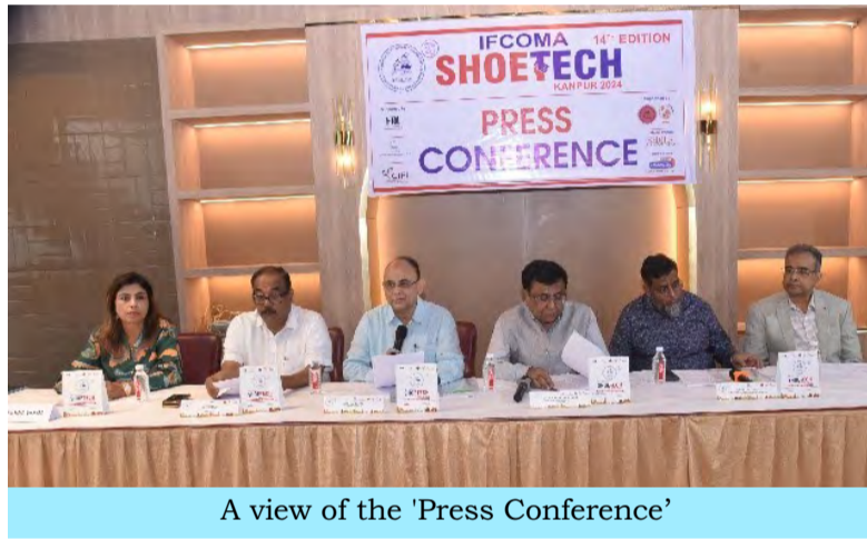
A view of the 'Press Conference'

participated in the Shoetech Kanpur and displayed various footwear components, accessories & machinery. This included specialized soles (TPR/TPU/PU etc.) of the latest design, plastic shoe lasts, insoles, toe-puff & counters, linings & interlinings, threads, finishes & chemicals, packaging boxes, shoe machinery and many other components & accessories.