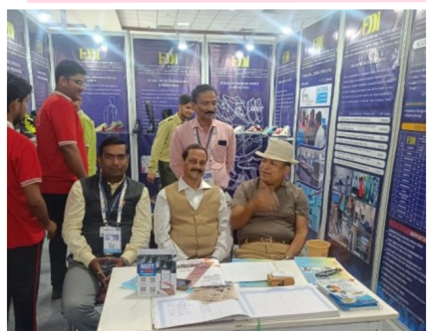
A view of the stall of FDDI