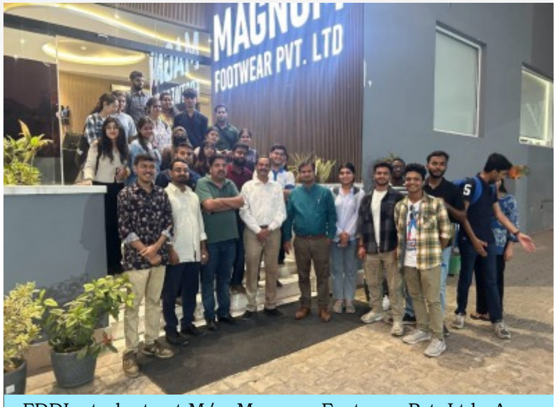
FDDI students at M/s. Magnum Footwear Pvt. Ltd., Agra

In concurrence, on 10th November 2024, the students of FDDI, Noida, under the industrial visit went to M/s. Magnum Footwear Pvt. Ltd., situated at center of Agra city, which was incorporated in 2010 with the motto of manufacturing high quality leather footwear.