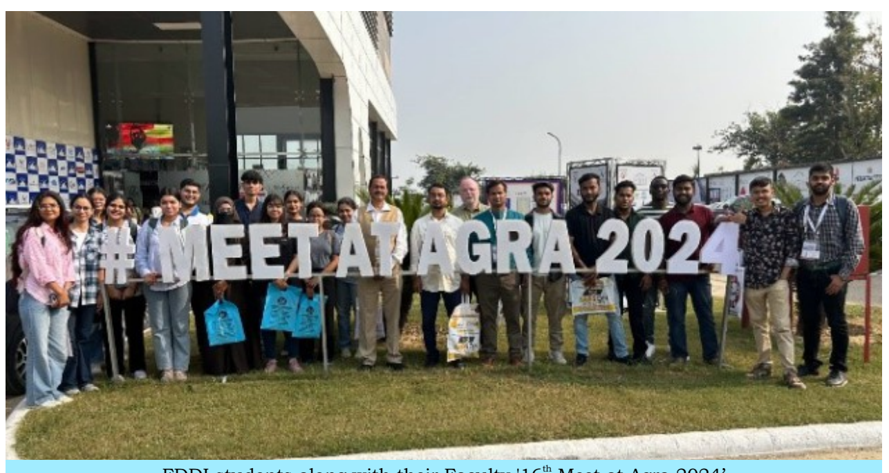
FDDI students along with their Faculty '16th Meet at Agra 2024'