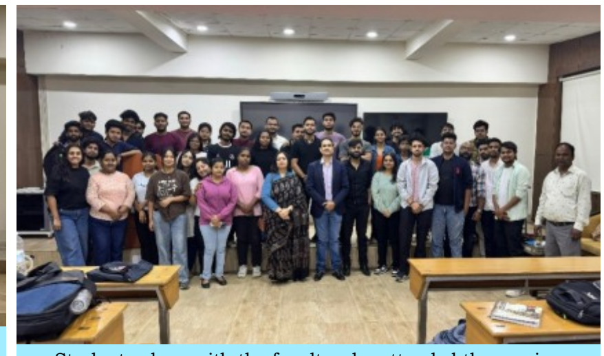
Students along with the faculty who attended the session