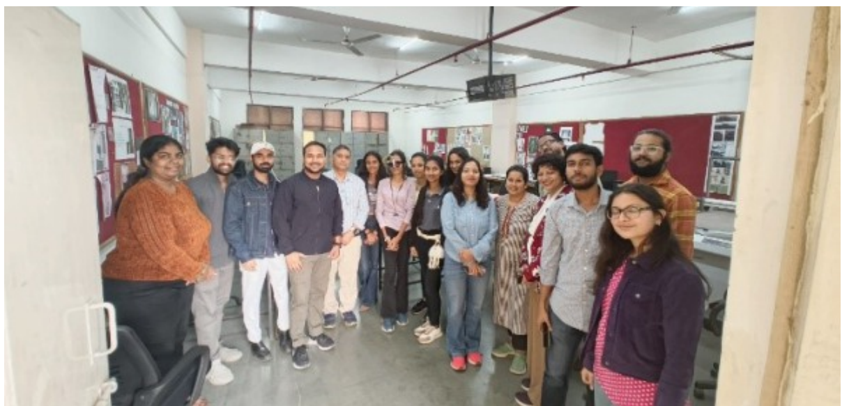
A view of the participants

The workshop not only enhanced participants' knowledge and skills but also inspired creativity in designing products with technology integration. Students from LGAD developed prototypes of smart gadgets including belts, caps, and shades designed to assist visually impaired individuals. These innovative designs reflected the perfect blend of technology and design, paving the way for futuristic concepts in the fashion and accessories industry.