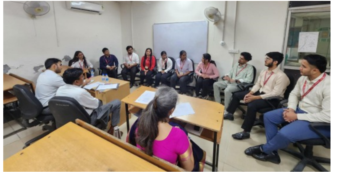
A view of the interactive session on 'Enhancing Soft Skills for Career Success'

He highlighted that soft skills are needed to deal with the external world and to work in a collaborative manner with one's colleagues and is an essential ingredient to improve one's overall effectiveness in life and business. This session gave students the chance to think about the current challenges in the retail world and how to communicate effectively and tackle problems more confidently with teamwork.