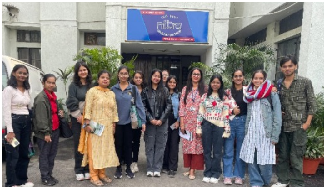
Students along with their faculty members at NITRA

The aim of the visit was to familiarize the students with the functioning of the textile industry which enabled them to integrate theory with practice and to acquaint them with the technologies and machinery used in the textile industry for processing of raw fiber convert into textile material.