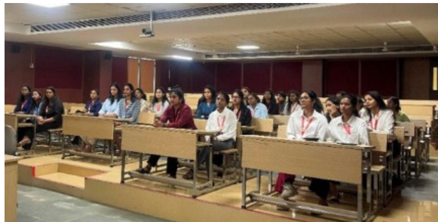
Students attending the session

Students were particularly inspired by her approach to combining traditional Indian aesthetics with modern sensibilities, offering a fresh perspective on designing for contemporary living spaces.