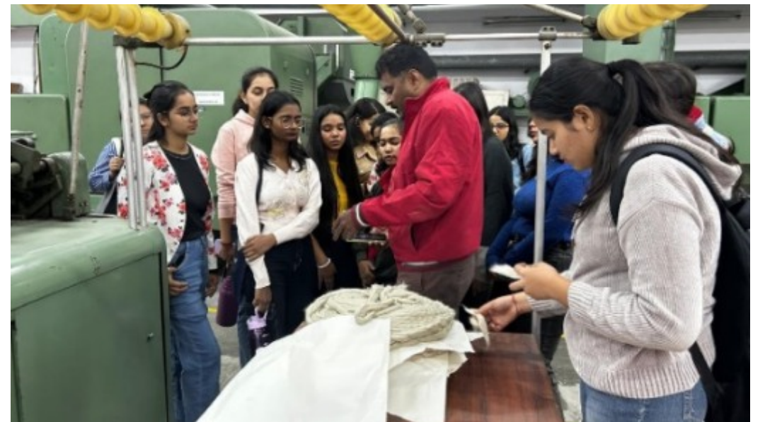
Students watching the procedure & working