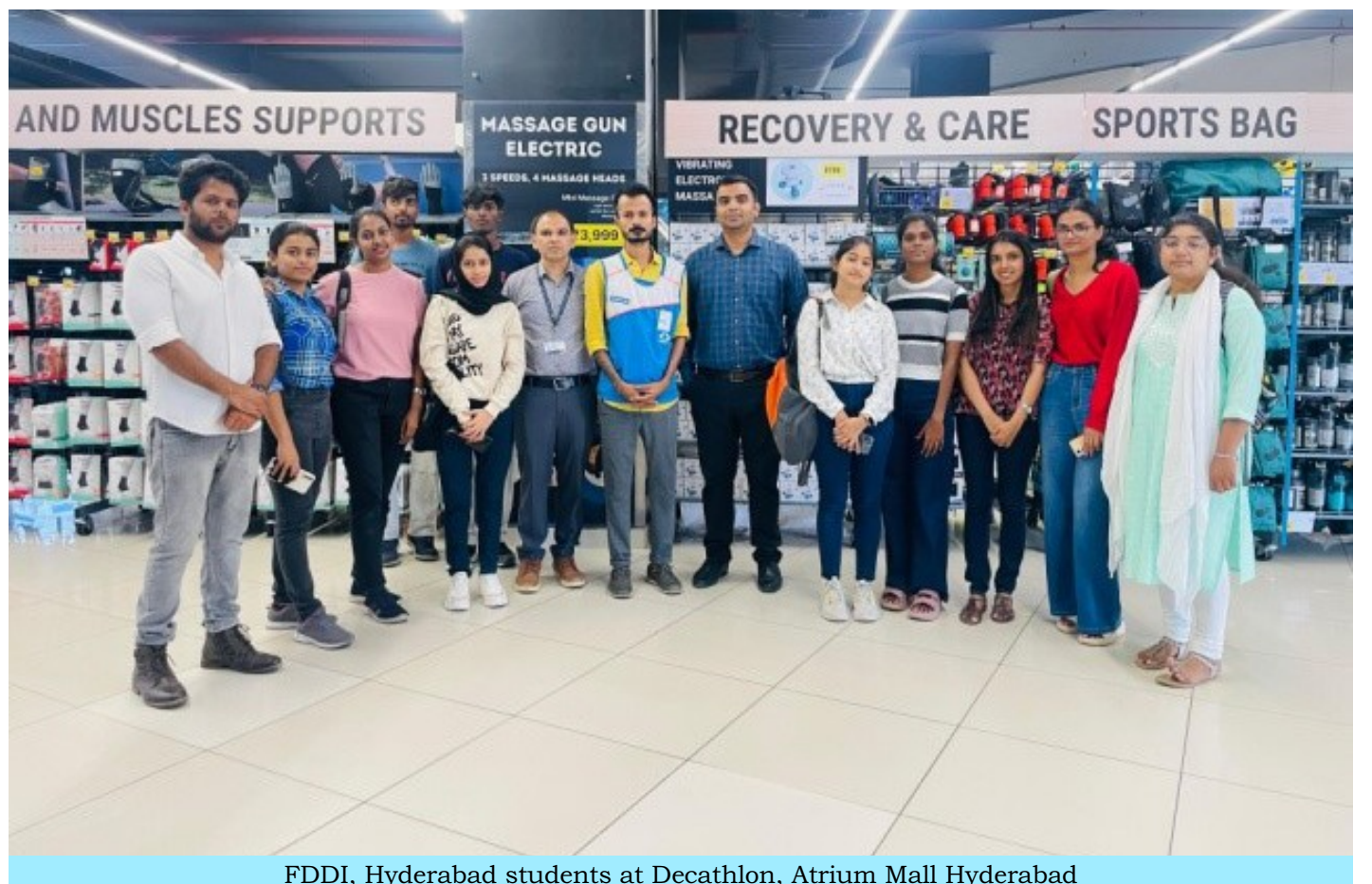
FDDI, Hyderabad students at Decathlon, Atrium Mall Hyderabad

During the visit, the students who were accompanied by faculty members got the opportunity to understand about daily activities performed in the store. They were exposed to various technologies Decathlon used for enhancement of consumer satisfaction and also to reduce shrinkages.