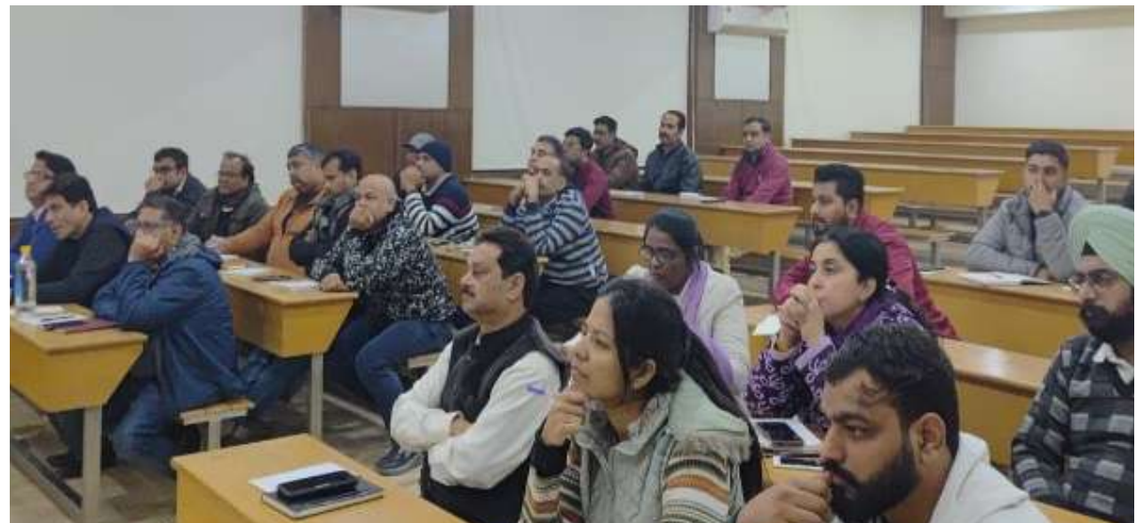
A view of participants