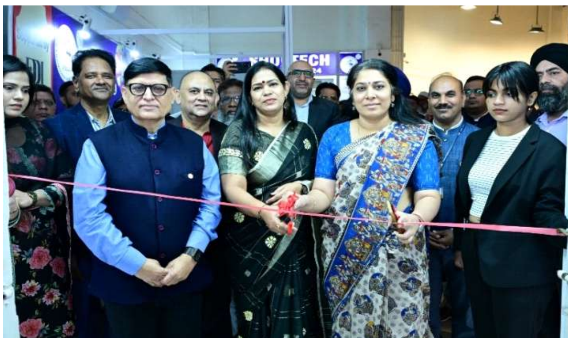
A view of the inauguration session

FDDI, Ankleshwar participated in the 13 th edition of 'SHOETECH Mumbai 2024' - Buyer-Sellers Meet cum Exhibition organized by Indian Footwear Components Manufacturers Association (IFCOMA) which was held on 18 th & 19 th December 2024 at Nehru Centre, Worli, Mumbai.