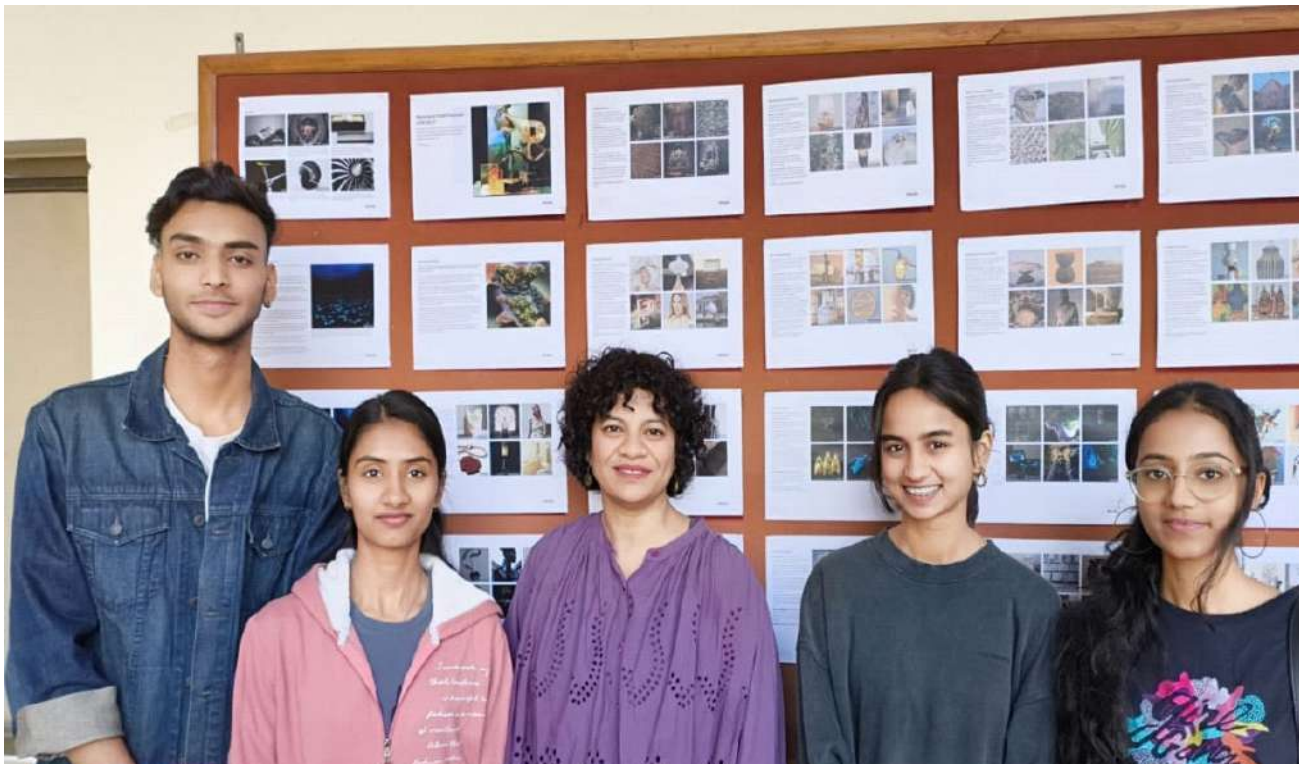
Students and faculty of LGAD, FDDI, Noida