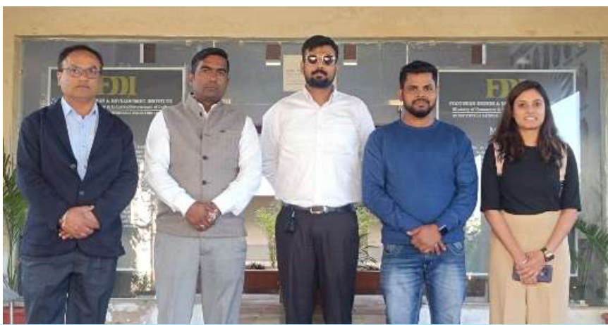
ABFRL-Pantaloons officials with FDDI Team