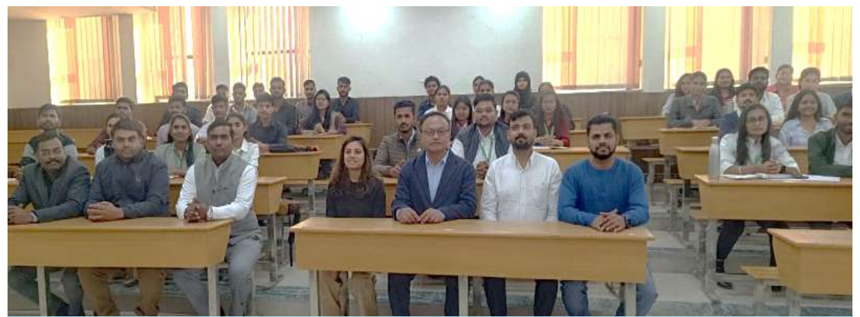
A view of the workshop

The workshop was attended by the final year students of FDDI, Guna and FDDI, Chhindwara campus benefiting from firsthand knowledge of the corporate world and understanding the dynamic nature of retail management.