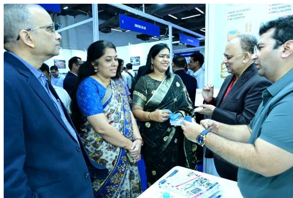
An exhibitor briefing about the product to the dignitaries