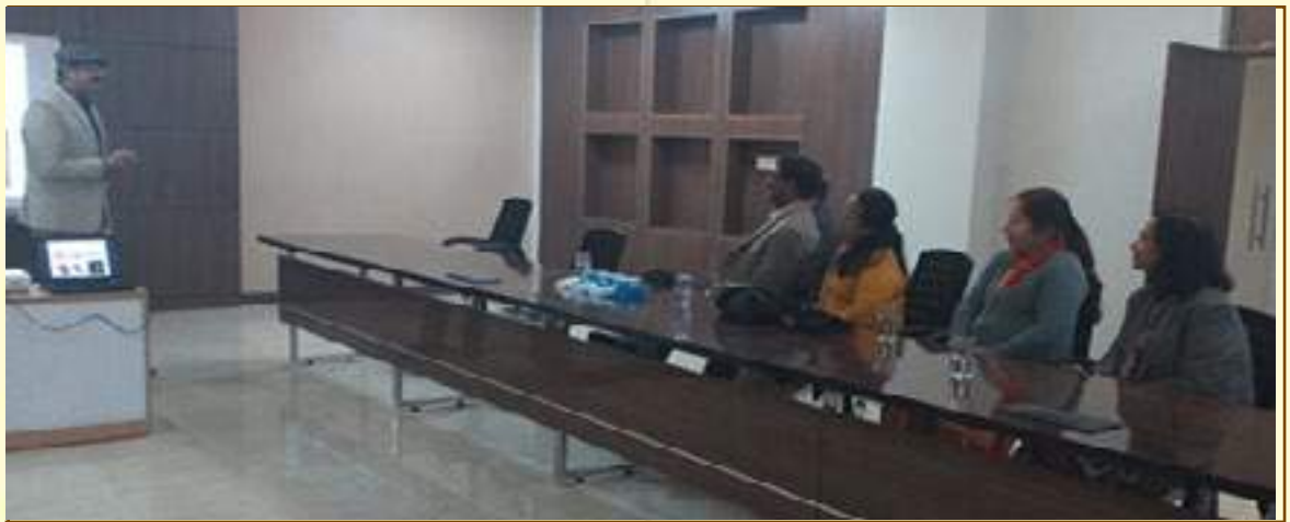
A view of the presentation

The delegation enquired about the programmes conducted by