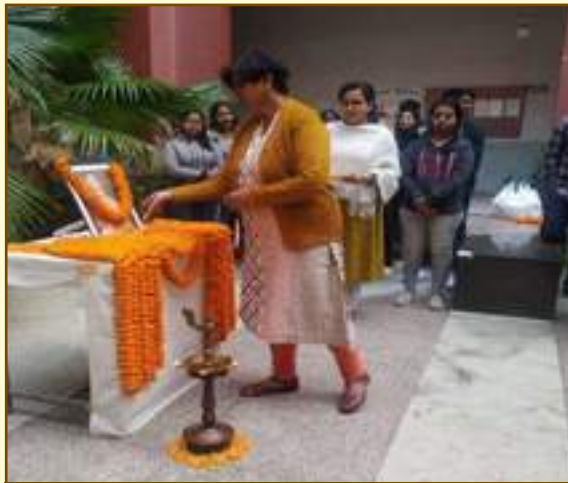
Floral homage was paid to Swami Vivekananda at FDDI, Kolkata campus

Western world, which put India on the spiritual map.