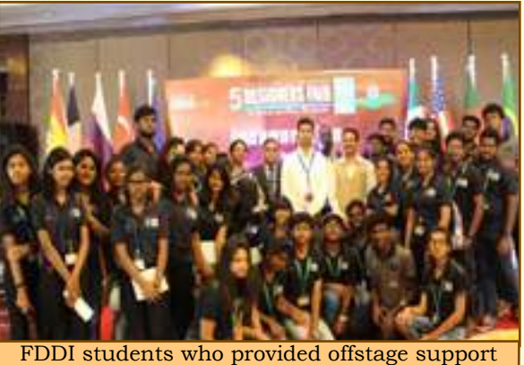
during Leather Fashion show

During IILF, Leather Fashion show was held at ITC Grand Chola in which the students of Fashion Designing department of FDDI provided offstage support to the high profile models.