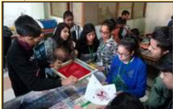
The workshop in progress

A workshop on 'Drawing & Design Development Skills' was organized at the Footwear Design & Development Institute (FDDI), Fursatganj campus from January 22-25, 2020.