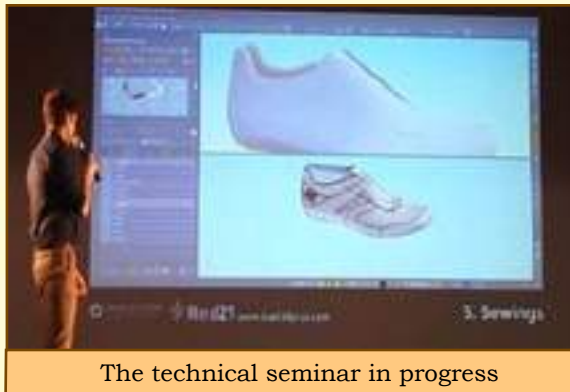
The technical seminar in progress

A technical seminar on 'I CAD 3D+ PRO' software was held at Footwear Design & Development Institute (FDDI), Hyderabad campus on 7 th February 2020.