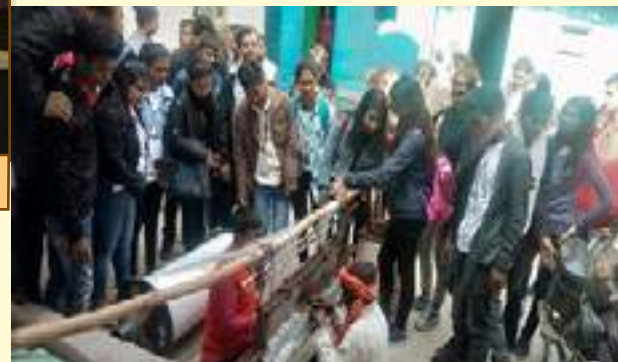
FDDI, Patna students learning about weaving mechanism

Bihar is a leading State with 90,000 weavers. Manpur cluster of Gaya is specially known for weaving through handloom and powerloom machines. This cluster is known for weaving of towels, blanket covers and other household things.