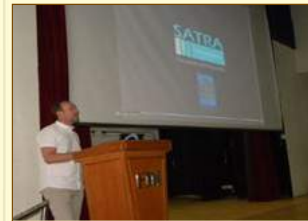
The seminar in progress

Footwear Design & Development Institute (FDDI) in association with Shoe and Allied Trade Research Association (SATRA), United Kingdom (UK) organized a seminar on "Meeting the Challenges in Producing Sustainable Leather and Footwear" on 6 th February 2020.