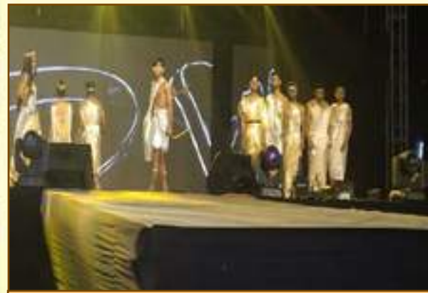
FDDI students walking on the ramp

The students of Footwear Design & Development Institute (FDDI), Patna campus participated in the annual fest 'Anwasha' which was organized by Indian Institute of Technology (IIT), Patna from 08-09 February 2020.