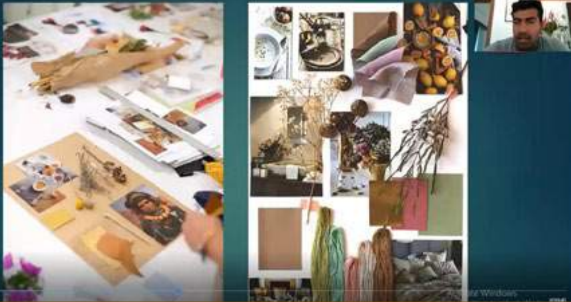
A screen shot of a webinar

This webinar saw a large participation of the students and