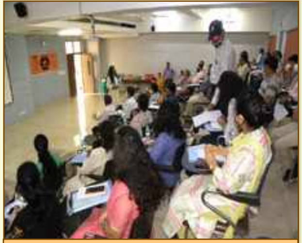
The session in progress

good mental health is the need of hour for maintaining a balance between personal and professional life and to stay calm under pressure."