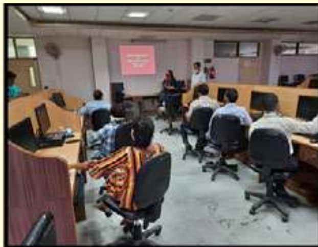
Staff Development Program in Process

For upgrading the skill of staff members, a Staff Development Program on 'Digital Presentation Graphics' was held at Footwear Design & Development Institute (FDDI), Fursatganj campus.