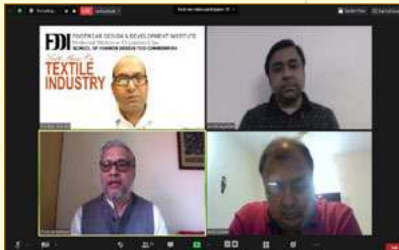
Screen shot of the webinar

All the resource persons briefed about the current scenario of COVID-19 and the changes that has been initiated in the Textile and Apparel sector in India. They opined that the industry is going through structural changes but, new opportunities lies with the problem and current situation.