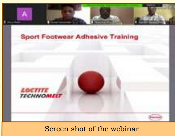
Screen shot of the webinar

A webinar on 'Different Types of Adhesive used in Footwear and Leather Goods Industry' was held at Footwear Design & Development Institute (FDDI), Kolkata campus on 18 th August 2020.