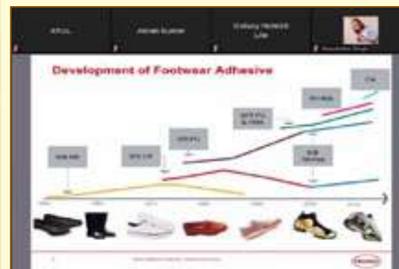
Another screen shot of the webinar

Henkel is a leading multinational company and is associated with big companies in India like Adidas, Puma, Nike, Bata, etc.