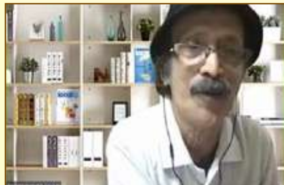
Screen shot of e-workshop on 'Life in Style'