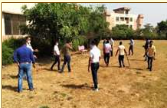
A view of the cleanliness drive at FDDI, Rohtak

Sanitation and plantation campaign was carried out under the 'Swachhata Pakhwada' at Footwear Design & Development Institute (FDDI), Rohtak campus on October 7, 2020.