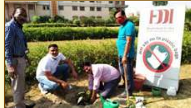
A view of the plantation campaign

The highlight of the event was that the buds of all these plants were prepared by the staff members themselves. The initiative would bring major relief to the environment and the society.