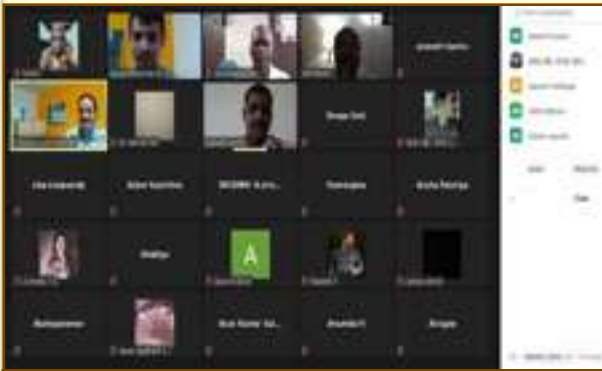
Screen shot of the webinar