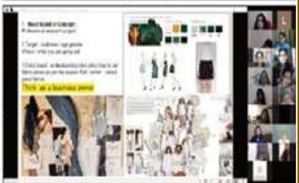
Resource person briefing about the 'Design Process' in 'Portfolio Development'

will help them in expressing and translating their product designs & creative thoughts in view of the current prevailing COVID-19 pandemic.