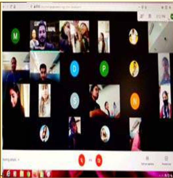
Screen shot participants attending the e-workshop

The webinar was organized by School of Retail and Fashion Merchandising of FDDI, which provided an insight to the students on the importance of digital marketing in today's business world.