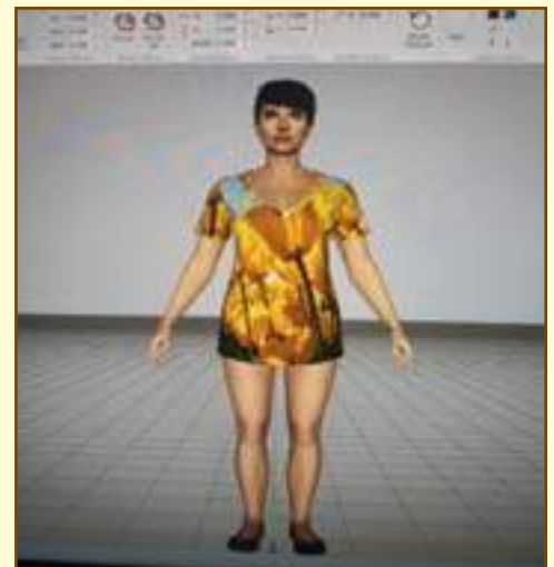
Online session demonstrating custom virtual fit model