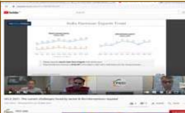
Screenshot of the digital sessions conducted during VFLE 2021