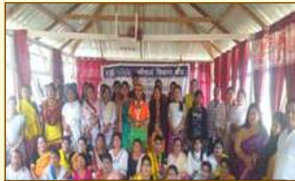
A view of the trainees along with the dignitaries

Kauna, Cane and Bamboo small products of Manipur like coasters, pen stand, mats, mugs, bags etc. have a rich appeal to the customers and are a crowd puller in various tradeshows and expos. The value addition of these craft products using leather will be very beneficial in increasing the acceptability of these products and enhance its market value.