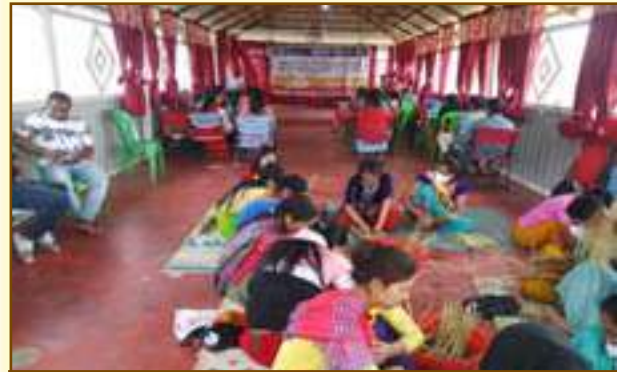
Another view of the training

The purpose of the visit was to provide operational exposure to the students about the intricacies of sports footwear design and how to align it with current aetiology so as to minimize the Running-Related Injuries (RRI).