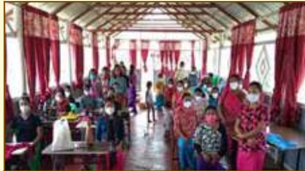
Training in progress