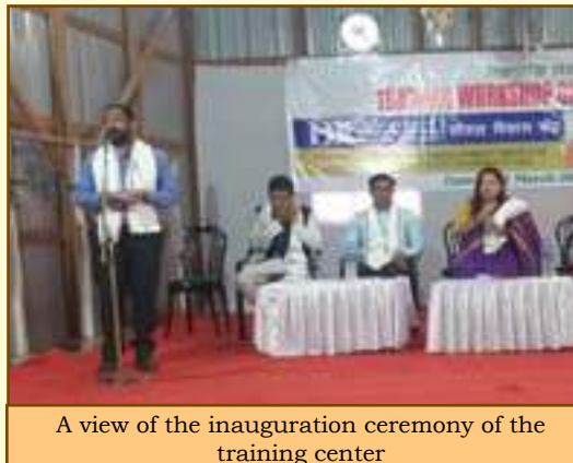
A view of the inauguration ceremony of the training center