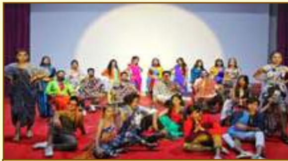
Workshop in Progress - Indoor & Outdoor photography

A workshop on 'Photography' was organized at the Footwear Design & Development Institute (FDDI), Chhindwara campus for the students & faculty of FDDI School of Fashion Design (FSFD).