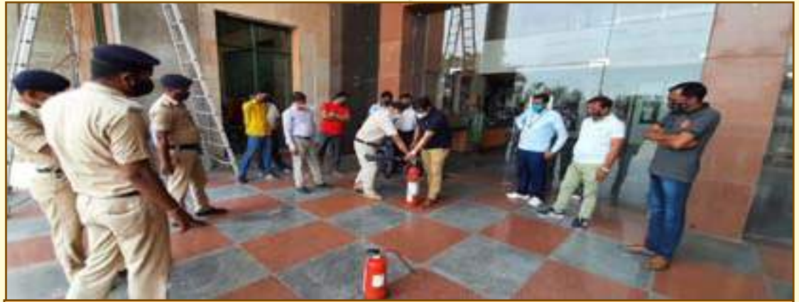
Demonstration during 'Fire Mock & Evacuation Drill'

Fire Academy, Anandpur, Bihta conducted the drill & explained about the need of a preparedness plan.