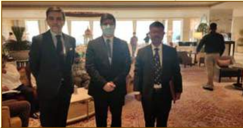
Dignitaries on the occasion of signing of the MoU

two institutions in the areas of consulting assignments and sectoral studies, industrial trainings, laboratory testing operations, R&D activities as well as capacity building