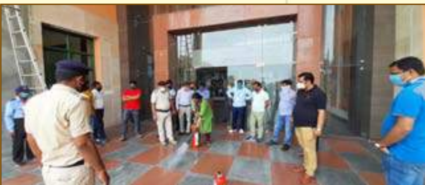
A female staff being demonstrated about the use of fire safety equipment

They imparted critical inputs of do's & don'ts in the case of fire with reference to building as well as vehicles and also explained about the types of fire and the