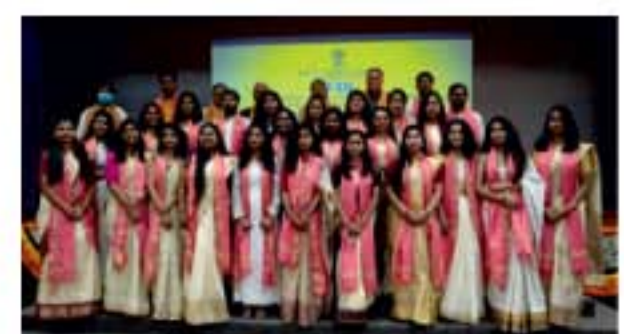
The graduating batch