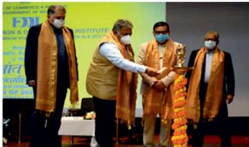
Lighting-up of the ceremonial lamp by the dignitaries

Footwear Design & Development Institute (FDDI), Hyderabad held its 1 st Convocation ceremony on 03 rd January 2022, after getting the status of 'Institution of National Importance' (INI) in the year 2017.