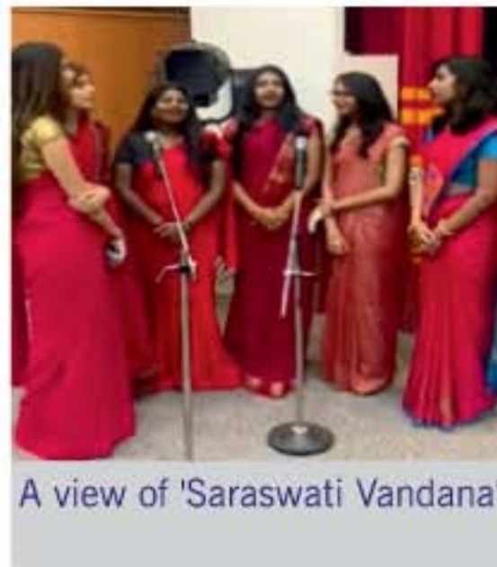
A view of 'Saraswati Vandana'