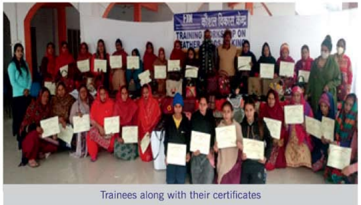
Trainees along with their certificates

They are technically equipped & capable to make day to day products like Ladies Belt, File Folder, Photo frame, Table Mat, Table Lamp Stand, Jutti incorporating leather along with textile products like Jhola Bag, Shopping Bag, Laptop Bag using tweed fabric incorporating embroidery, which demonstrates the legacy of Jammu & Kashmir.