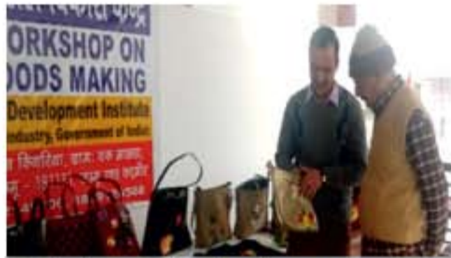
Display of day to day product(s) incorporating leather, textile & embroidery developed by the participants

The third consecutive initiative of conducting 'Training Workshop on Leather Goods Making' in Jammu district by Footwear Design & Development Institute (FDDI) has achieved the desired objective.