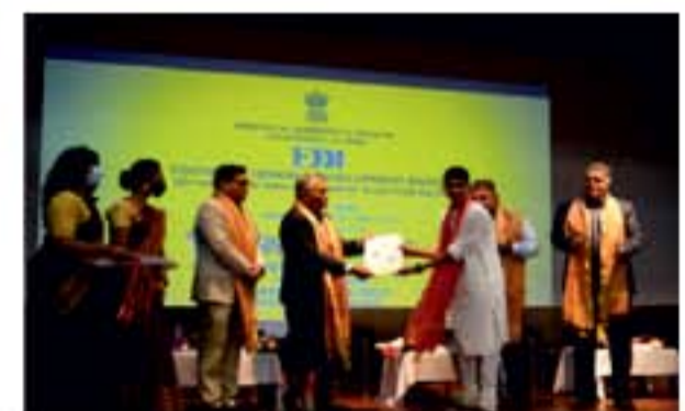
A graduating student receiving Degree during the Convocation ceremony