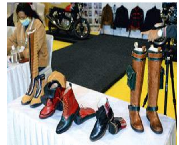
A display of product (s) - Shoe Making (Leather) competition

for Garment Making competition were the Jury members for Garment Making (Leather) competition.