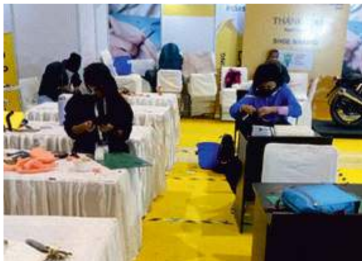
A view of the participants of Shoe Making (Leather) competition

Footwear Design & Development Institute (FDDI) participated in 'India Skills National Competition 2021' which was held from 7 th to 9 th January 2022 at Pragati Maidan, New Delhi.