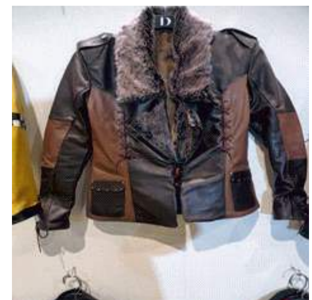
A display of product - Garment Making (Leather) competition

The competition provided a platform for skilled and talented Indian youngsters to showcase their abilities.