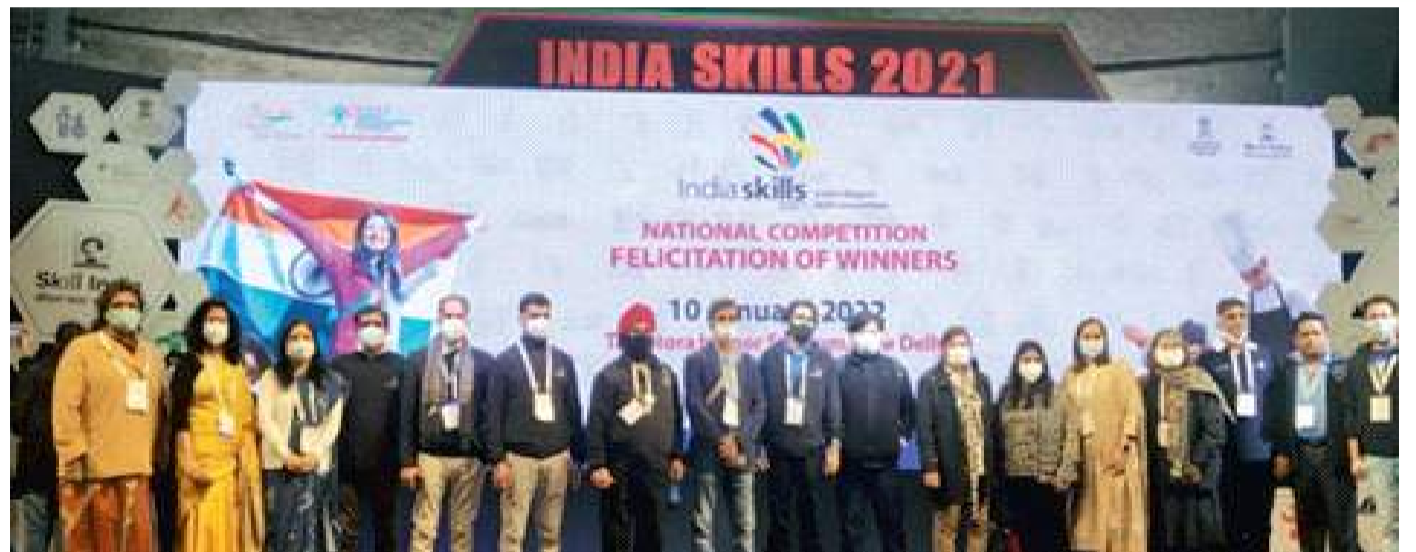
A view of 'Felicitations ceremony'

On 10 th January 2022, all the participants (more than 150) of India Skills 2021 Nationals, the country's biggest skill competition, were felicitated by Mr. Rajesh Aggarwal, Secretary, MSDE, Government of India