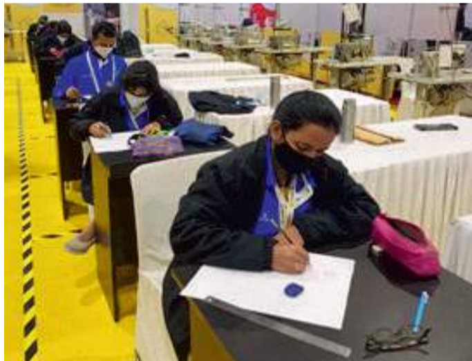
A view of the participants of Garment Making (Leather) competition

It was organized by National Skill Development Corporation (NSDC), the nodal agency for skill and entrepreneurship development, working under the guidance of the Ministry of Skill Development and Entrepreneurship (MSDE).