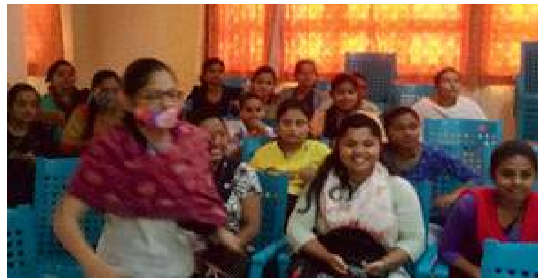
A view of the open session

During the lecture, various concepts of Soft Skills and Personality Development were explained to the students. The practical application of these skills regarding preparation of Cover Letter, Resume, Group Discussion and Interview were explained in detail.