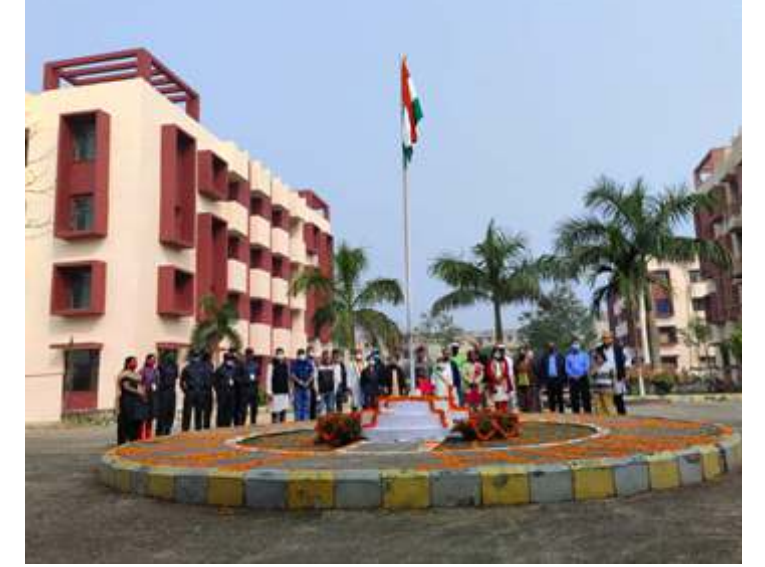
Unfurling of the Tri-colour at FDDI, Kolkata campus