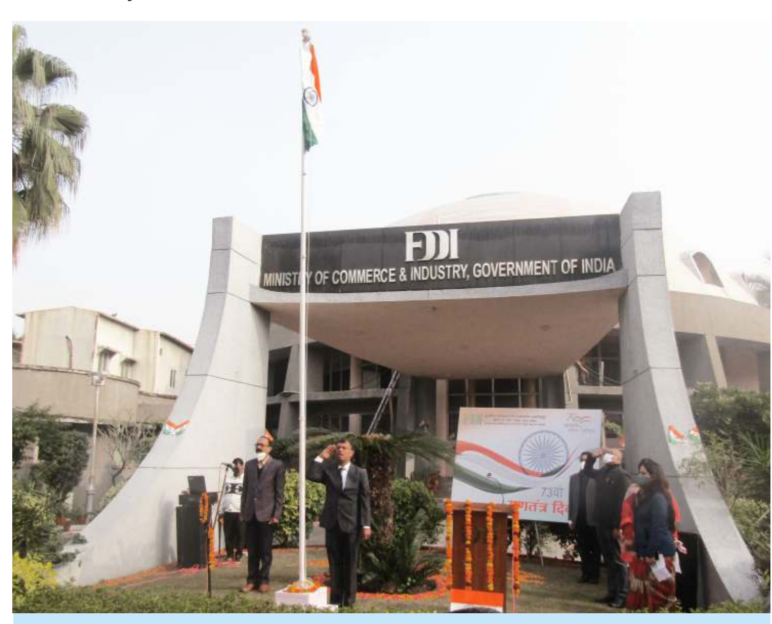
A view of flag hoisting at FDDI, Noida

The 73<sup>rd</sup> Republic Day was celebrated with great enthusiasm and patriotism at all the campuses of Footwear Design & Development Institute (FDDI) located at Noida, Fursatganj, Chennai, Kolkata, Rohtak, Chhindwara, Guna, Jodhpur, Ankleshwar, Patna, Banur and Hyderabad on 26<sup>th</sup> January 2022.