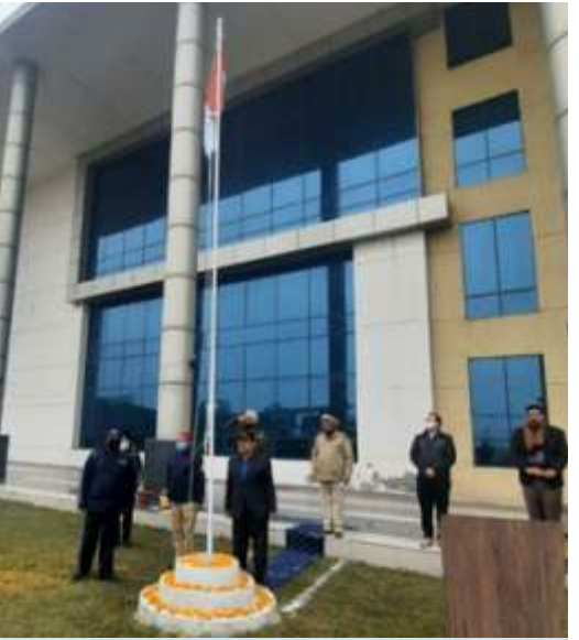
A view of flag hoisting at FDDI, Banur campus

The national flag hoisting ceremony was held at all the other campuses of FDDI amidst playing of national anthem with full spirit of patriotic enthusiasm.