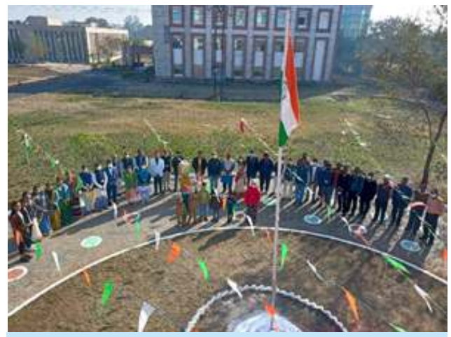
Unfurling of the Tri-colour at FDDI, Chhindwara campus

It was the day on which we became a sovereign democratic republic country and the Constitution of our country came into force.