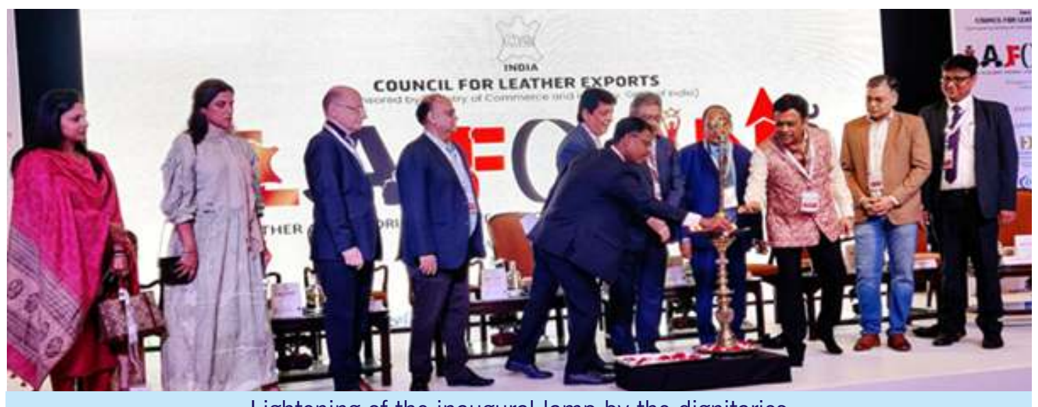
Lightening of the inaugural lamp by the dignitaries

The conclave, a significant networking platform was organized to help in motivating and guiding member exporters of CLE to achieve the ambitious target of USD 30 bn by 2025.