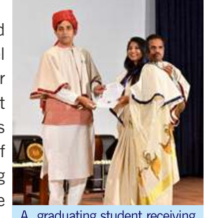
A graduating student receiving Degree during the Convocation ceremony

He also said that the level of higher education that FDDI is capable of providing today is the combined contribution of