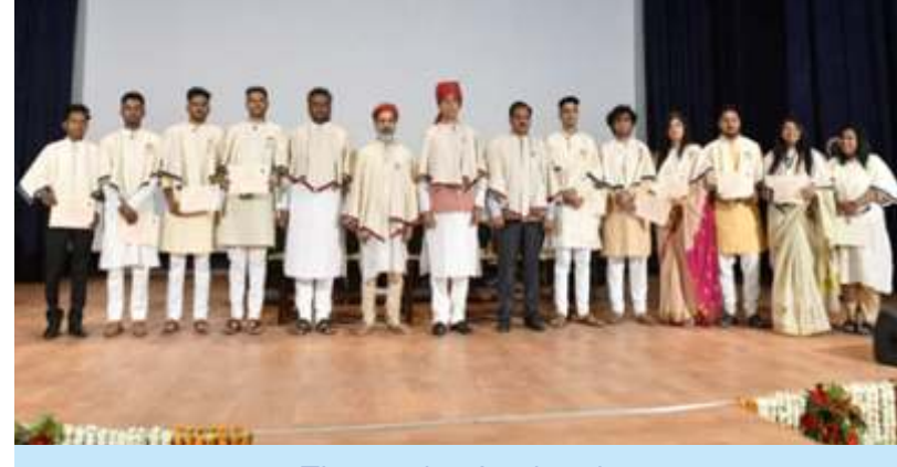
The graduating batch

its trained faculty and students. He motivated the students and said that if any student wants to start his own business in textiles or footwear after taking education from FDDI, then KVIC will provide financial aid so that one can contribute to the progress of our country and create jobs for others.