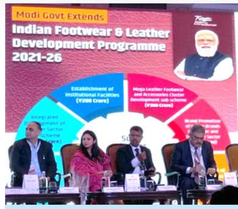
A view of the 'Panel Discussion'

Speed, Sustainability, Supply Chain, Style and Sales which are interrelated factors and it is required to give equal attention to each of the seven Ss.