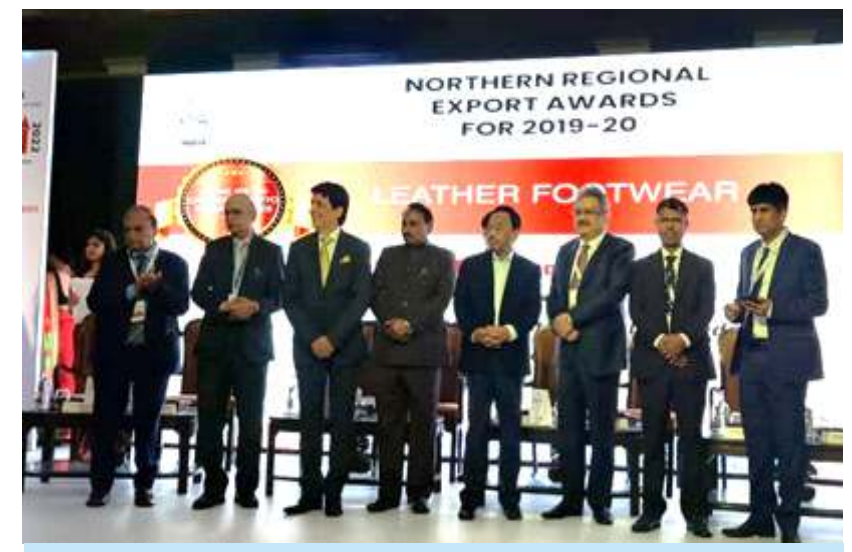
Dignitaries present during the Export Award Function