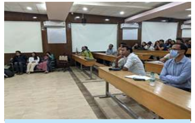
A view of the participants of FDDI, NOIDA campus attending the Master class

In concurrence, WGSN is organizing a series of Master classes in association with the FDDI School of Leather Goods & Accessories Design (FSLGAD). Under this, the first class on 'Trend and Forecast by WGSN' was held on 18th February 2022.