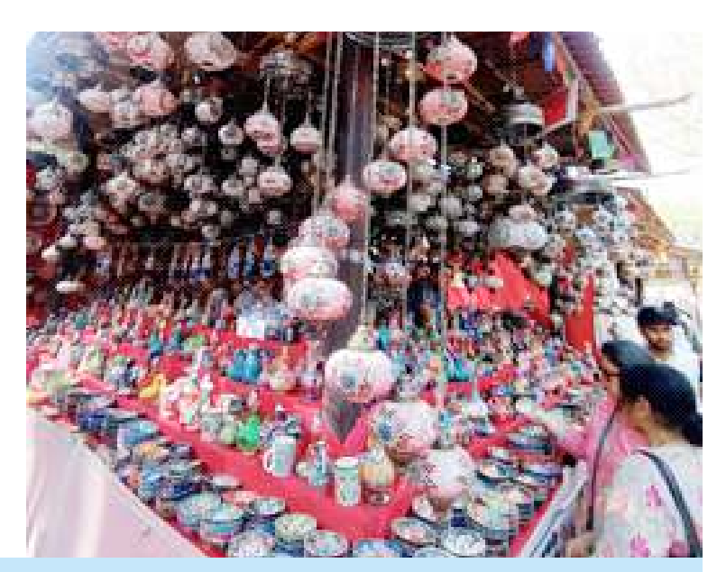
A view of the students visiting stall/ fair

The novelty of the SICF is that one of the Indian States gets the honour to occupy the position of the 'Theme State' each year.