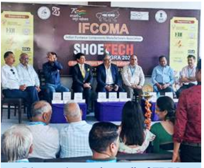
Dignatories at the stall of FDDI

During this occasion, the Footwear Component Industries were awarded for their exemplary roll in support of the footwear industry. Women entrepreneurial skill was also recognized in this event. Various components manufacturers and institutions displayed their products in 76 stalls comprising footwear component, chemical, shoe last, exotic leather and machinery spare parts.