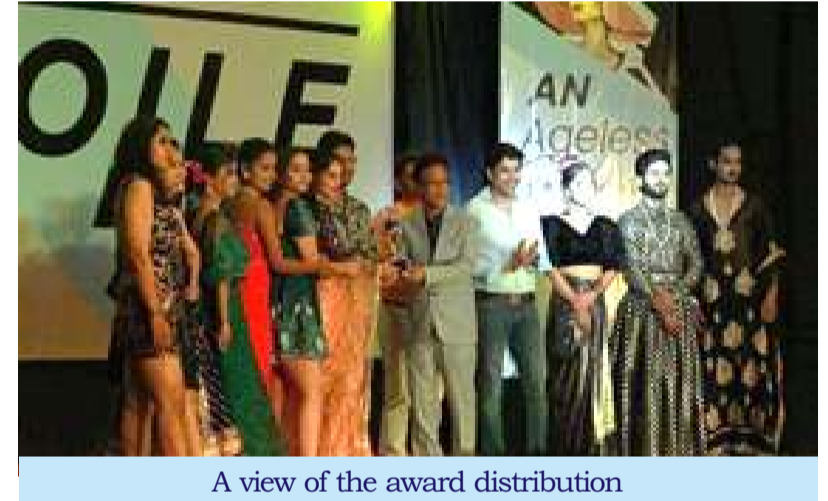
A view of the award distribution