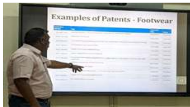
View of the workshop