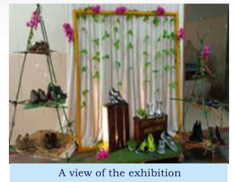
A view of the exhibition