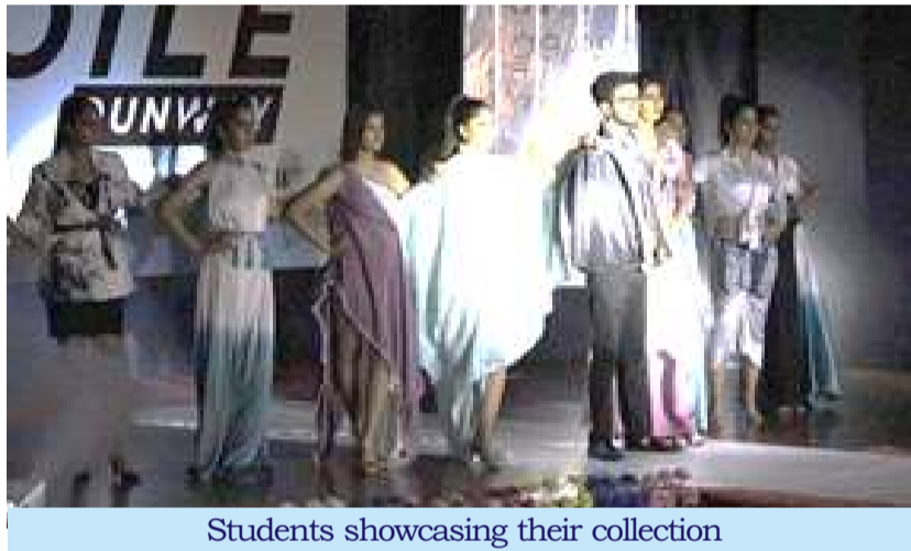
Students showcasing their collection

The student showcase there spectacular collection showed both menswear and womenswear on the ramp which exhibited a graceful amalgamation of grapes and cuts reflecting creativity with extraordinary ideas.