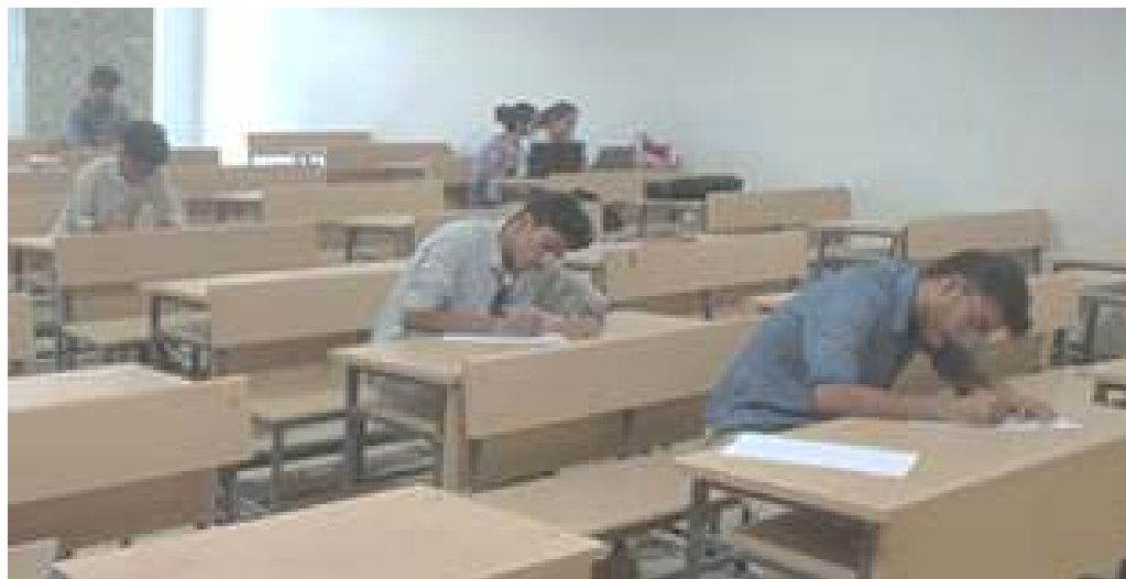
A view of the Essay competition

Indiscriminate disposal of plastic has become a major threat to the environment and it is the need of the hour to have a development of a comprehensive action plan for the elimination of single use plastics.