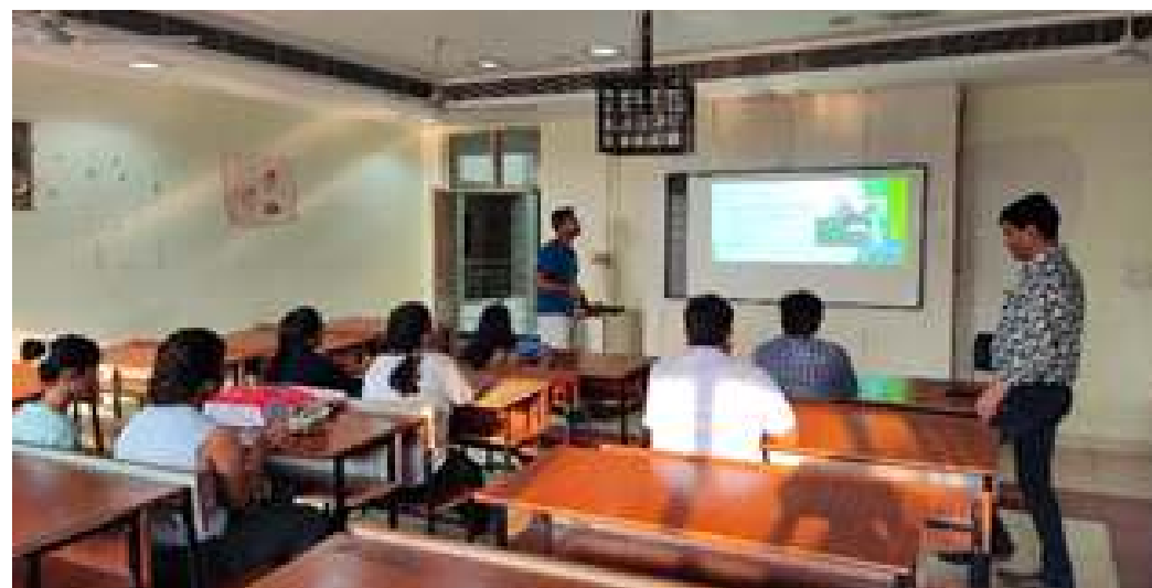
Students making presentation during Hackathon competition

ten students received First prize i.e. Rs. 1000/- Similarly, ten second prize i.e. Rs. 750/- and nine third prize i.e. Rs. 500/-.