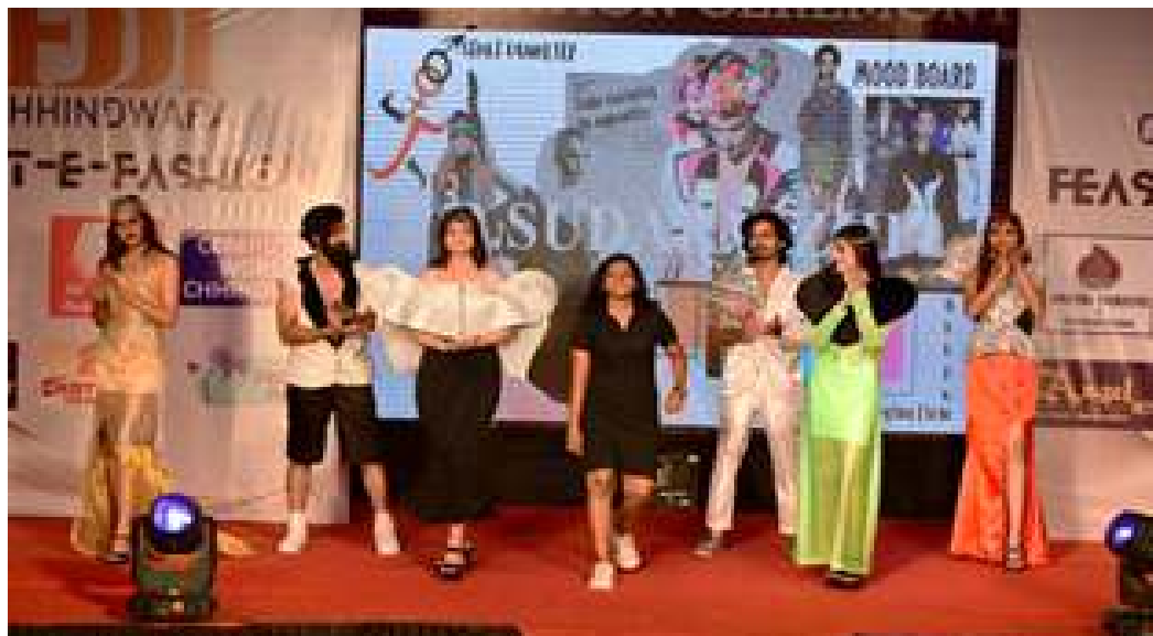
Students showcasing their collection

During the show, 125 Graduating Design collections were presented by the budding designers of FDDI School of Fashion Design (FSFD) of Chhindwara campus in a total of 8 sequences.