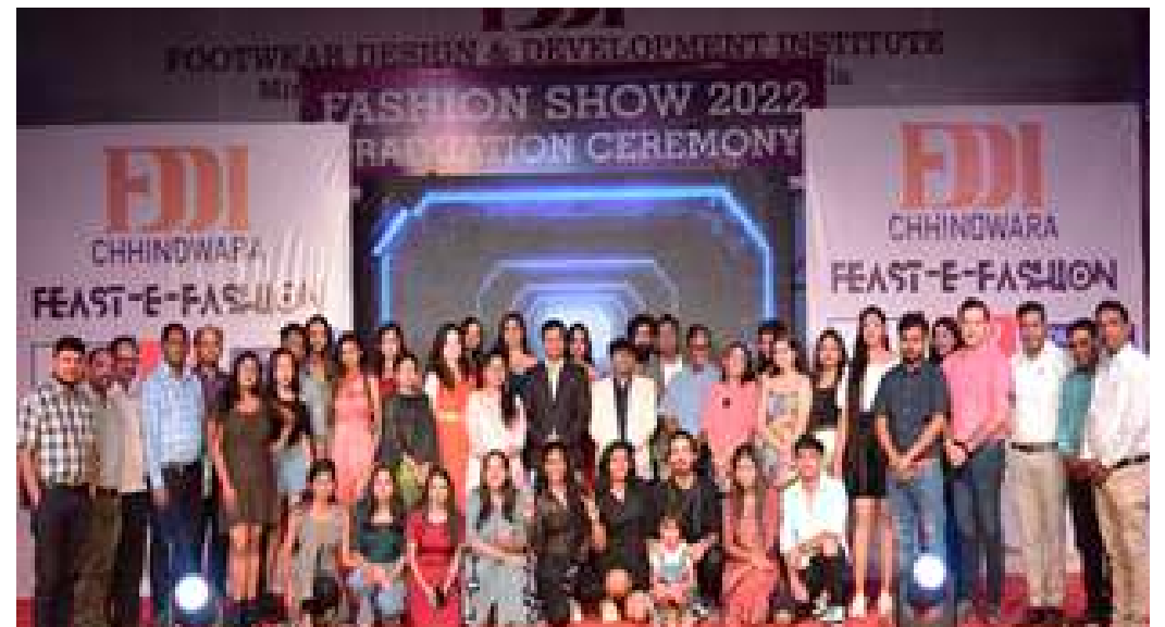
Graduating students along with the dignitaries