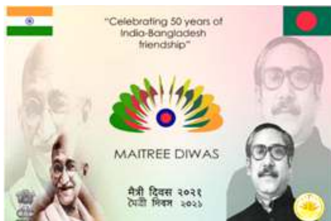
Backdrop designed by Mr. Ashish Raj

The day was designated by Hon'ble Prime Minister of India, Mr. Narendra Modi as Bangladesh- India Friendship Day (Moitree Dibosh) in March 2021.