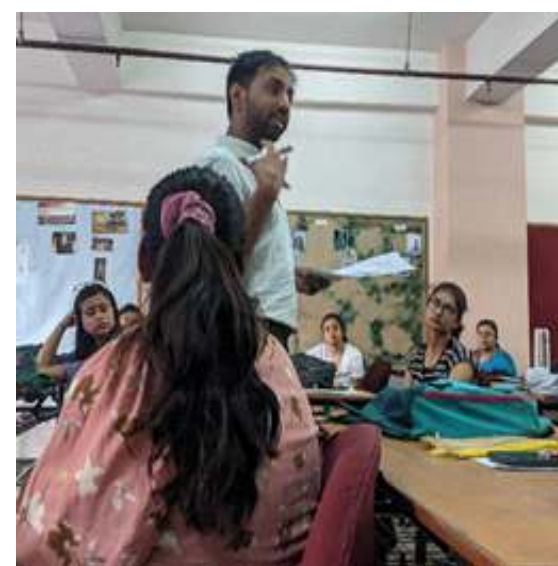
A view of the interactive session