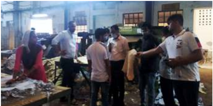
Students alongwith their faculty members watching the process taking place in the tannery at Jay Dee Leather Pvt. Ltd.

Through this visit, the students got an opportunity to learn about the working atmosphere and various functional areas like manufacturing, sequence of lasting operations, quality control, supply chain logistics, witnessed the tanning process & different type of leather finishing, variety of chemicals, machineries & techniques, process of last making, 3D Digitizing and other major operations of the industrial units besides understanding the process of testing of different materials.