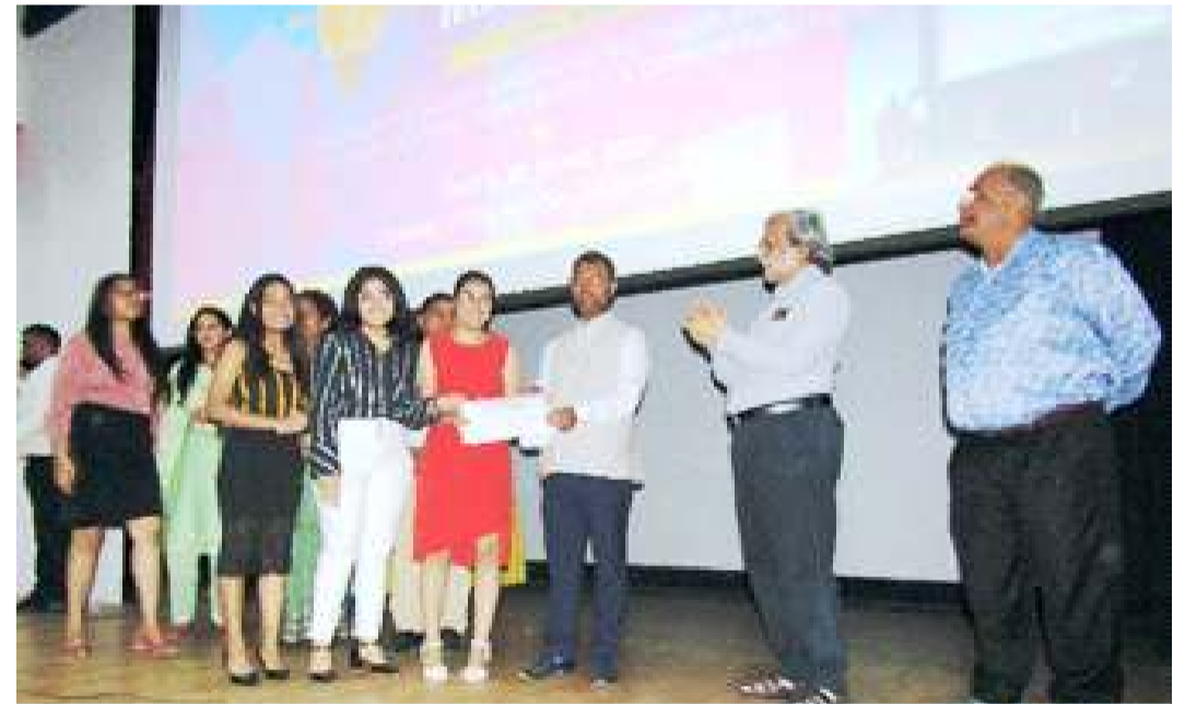
A view of the prize distribution ceremony