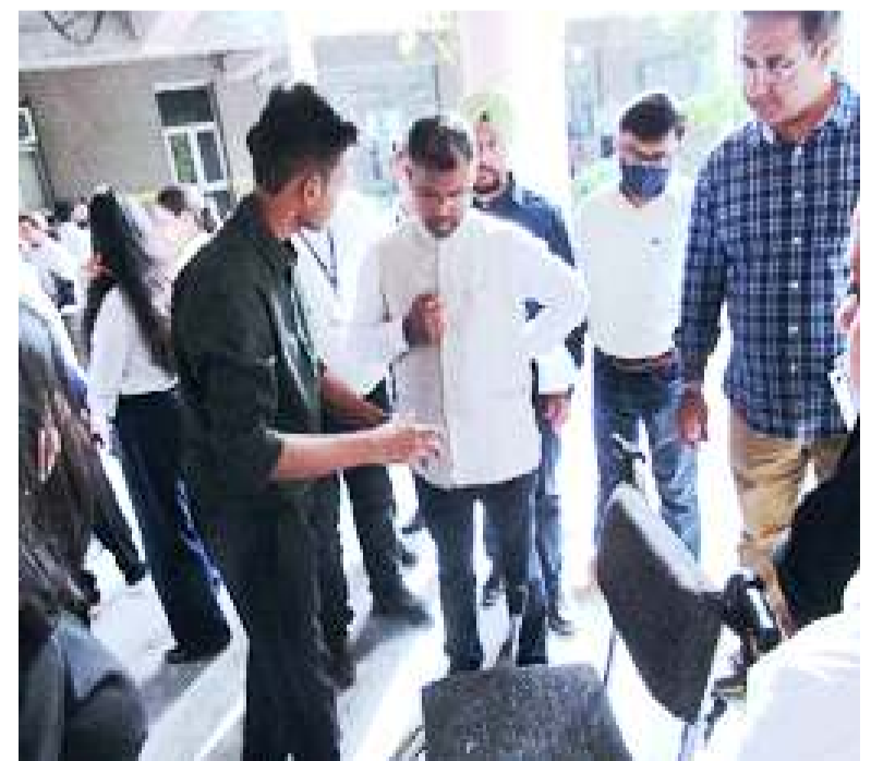
A student explaining his concept to MD, FDDI