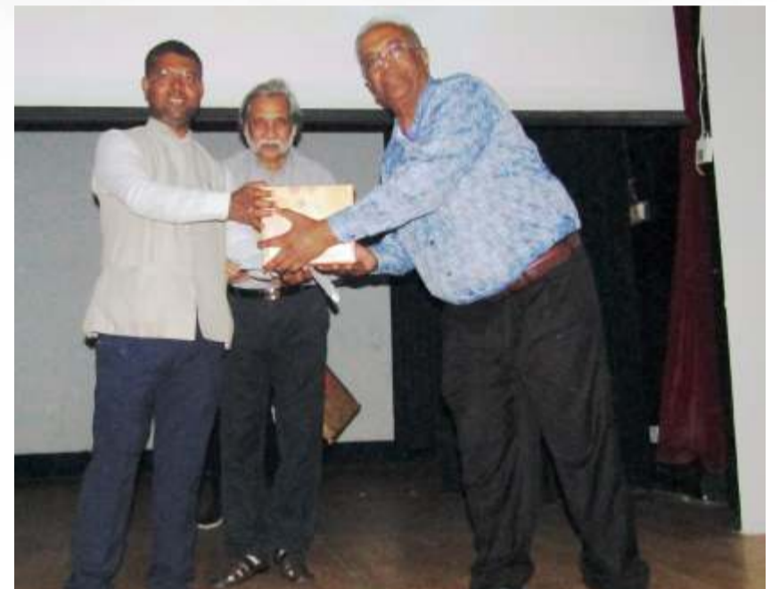
Jury member being felicitated by MD, FDDI

More than 100 students participated & showcased their semester practical projects to a Jury consisting of scholars and senior specialists in design. This event was also attended by industry persons, faculty & staff and media persons.