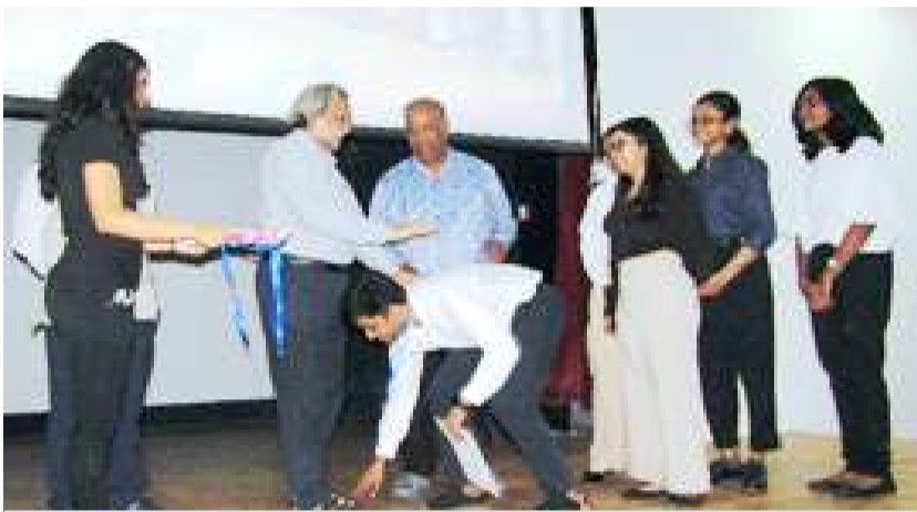
Winners receiving the medals during the prize distribution ceremony

The entire event was streamed live on youtube for wider participation and awareness.