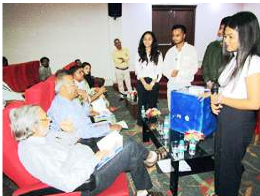
Jury member interacting & analyzing the work done by the students

More than 100 students participated & showcased their semester practical projects to a Jury consisting of scholars and senior specialists in design. This event was also attended by industry persons, faculty & staff and media persons.