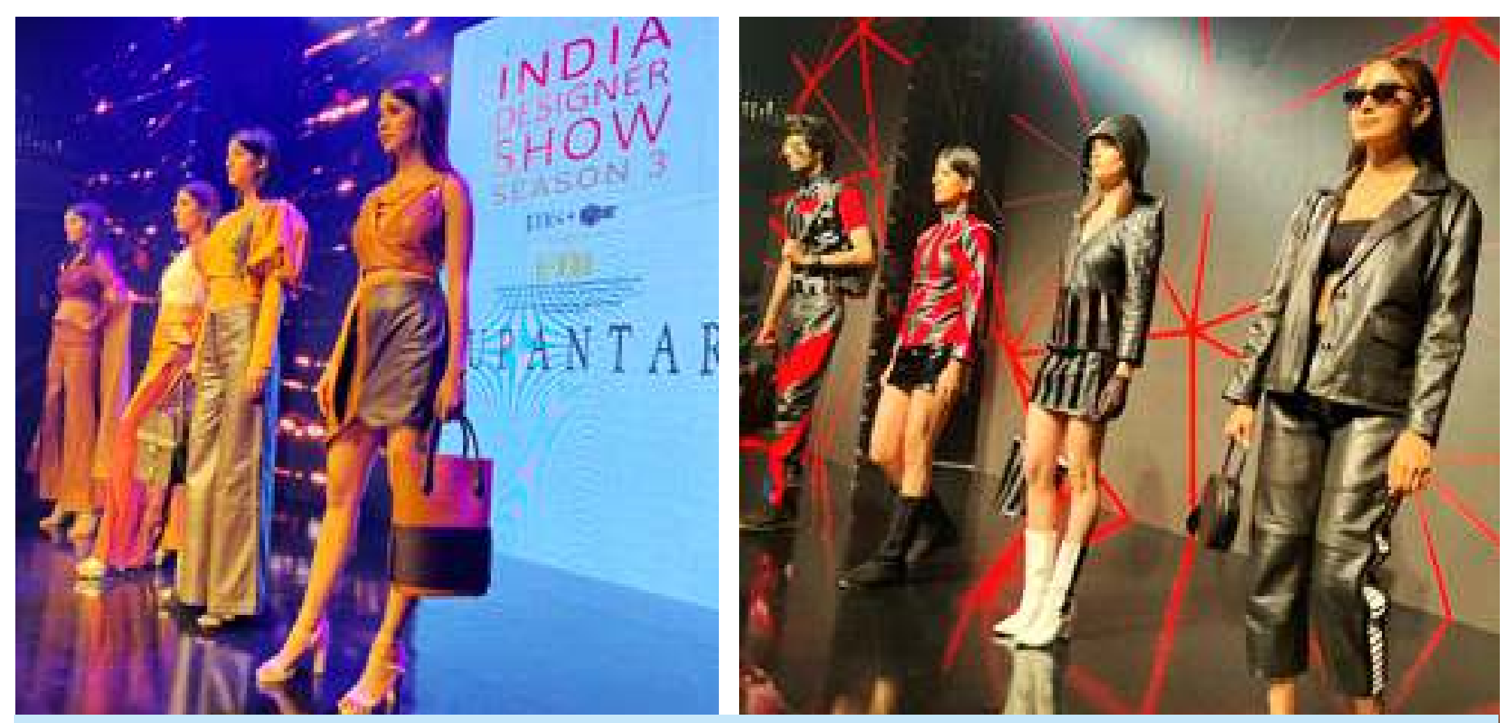
Students presenting their collection

A total of 41 designer students of School of Leather Goods & Accessories Design (LG&AD) from three campuses of FDDI, namely, Noida, Banur & Kolkata showcased their talent in front of an audience which consists of industry people, academicians, media persons and others.