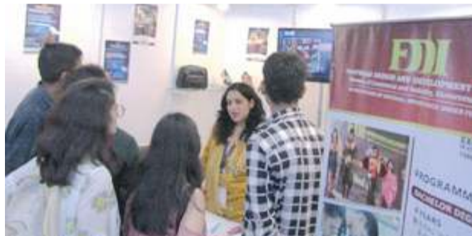
Information about the academic programmes being provided to the aspiring students

IIFF had display of entire range of products relating to footwear and leather industries: footwear, raw material, finished products and auxiliary products such as synthetic material, finished leather; shoe components - uppers, soles, heels, counters, lasts; footwear machinery and equipment, process technology, software, chemicals and publications.