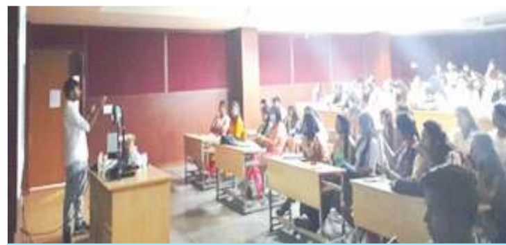
Workshop in progress

Mekuva Technologies is a prototyping company that specialized in manufacturing professional 3D printers, providing 3D printing services, Industrial design, and various conventional manufacturing services.