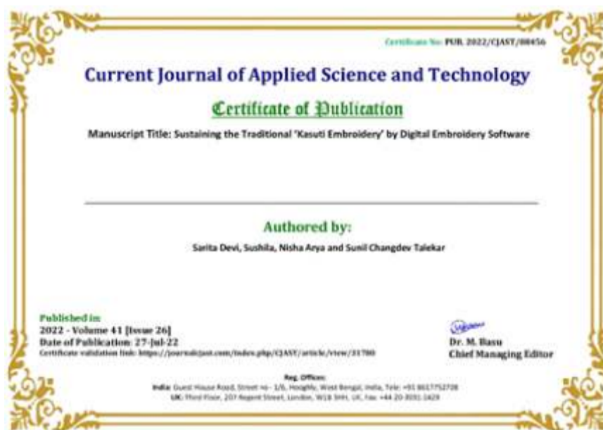
Certificate of Publication

This research study has been published on 27 th July 2022 in Vol. 41(Issue 26) from page no. 40-45 bearing ISSN: 2457-1024 and is available online at the link https://journalcjast.com/index.php/CJAST/article/view/31780 .