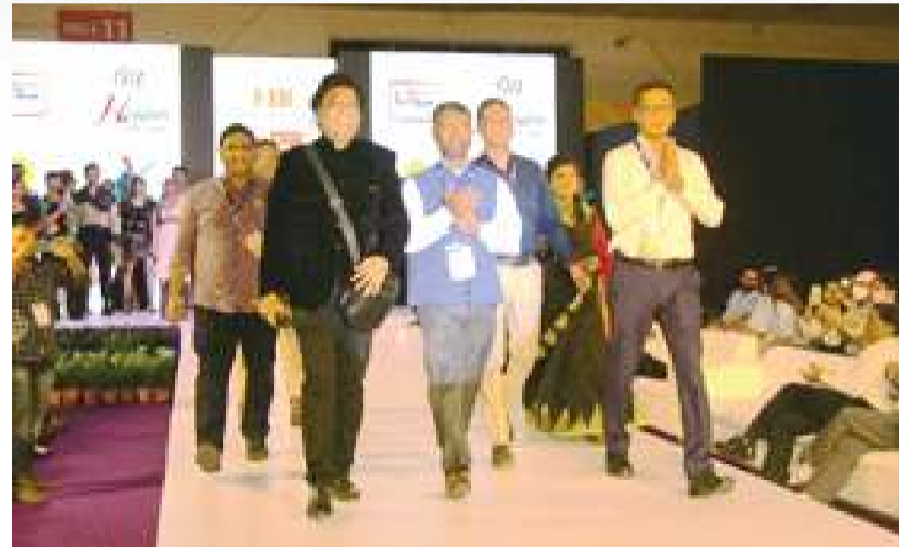
Organizers walking on the ramp

Audience was mesmerized by the grace and beauty of the entire show. The event was a huge success as it was well appreciated in the form of thunderous applause after the show.