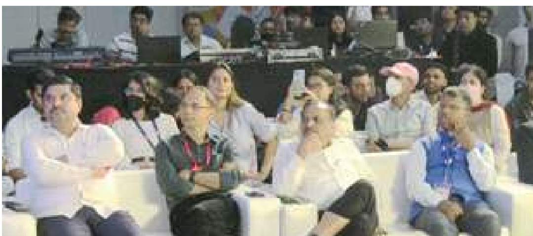
A view of the audience present during the 'Fashion Show'