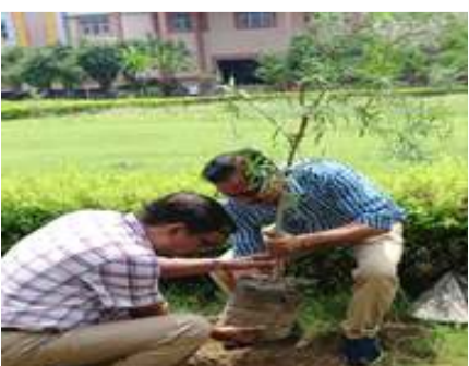
A view of the plantation drive