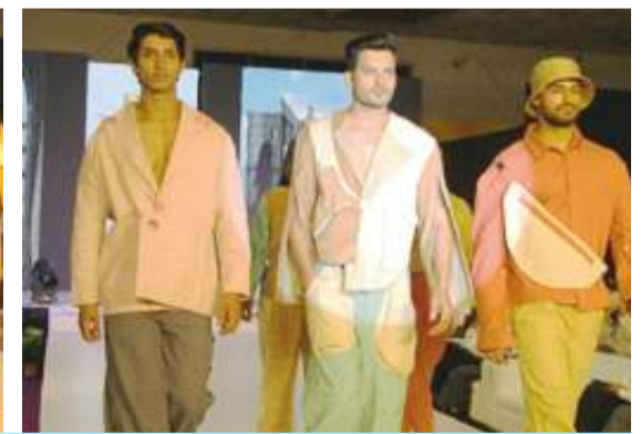
FDDI students walking on the ramp