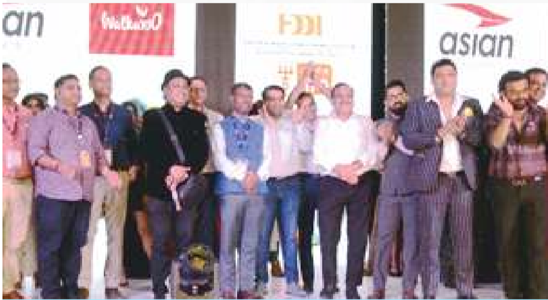
A view of the organizers on the ramp