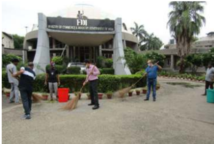
Cleanliness drive at FDDI, Noida campus

The Hon'ble Prime Minister of India, Mr. Narendra Modi had launched the ambitious Clean India Programme,