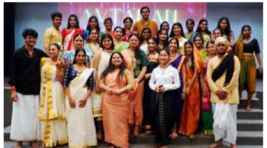
The SFD, batch 2021 with the faculty

The first edition of 'Avtaran 2022' was brilliantly executed and performed by the students of School of Fashion Design (SFD), batch 2021 who not only adorned 33 different drapes of India, but, also modeled in the event. The show was part of a project given to students under new SFD curriculum.