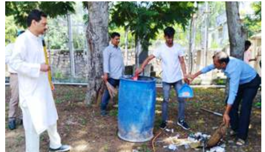
A view of cleanliness drive at FDDI, Hyderabad campus