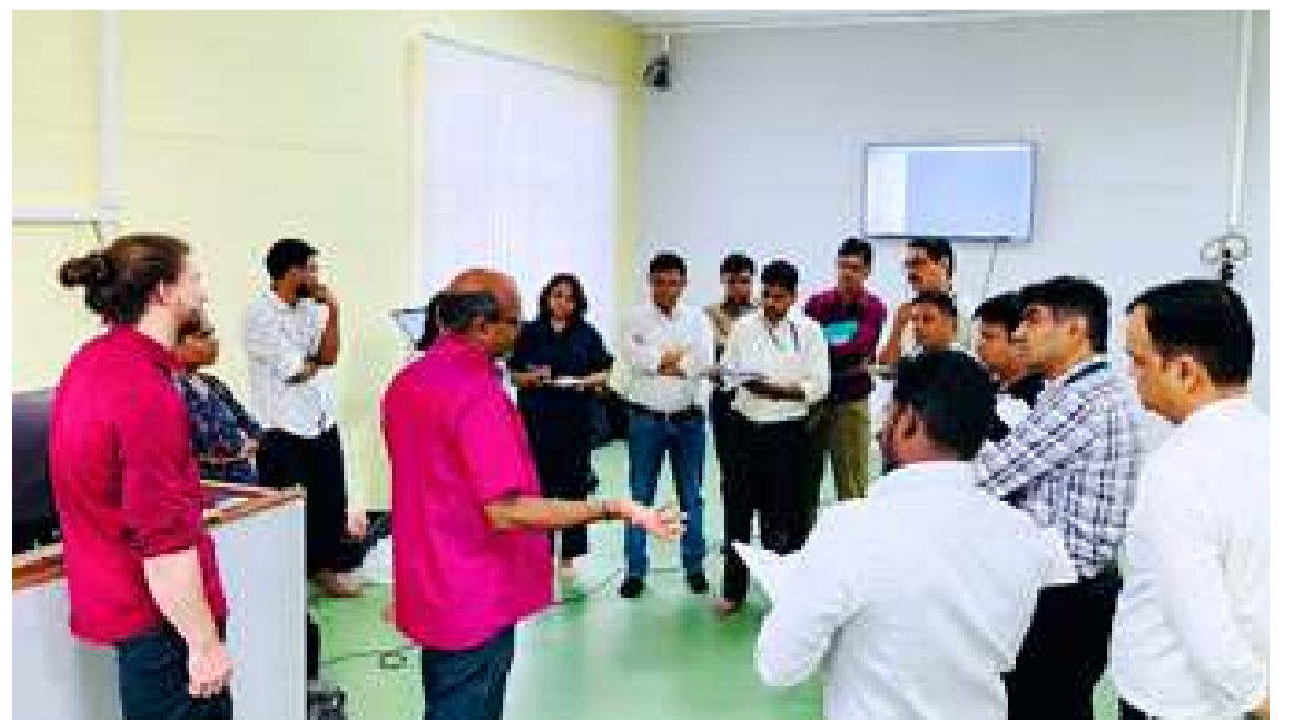
Participants attending the programme