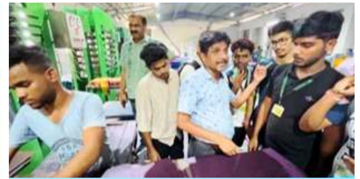
Students being provided technical knowledge by the experts