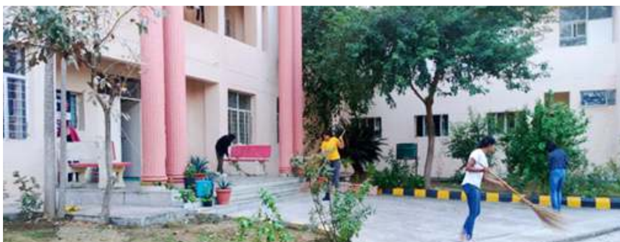
A view of cleanliness drive at FDDI, Rohtak campus

popularly known as 'Swachh Bharat Abhiyan' on 2 nd October 2014. With the aim of creating a clean India, it is necessary to bring change in our behaviour and mindset as this activity is not one time but, a continuous exercise. Following this as its guiding philosophy, 'Swachhata Diwas' was held during which the staff of FDDI enthusiastically participated in the cleanliness drive.