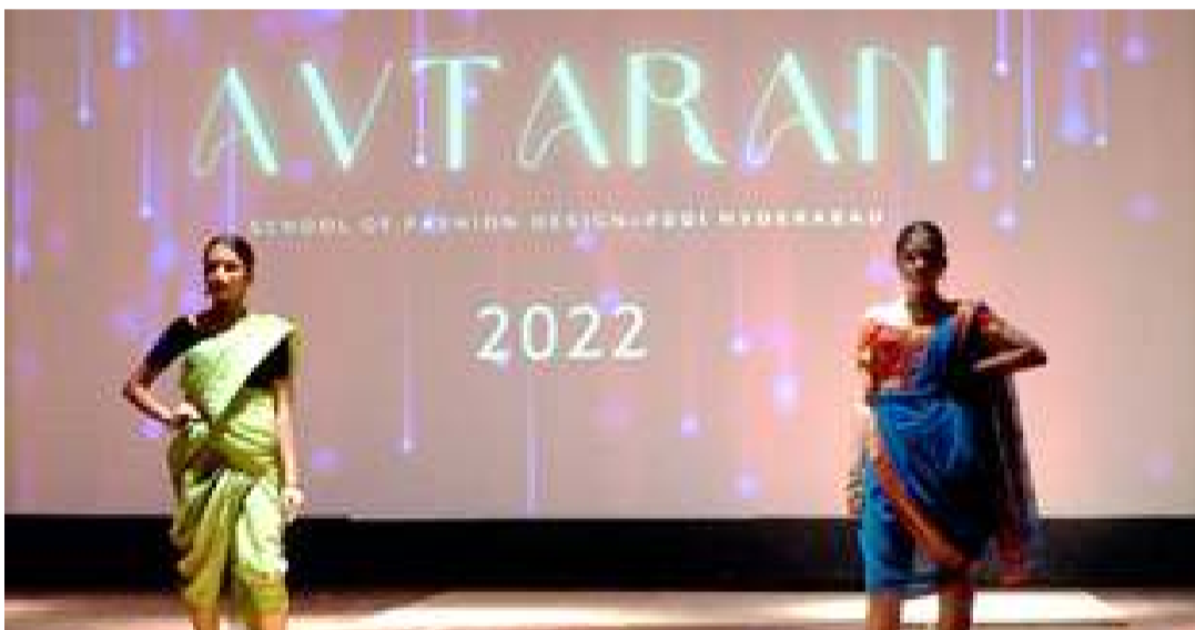
Students showcasing their collection

Adhering with the ideology of the Hon'ble Prime Minister of India, Mr. Narendra Modi on promoting India's rich cultural heritage and handloom, a fashion show on traditional Indian drapes, 'Avtaran' was held at Footwear Design & Development Institute (FDDI), Hyderabad campus on 27 th September 2022.