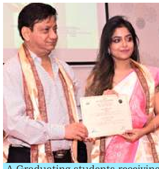
A Graduating students receiving Degree from the Chief Guest

Marking the successful completion of the young graduates of the respective professional program, a total of 83 students of session 2018 - 2022 were awarded their degrees. Besides this, 1 gold medal (overall topper),