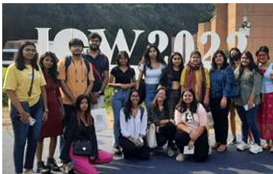
The students along with their faculty members at 'Hunar Haat'

Under the educational tour, on 20 th October 2022, the students of the Footwear Design & Development Institute (FDDI), Noida campus visited the 'Indian Craft Week 2022' (ICW-2022) held at NSIC Ground, Okhla, New Delhi.