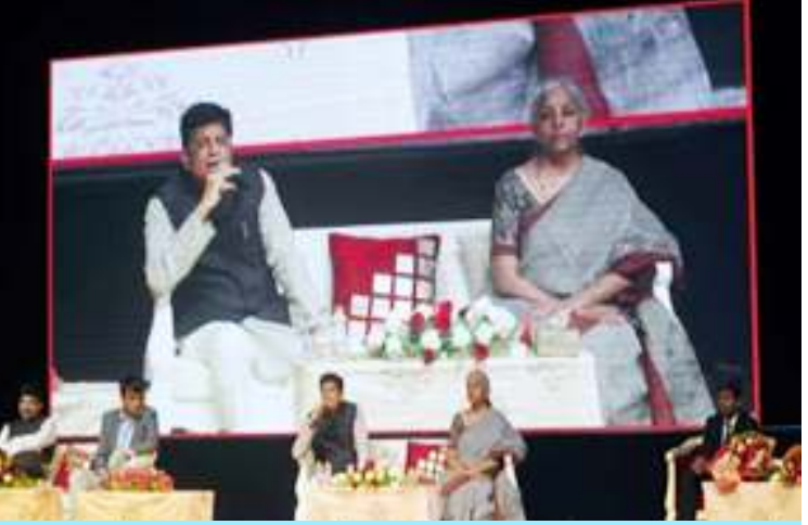
Hon'ble UMF&CA, GoI, Mrs. Nirmala Sitharaman & Hon'ble CIM, CA, F&PD&T, GoI, Mr. Piyush Goyal giving valuable insights during the 'Question & Answer' session

During the 'Question & Answer' session, the questions/queries being asked by alumni/students from different participating institutes were replied/clarified by the Hon'ble UMF&CA and Hon'ble CIM, CA, F&PD&T that paved way to harness the benefits of the digital transformation.