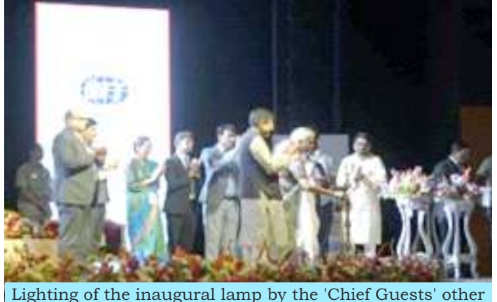
Lighting of the inaugural lamp by the 'Chief Guests' other digniteries

'A talk on Digitalization, Innovation and Entrepreneurship:Pillars of Indian Economic Growth' was held on 29th October 2022 at Shilpakala Vedika, Shilparamam, Hi-Tech City, Hyderabad.