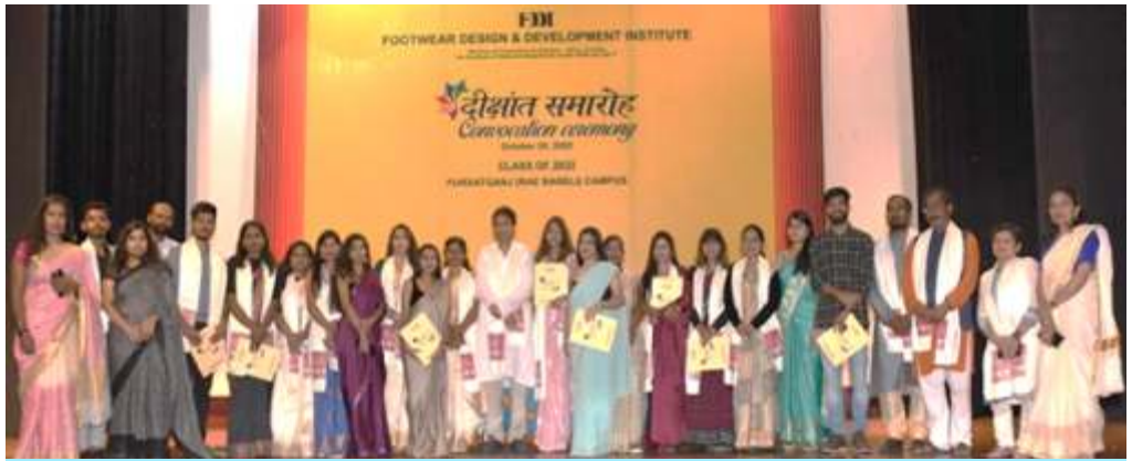
The passing-out batc

All the dignitaries extended their best wishes to all passing-out students for a prosperous future and to bring glory to the country as well to the institute.