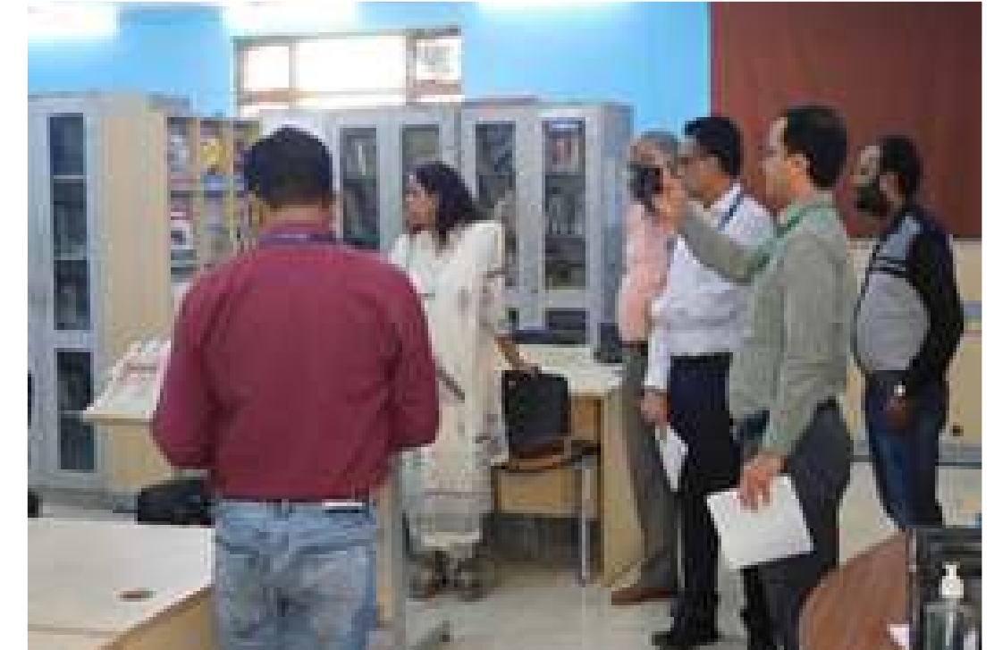
A view of inspection at FDDI, Noida campus