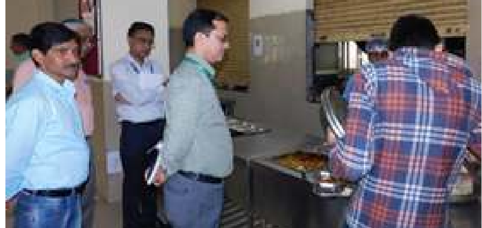
A view of inspection at FDDI, Noida campus

The officials suggested that with the aim of creating a clean India, it is necessary to bring change in our behaviour and mindset as this activity is not one time but, a continuous exercise.